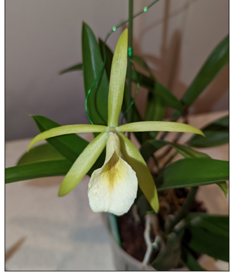
Procatavola Key Lime Stars

When the first iteration of this cross between B. nodosa and C. Lulu was registered in 2003 the name was appropriate for the results. Two clones were awarded with heavy spotting and plenty of color. However, in this remake that has flooded the market recently, the hybridizer used a tetraploid B. nodosa instead of the usual diploid. In every instance I have seen where a famous B. nodosa hybrid was remade with a tetraploid form, the results were well below expectations. It seems that the higher chromosome count causes that species to totally swamp the influence of the other parent. While still a nice orchid to grow that should be easy, vigorous and floriferous as a mature plant, most seedlings will not match the showiness of the original. Several years ago, I bought a few compots of this remake, and as they have begun to flower, one by one, most have turned out simply all white, while a few of some spots in the lip or some lavender on the petals, but otherwise very little of the flashy color and pattern of C. Lulu has made an appearance. Count me as one of the unimpressed this time around. It seems the clown has had the last laugh!