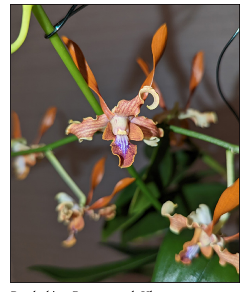
Dendrobium Butterscotch Ube