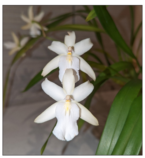
Miltonia regnelii form alba

This beautiful species is often seen listed as Miltonia spectabilis var. moreliana , but Kew accepts the above name that was applied in 1848. Both Milt. moreliana and Milt. spectablis grow in the state of Espirito Santo in Southeast Brazil, but that latter species has a much wider range that extends into other adjacent states. Both grow in mountain forests where the temperatures favor cool to mild and any day over 90F would be approaching record heat, so it will be easier to grow here in this area in a controlled environment.