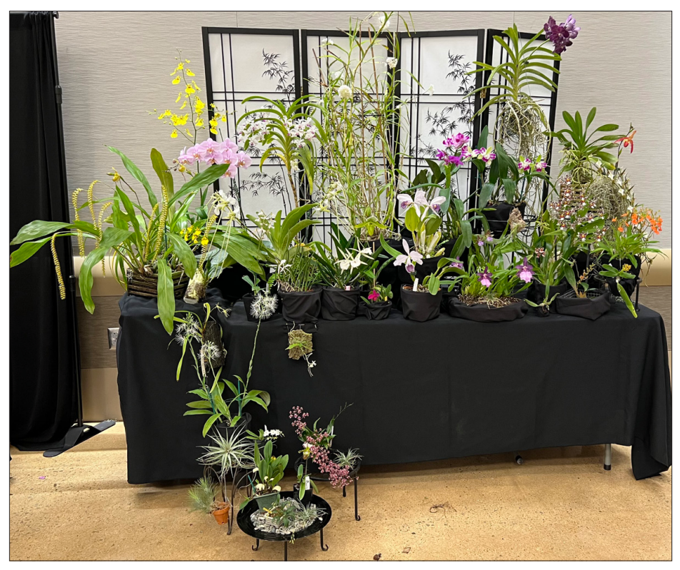
Atlanta Orchid Society's entry to the 2022 Alabama Orchid Show and Sale at the Birmingham Botanical Gardens, 17–18 September 2022, before ribbon judging. The Exhibit Committee worked all day on the 16th to set up this beautiful exhibit. For more, go to p. 4