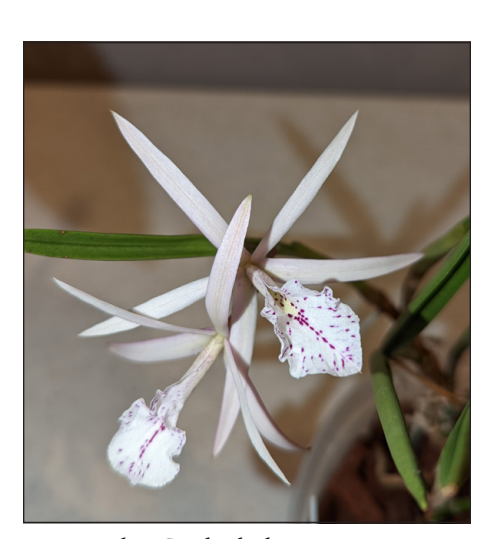
Brassocattleya Sarah Black