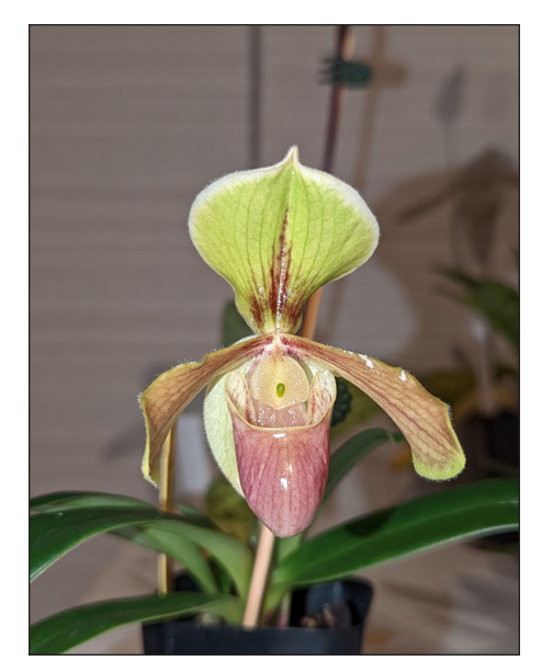
Paphiopedilum Hengduan's Qin