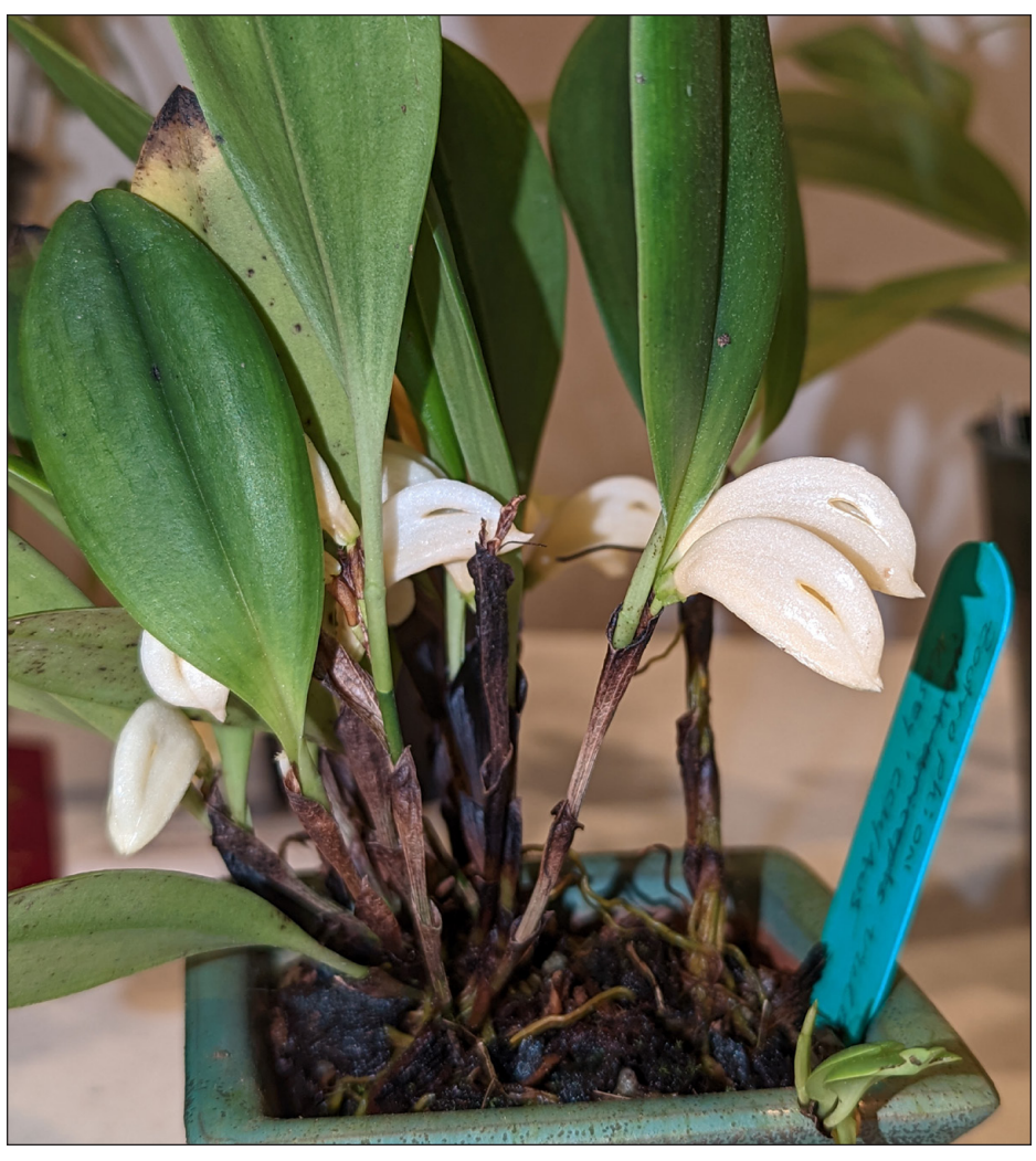
Zootrophion vulturiceps 'Casey'

White - Pectabenaria Unbertide - Nicholas Rust