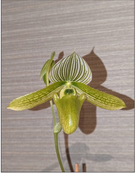
Paphiopedilum Green Sentinel

This primary hybrid between Paph. helenae (Northeast Vietnam) and Paph. villosum (Burma) was only recently registered in 2019. Because the former species is one of the smallest of all Paphiopedilum, this plant should make a very compact clump of growth when fully mature. The look of the flower is very close to midway between both parents, and the hues may intensify over a couple of weeks as the yellow base color develops more fully. Both species come from several thousand feet up in the mountains in their respective habitats and therefore would not do well outside in summer heat in our area. While there is a prolonged dry season in winter, they come from microclimates that stay damper and more humid than surrounding areas, so while watering may be somewhat less then, the pot should never be dry throughout.