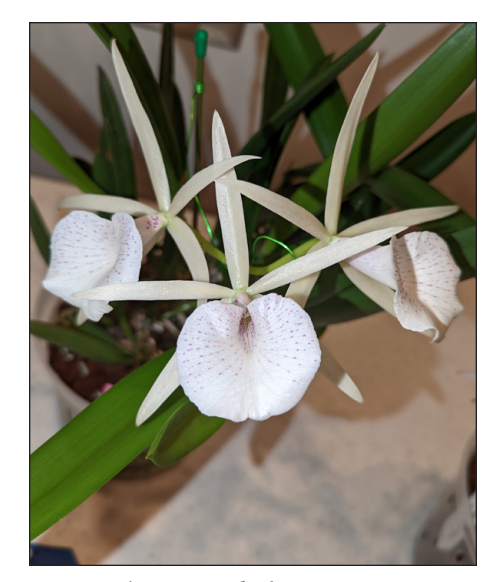
Brassocattleya Spotted Clown