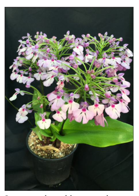
Some eye candy to celebrate out 75th anniversary! ( Cynorkis guttata )

We'll have our usual show plant table so bring your beautiful orchids in for ribbon judging. We'll also have a silent auc-