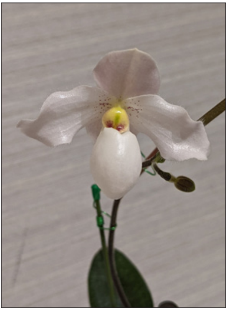
Paphiopedilum Gina Short

White - Paphiopedilum Gina Short - Fi Alonso & Jon Crate