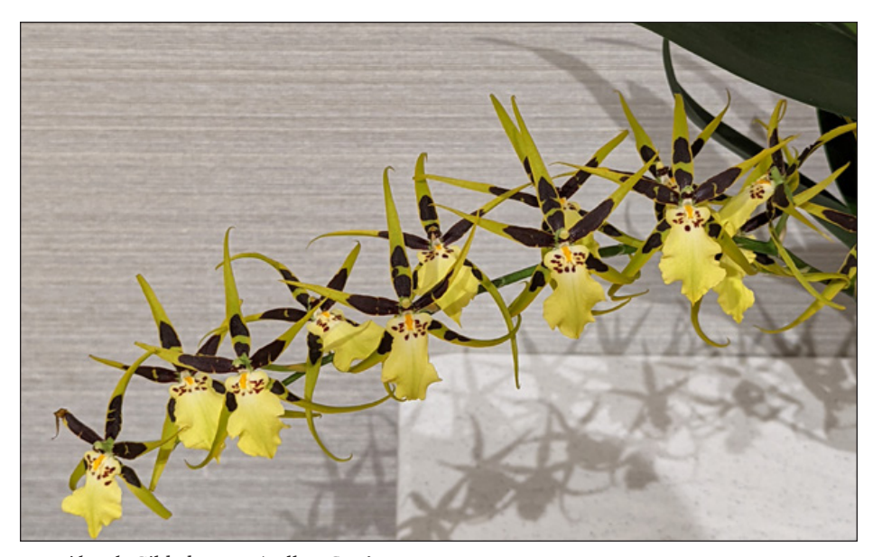
Brascidostele Gilded Tower 'Yellow Star'