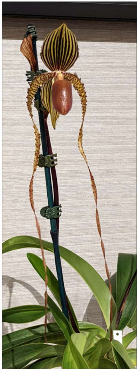
Paphioedilum Prince Edward of York

base leaves that blooms in the spring on an erect, shortly but densely white pubescent, erect, 2.4 to 6.8" [6 to 17 cm] long, single flowered inflorescence with conduplicate, broadly ovate, obtuse, pale green, spotted purple floral bracts."