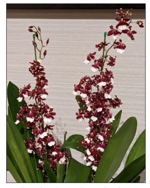
Oncidium Aka Baby 'Raspberry Chocolate'

on 209 inflorescences; sepals and petals clear white with brown and gold markings; magnificent plant one meter tall and 190 cm in circumference including inflorescences, flowers and leaves in perfect condition, truly a cultural triumph, flowers of fine, full shape."