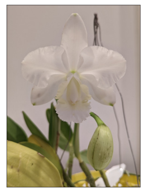
Cattleya x dolosa fma. alba