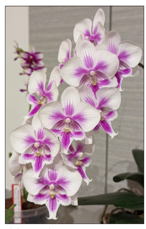
Phalaenopsis Charming Warszawa