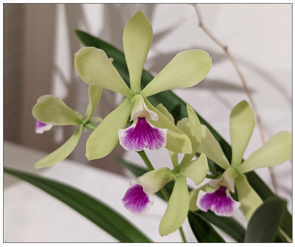
Catcyclia Leaf Hopper