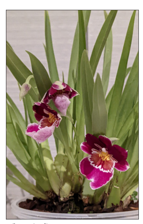
Miltonopsis Edie Brown