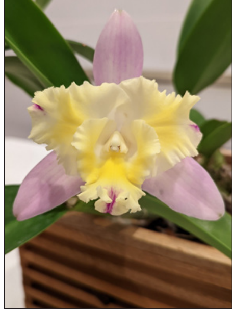
Cattleya Little Dipper x Cattlianthe Tropical Aurora

The way I have listed the name is how Kew accepts this orchid, as a natural hybrid rather than a species. Presumably it is a mix of C. walkeriana and C. loddigesii, but probably not a straight 50/50 mix, but a second or third generation that crosses back to C. walkeriana. Unlike that species, which often flowers from a leafless shoot from the rhizome, C. x dolosa flowers from the top of the pseudobulb with one or two leaves, but grows short and tough looking, like C. walkeriana. The original plant was found in the state if Minas Gerais in the interior of southeast Brazil, where the landscape is somewhat desolate, but where more humid microclimates exist near streams in forested ravines. The alba form appears to be a man-made version that uses the white forms of the two species involved. There are also coerulea and semi-alba versions that have been created. Last year, a white form with the clonal name 'Mirtha Isabel' received a phenomenally high score of 93 points, earning it a First Class Certificate. This plant was bred and bloomed by former ATLOS member, Ben Oliveros who now lives on the island of Hawaii.