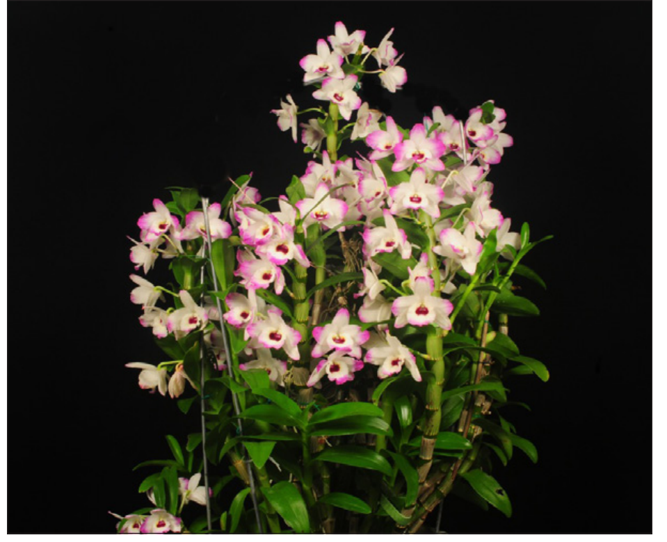
Den. Love Memory 'Fizz'