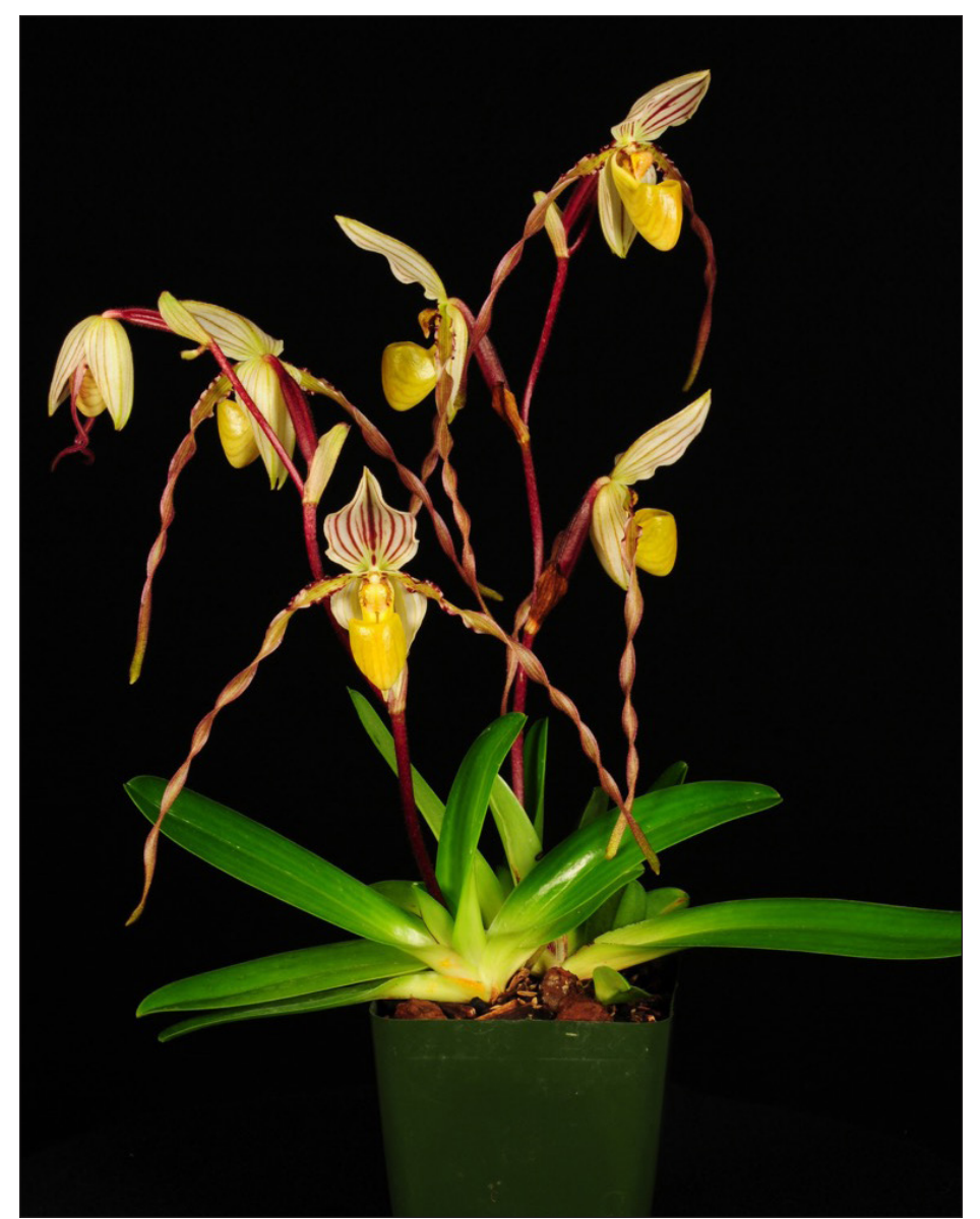
Paph. philippinense var. compactum 'Windy Hill's Sprite'