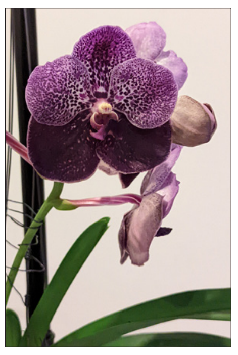
Vanda Robert's Delight 'Black' AM/AOS

preciates nights in the mid-50's during the cooler months for optimal health. In summer, rainfall is heavy and frequent in its natural habitat, with lower amounts in late fall and winter. However, it is suggested that V. falcata should never be allowed to completely dry out during this rest period, but fertilization should be