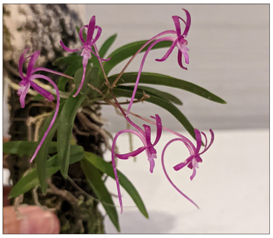
Vanda falcata 'Pink Shower' x 'Lavender Dream.'