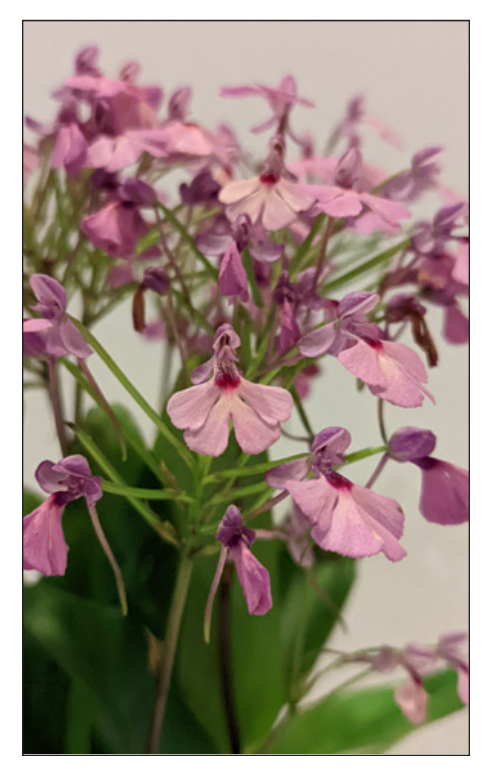
Cynorkis angustipetala 'Mello Spirit'