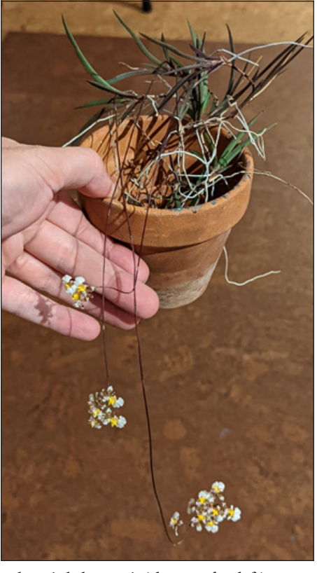
Tolumnia bahamensis (above and at left)