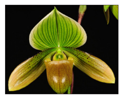
Paph. Hawaiian Appeal 'CofO Green Apples'