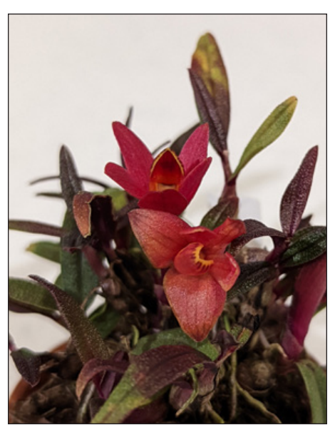
Dendrobium Aussie's Hi-Lo