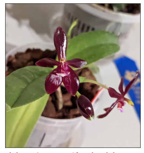
Phalaenopsis cornu-cervi fma. chattaladae

showing through from one parent and the concentration of color toward the center of the bloom from the other. The seven species that make up almost 95% of the total genetics of this orchid are all considered easy to grow, so the resulting hybrid is likely forgiving of a casual approach to cultivation.