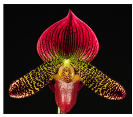
Paph. Delighfully Fred 'MBF'