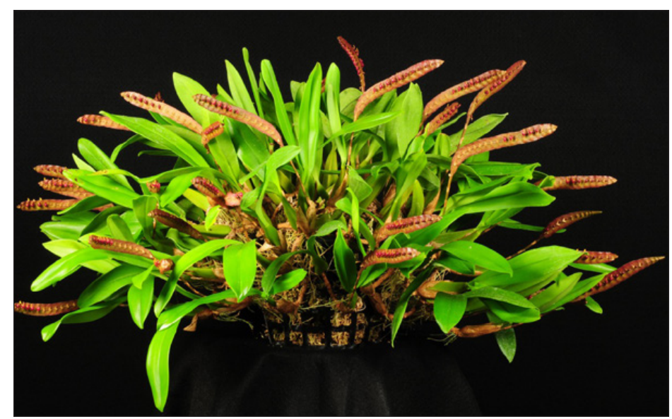
Bulb. Sue Blackmore 'Windy Hill'