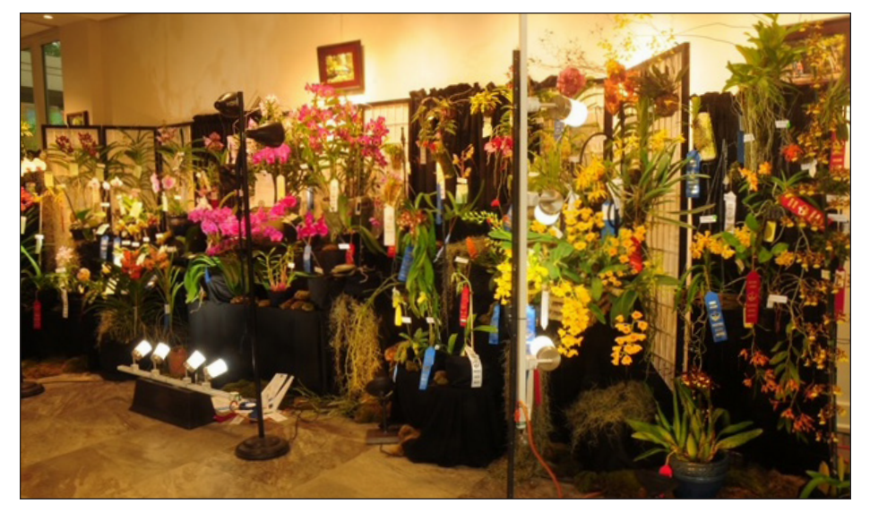
AOS Show Trophy

20222078: Paphiopedilum philippinense var. compactum 'Windy Hill's Sprite,' CHM/AOS 83 points. (This is a provi-