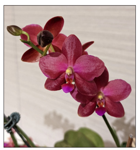
Phalaenopsis Shenandoah Fire 'Ember'

Registered by Char Ming Agriculture of Tawian, the first part of the name of this definitely charming orchid is obvious. Why they chose the capital city of Poland for the second part of the name is more difficult to guess. That firm has registered about 45 Phalaenopsis crosses in the last decade and all the chosen names begin with "Charming." This one is a great grandchild of Phal . World Class 'Big Foot' which gives it the flatter lip. The overall color pattern is very fresh and a little different with some striping