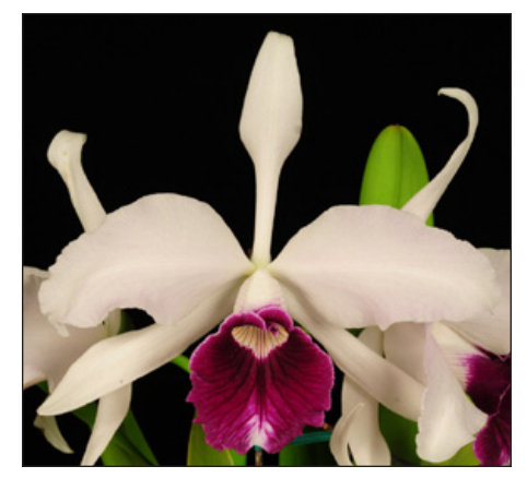
C. purpurata var. schusteriana 'Purple Velvet'