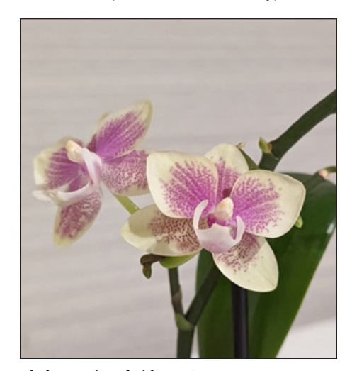
Phalaenopsis Hybrid No ID

You can help out the Atlanta Orchid Society simply by shopping at Amazon through their Amazon Smile program. To do this simply go to smile.amazon.com every time you want to shop at Amazon. When you go to checkout for the first time, you will be asked to designate your charity. If you type Atlanta Orchid Society in the search bar, we are the only result that comes up. Select that one. You can change the charity at any time, by following the directions on the About page. All of the details of the Amazon Smile program can be found on the Amazon site at: smile.amazon.com/gp/chpf/about/