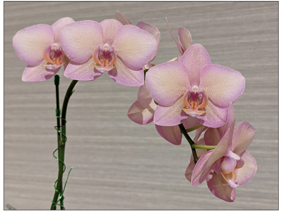
Phalaenopsis Adobe Rose