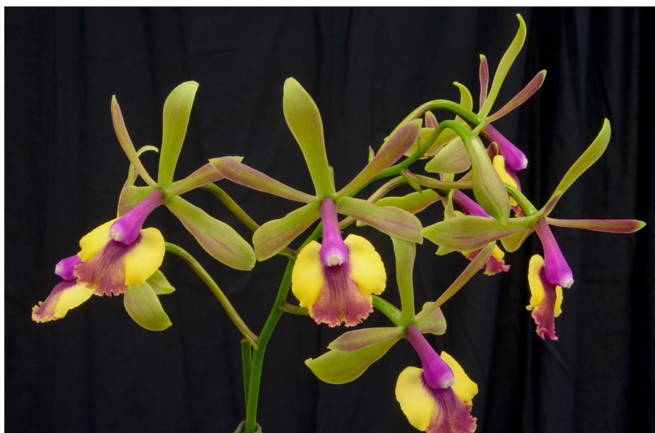
Epicatcycia Bloody Nose 'MBF'