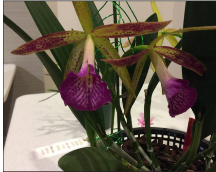
Bc. Tigrinodosa 'JonFi' HCC/AOS

This pairing of Rlc. Goldenzelle and C. harrisoniana is quite a bit more pastel than I would have expected as the latter species often intensifies the overall color of the flower. It is possible that these flowers have only recently opened and will achieve a slightly deeper color when fully mature. The lip has the paler color and closed "bell" shape you would expect from C. harrisoniana , and the tall and slender growth habit is a result of that species' influence as well. At one time C. harrisoniana was considered a variety of C. loddigesii , but any experienced cattleya breeder knows that the results are usually quite different depending on which species is used as a parent. C. loddigesii will usually "swamp" the other parent with the new hybrid flowers showing a strong resemblance to that species, whereas C. harrisoniana , as I previously mentioned can intensify the color without dominating the form of the flowers. If you are not sure which species you have in your collection due to confusing tags from the past, here is an easy way to tell the two apart. C. loddigesii is usually a somewhat shorter grower, with broader leaves and blooms in winter on a fully formed and rooted new growth. C. harrisoniana is usually taller and more slender with narrower leaves, and blooms in mid to late summer on a new growth before it has formed roots.