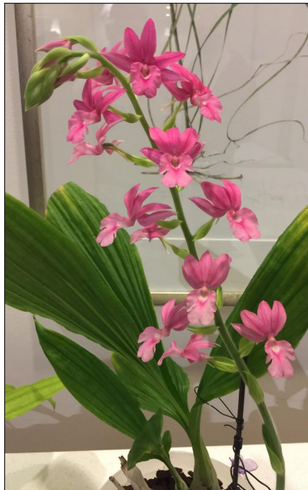
Calanthe Rose Georgene 'Electric Pink' HCC/AOS

When this particular variety was awarded in 2008 it had 5 flowers that were 9 cm. across, or about 3.5 inches. Based on the photo I received the 6 flowers on Jason's plant could be even larger. However, this size is common for Catesetum pileatum and sometimes the bloom can be more than 4 inches in spread. It should be noted that we are talking about male flowers as this one on of the few orchid genera that bears separate male and female flowers, that latter looking quite different with in inverted pouch like lip and smaller overall spread. Both types, however, can be produced on the same plant depending on growing conditions. There is considerable variation in color in this genus from white, to green, yellow and nearly red. It is a heat loving orchid from the wet lowlands of Colombia, Brazil, Ecuador and Venezuela and while deciduous, it does not experience complete dryness in winter and should be given some water if the pseudobulbs start to shrivel. As you would expect from such an imposing species, there are numerous awards for it worldwide and nearly 500 registered hybrids descend from it.