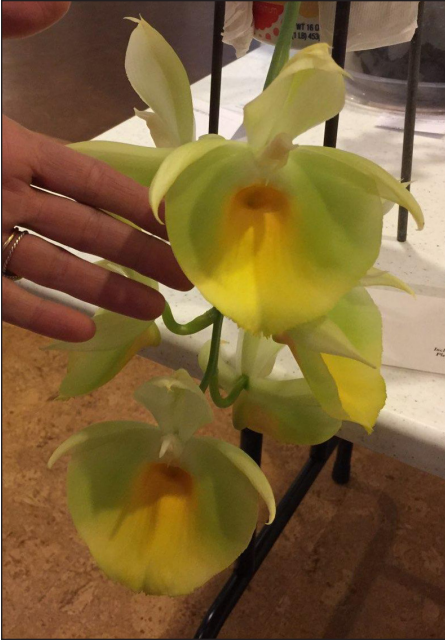
Ctsm. pileatum 'Jumbo Green Gold' HCC/AOS