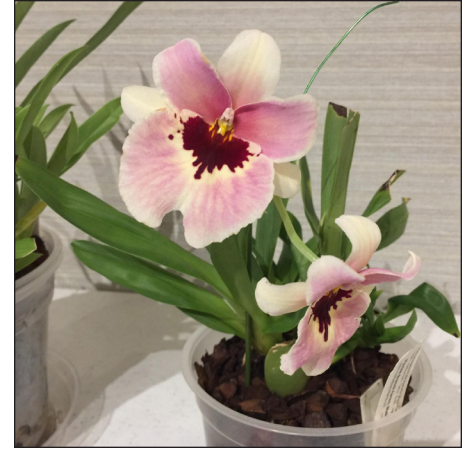
Miltoniopsis Pink Aurora

There are 42 documented species of Macrolinium scattered throughout South America, mostly in the wet forests on the eastern slopes of the Andes that drain into the Amazon Basin. Mcm. aurorae is a particularly tiny grower found near the town of Satipo, in the department of Junin, Peru. Not a lot of information is written about it, but here is the brief description from Jay's Internet Orchid Encyclopedia: "Found in Junin Peru at elevations around 750 meters as a super-mini sized, hot to warm growing epiphyte with very small, inconspicuous pseudobulbs enveloped completely by 3 to 4, distichous, imbricating sheaths with the uppermost 2, leaf bearing and carrying a single, apical, thickened, lanceolate, acute leaf that is somewhat "U" shaped in cross section and has wrinkled, garnet-red, raised network on sunken green background and blooms in the late spring and summer on an axillary, erect, slender, 1.4" [3.5 cm] long, racemose inflorescence arising on a recently matured pseudobulb and carrying the several [9 to 15] flowers in an apical crowded sphere of flowers." Based on that description Danny & Dianne's plant is blooming rather late. There are apparently no hybrids descending from any of the species in the genus. One can only imagine the difficulty in cross pollinating the tiny flowers by hand!