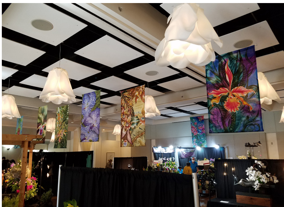
At right: View of Day Hall during the show last month, brilliantly decorated with silk banners painted by Julie Jennings

Oglethorpe Presbyterian Church is located at 3016 Lanier Dr., NE, Brookhaven, GA 30319, one block off Peachtree Road behind Oglethorpe University at the corner of Lanier Drive and Woodrow Way. The main entrance is found via the parking lot behind the church. The upper lot (off Lanier Drive) provides the easiest access to the main entrance.