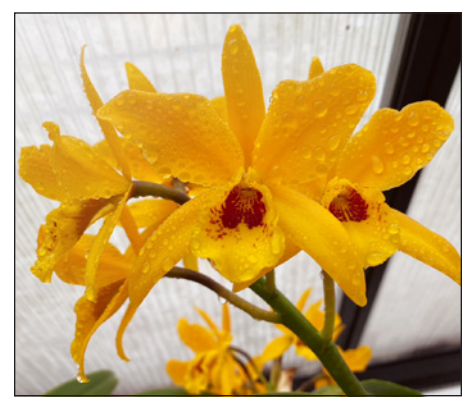
Ctt. Gold Digger 'Fuchs Mandarin'

Several entries owe their good cluster flowering habit to their ancestor Gur. au rantiaca . Those include Rth . East Texas