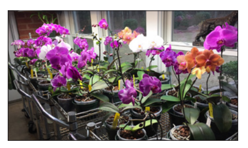
Heidi's Phal. growing area

And finally, Heidi Landau showed us a group of more than two dozen various hybrids, in a rainbow of colors, blooming well next to a bank of windows with supplemental overhead lighting.