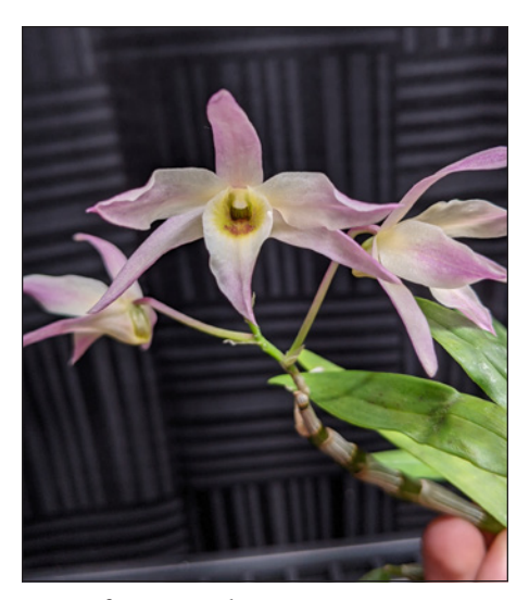
Den. Sofia Boyer, take 2

spread in Southeast Asia it isn't easy to find in commerce. When I finally tracked one down myself, it turned out to be mislabeled and was actually Den. prim ulinum . Still in this group I showed of a first blooming seedling of Den. pendu lum , another species from SE Asia that