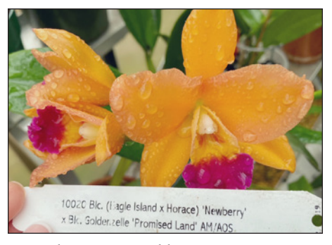
Ctt . Hobcaw x ?, possibly

can produce clusters of five or more flower when mature and a beautifully colored flower mislabeled as ( Rlc . Eagle Island x C . Horace) x Rlc . Goldenzelle. This one comes from Carter & Holmes and somehow got the wrong tag in the pot, as all of the parents listed are big plants with large flowers. I think this may be one of their crosses made with Ctt . Hobcaw as it has a strong resemblance to it in flower and growth habits.