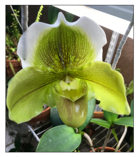
Paph. Stone Crazy

vinicolor types and registered in 2018. On this flowering, at least, both inflorescences are producing a second flower and one may go on to make a third. This is not common behavior in this breeding group. I'll be interested to see if it hap-