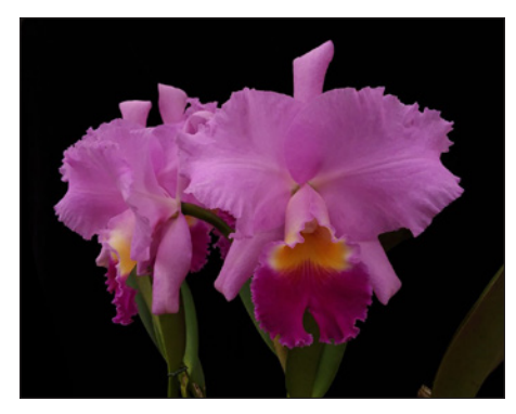
C. Horace 'Maxima' AM/AOS