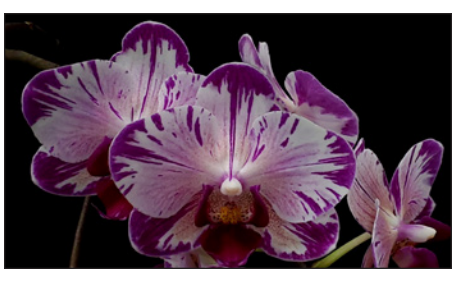
Phal. Little Gem Stripes