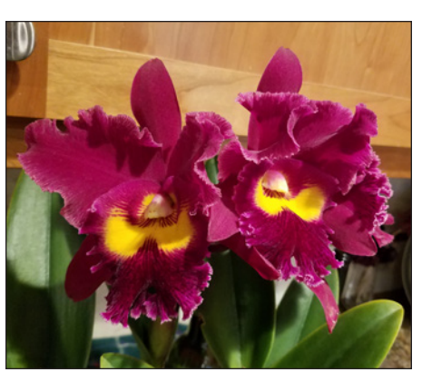
Rlc. Sanyung Ruby 'New Beauty