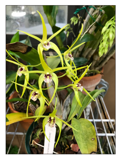
Den. Hilda Poxon

Poxon, which is a cross between Den. spe ciosum and Den. tetragonum . It has been extensively used in the hybridization of