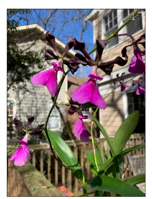
Encyclia cordigera var. rosea

I showed off an interesting hybrid between Epi. stamfordianum and Ctt . Trick or Treat called Epicatanthe Volcano Trick 'Volcano Queen' that has heads of really striking flowers. These are little mericlone plugs blooming for the first time, but they can become larger plants with head of up to three dozen blooms, twice per year, when mature.