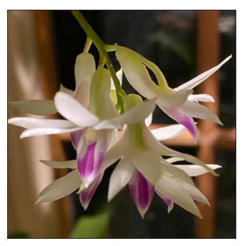
Den. amethystoglossum (top: Bailey's; bottom: HB's)