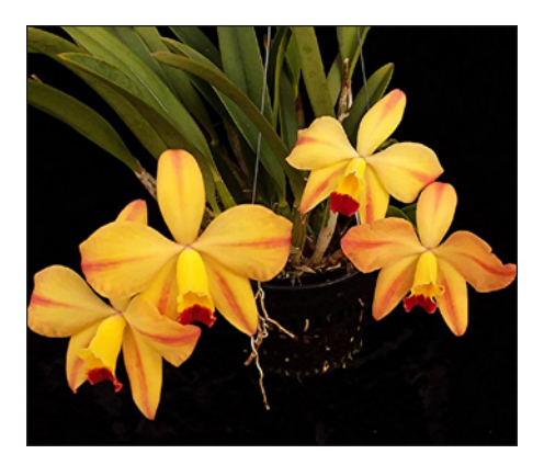
C. Pole-Star x Fire Magic