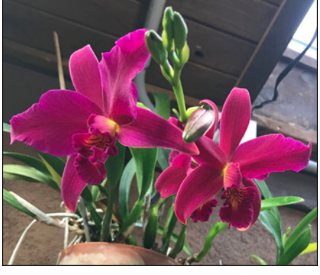
Slc. Hsin Buu Lady 'YT' AM/AOS