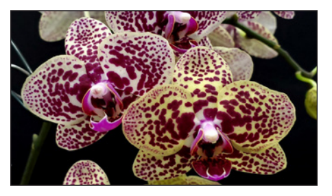
Phal. KV Charmer