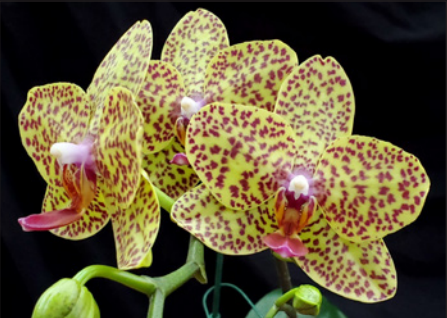
Phal. First Rays Sunspots