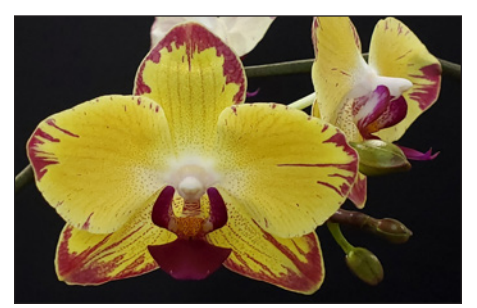
Phal. King Shiang's Princess