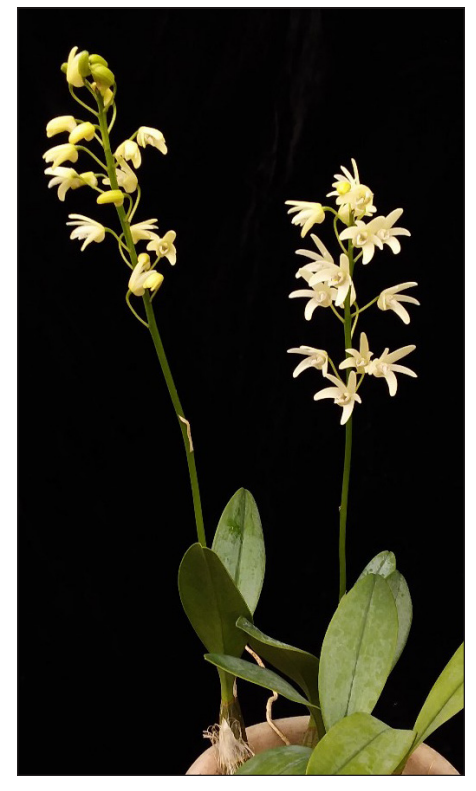
Den. speciosum var. pedunculatum