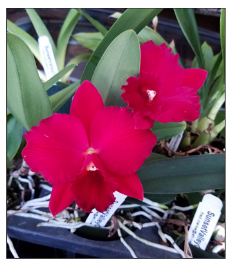
Rlc. Apricot Sands x Loud Nine

flowered hybrids. It is a warm to hot grower and prefers high light levels.