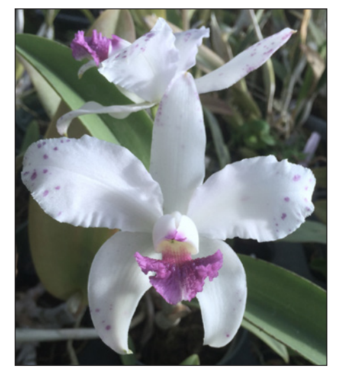
C. amethystoglossa forma coerulea

Finally, we had two different examples of important large flowers species. Jon Crate and Firelli Alonso's C. trianae is native to the mountains of Colombia and is the ancestor of over 23,000 registered crosses. Many fine, full shaped clones were collected early on and have been used in breeding since 1889. I showed a semi-alba form of C. lueddemanniana , a species from neighboring Venezuela. This highly fragrant orchid is very compact considering the flower size and also widely used to create our modern large