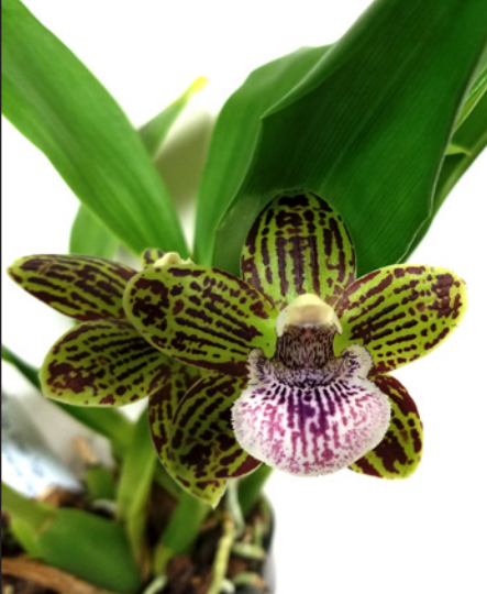
Nottara Lucy's Sassafras

Danny & Dianne showed is the leafless species Dendrophylax funalis, which comes primarily from the karst formations of north central Jamaica known as Cockpit Country, with steep limestone hills thick with vegetation. The plant has chlorophyll in its roots to actuate photosynthesis and can bloom at any time of the year, but with just one white to greenish flower per inflorescence. Exotic Orchids of Maui has found a way to grow it well and in 2010 received a cultural award for a plant with 103 inflorescences in bud or bloom at once! That is more than four times the number of the next closest contender awarded.