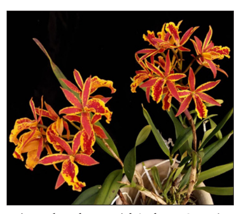
Epicatanthe Volcano Trick 'Volacno Queen'

American Orchid Society Education. Conservation. Research.