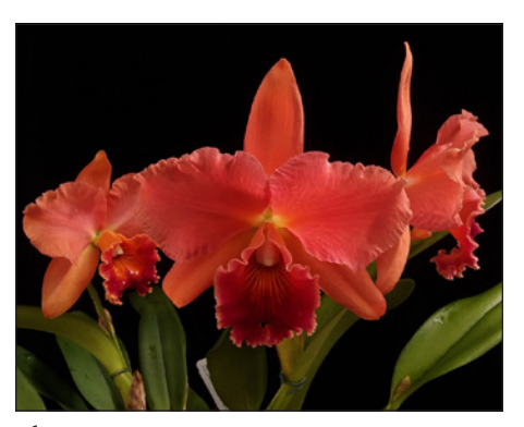
Rlc. Enzan Famtasy