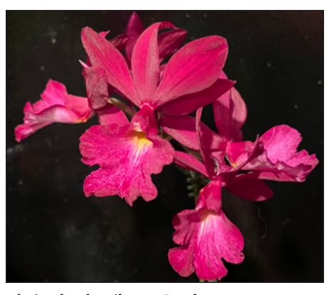
Phaiocalanthe Liberty Creek

in March 2019. While most taxonomists consider this a monotypic genus, there is a second species, Ludisia ravanii listed in Orchidwiz, though no details about it are given. Over the years, Lus. discolor has been described using more than 25 different botanical names including placing it in Goodyera , the genus of our native Rattlesnake Plantain ( Goodyera pubes -