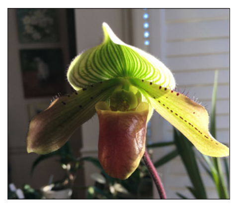
Paph. Hawaiian Illusion

vinicolor types and registered in 2018. On this flowering, at least, both inflorescences are producing a second flower and one may go on to make a third. This is not common behavior in this breeding group. I'll be interested to see if it hap-