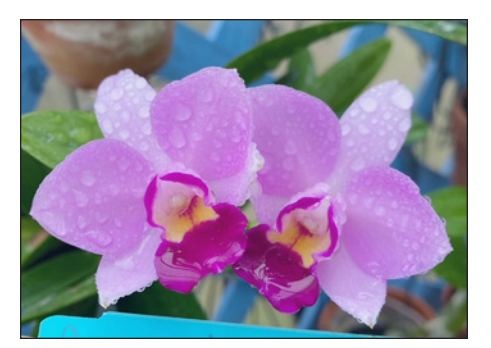
Rth. Triple Love "#1"