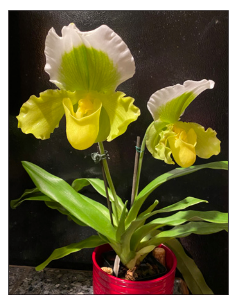
Paph. Hell's Emerald