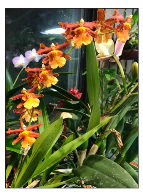
Onc. Catatante ' Pacific Sun Spots'