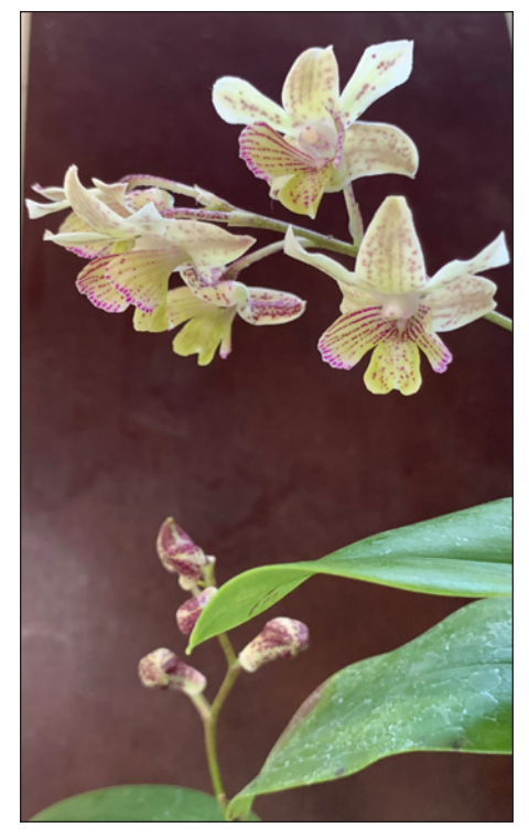
Den. Aussie's Chip