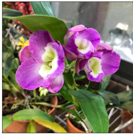
Den. Violet Fizz 'Luna' (top: Dan's; bottom: Larry's)

is not easy to find. It has very peculiar looking stems with overly swollen nodes and lovely "hand painted" flowers. A final species that fits this section is Véronique's Den. linawianum . This one comes from Taiwan and parts of mainland Chi-