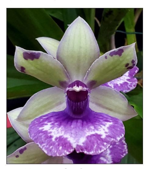
Zygonisia Snow Bird 'Kaila'