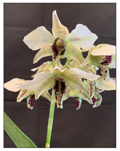
Den. Royal Chip

Den. oligophyllum, which we have seen a few times in the last year, and my Den. faciferum, an odd species from Sulawesi with growths that have swollen bases that lead up to thin stems bearing persistent nodes that flower several times each year. As we discussed at the meeting, this species seems to do well for several years and then stop making any new growth and slowly decline. I have a plant making some keikis and I'm going to try to mount them and see if this method works better in the long run.