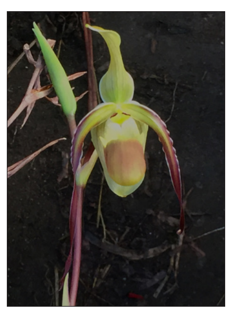
Phrag. longifolium var. gracile