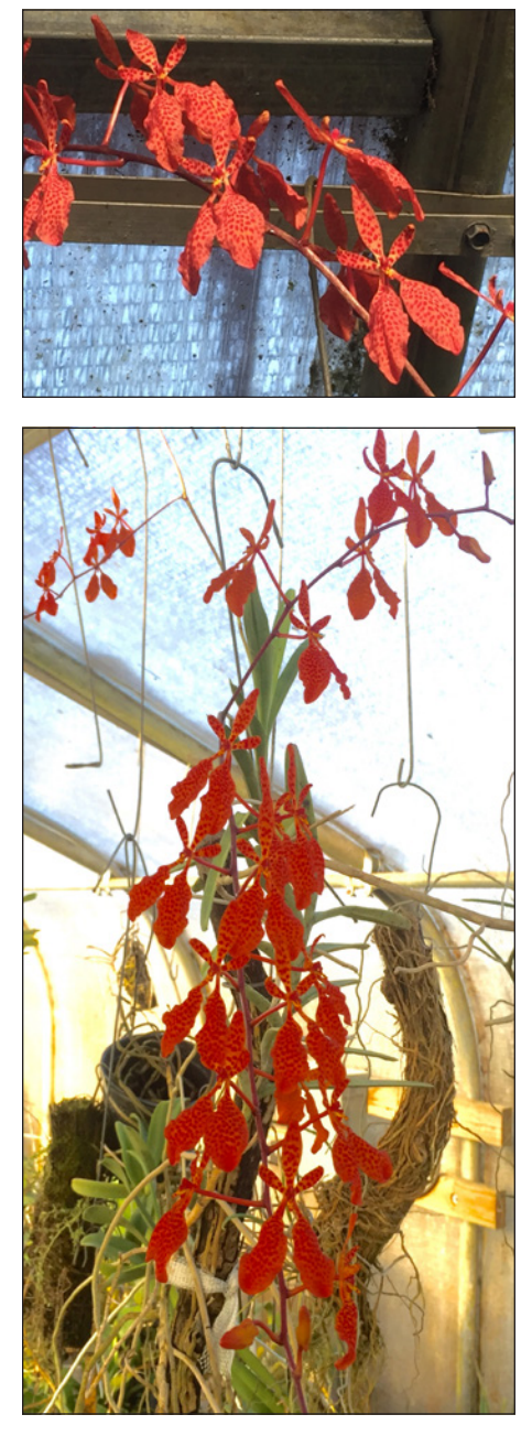
Renanthera Mary Christine Motes 'Polka Pants' AM/AOS