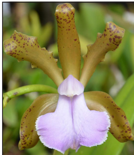
C. bicolor v. coerulea 'SVO Blue Lip'