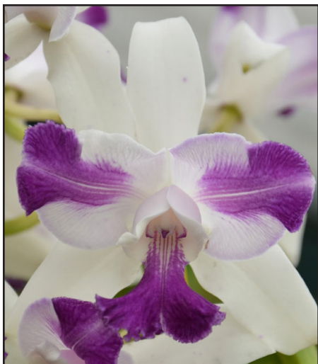
C. Interglossa v. coerulea-aquinii 'SVO'

The details of the Zoom meeting will be emailed a few days before the meeting