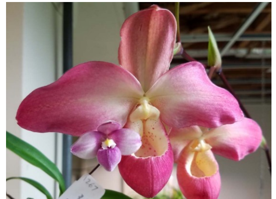
Phragmipediums come in all different sizes.