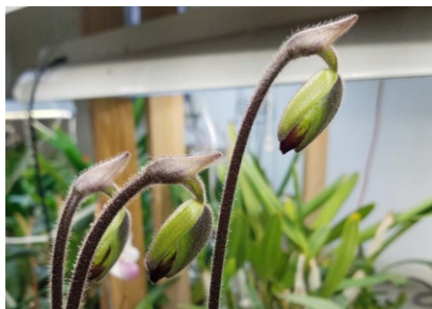
A couple months ago I was sure this would be open for the show. Oh well.