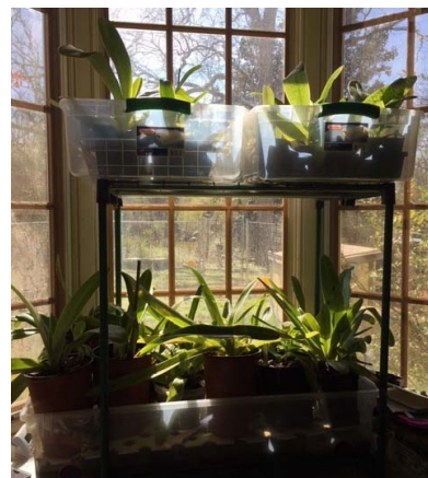
HB successfully grows many plants, including her favorite slipper orchids, in her windows.