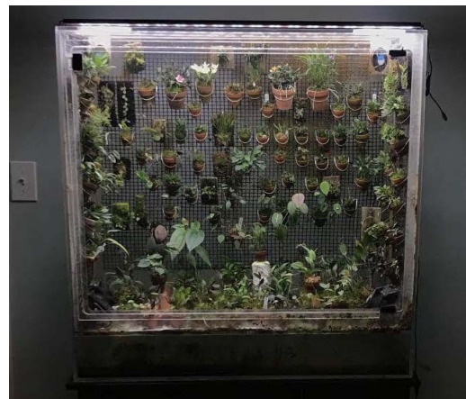
Kevin Holcomb indulges his pleurothallid obsession in a compact orchidarium.

Reminder: Plants purchased at show not eligible for March ribbon judging