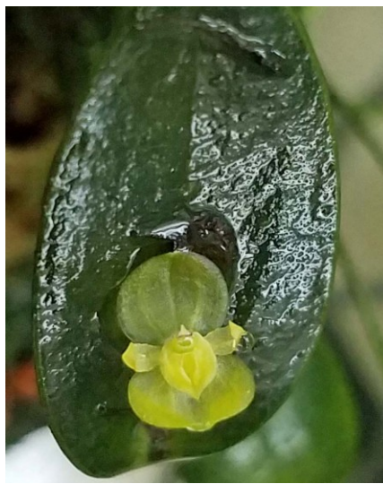
Pleurothallis dorotheae (yellow form)