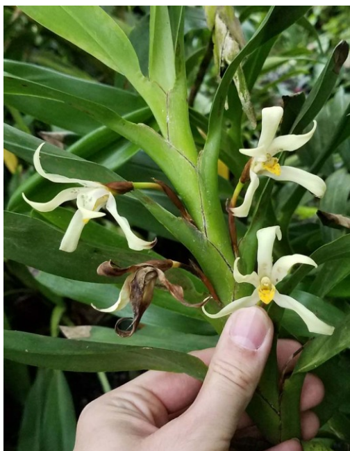
Camaridium inauditum at ABG

I finally got a sheath on one of the 2016 Challenge Plants (C. Tropical Song) but no flowers yet. I'm probably not giving them as much light as they'd prefer. -danny