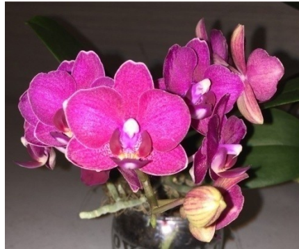
Blue – Phalaenopsis hybrid – Dan Williamson