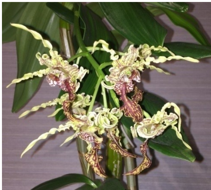
Blue – Dendrobium spectabile –Jon Crate

This outstanding species lives up to its name and a specimen plant in flower always draws considerable attention. Though mature height varies from one plant to the next, it still has no other contender for the largest member in the Latouria section, a group of evergreen species centered on the island of New Guinea and some of the smaller islands trailing east and south from there. It can grow in near full sun at sea level, but is also found in the mountains in shadier locales at more than 3500 feet above sea level. Thus, a plant will adapt to intermediate to hot growing conditions. The strong, club like pseudobulbs are topped by several evergreen leaves, and can produce a number of inflorescences beneath or between those leaves over several years.