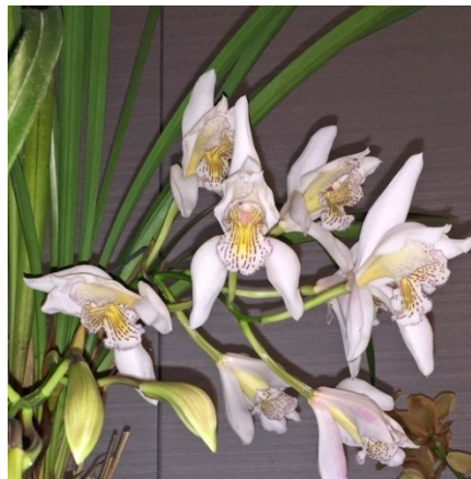
Blue – Cymbidium wenshanense 'Mello Spirit' AM/AOS (provisional) – David Mellard

This species is fairly recently described (1990) and is somewhat atypical for the genus in that it grows as an epiphyte rather than as a terrestrial in the Wenshan district of Yunnan Province, China. This area borders the northernmost portion of Vietnam, where it is suggested that it may also grow. Despite this habit, most of the scant sources providing growing information treat it similarly to the