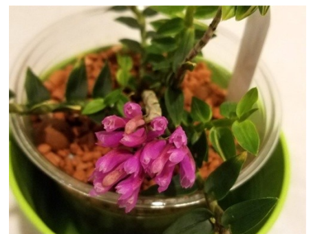
Blue – Dendrobium limpidum – Ariel Christiansen & Kurt Drewke

This small growing species comes from East Papua New Guinea and was newly described in 2003. It has many similarities to Den. dichaeoides , but differs in some key aspects of the leaves and growing habits, and in location of the known habitat.