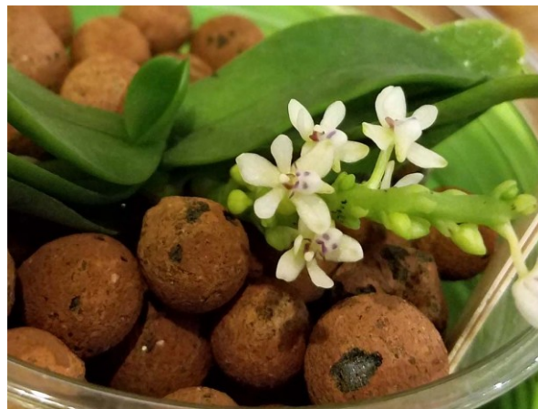
Tubecentron Niu Girl