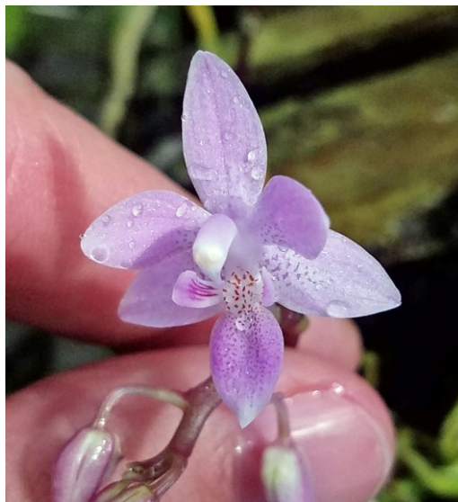
Phalaenopsis equestris var. aparii