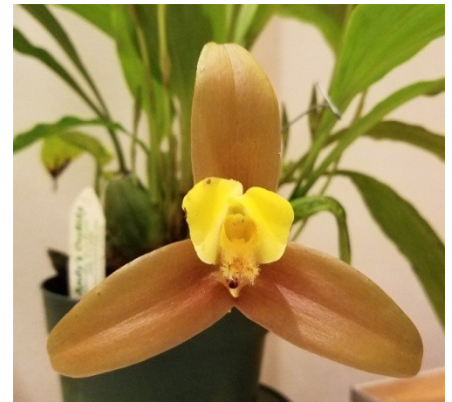
Blue – Lycaste lassioglossa

even, mild conditions this species prefers.