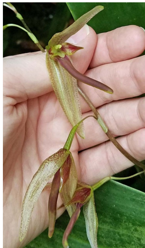
Pleurothallis excelsa at ABG