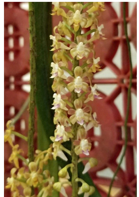
Blue – Cleisostoma subulatum – David Mellard

Tae. biocellatum grows on the island of Java in Indonesia, in forests and coffee plantations between 1000 and 3000 feet above sea level. Not much else is written about it other than it prefers shade and rather moist conditions with warm temperatures year round. The plant exhibited is beautifully grown and fascinating under close inspection. [I tend to keep my Taeniophyllums a bit too dry, it really helped when some moss started growing on the mount. Of course the moss can overwhelm a small leafless orchid if you don't keep it in check. ABG is getting good results growing several species with more regular watering and humidity than I provide. -danny]