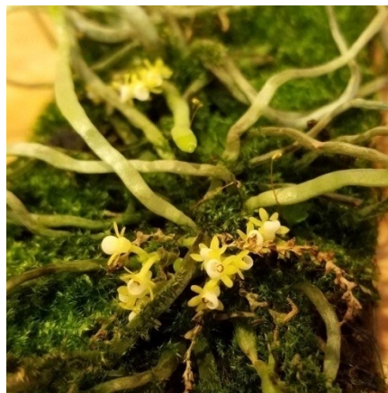
Blue + JC Mobley Cultural Award – Taeniophyllum biocellatum – Danny Lentz & Dianne Morgan

There are over 200 species in this genus of leafless orchids scattered across warm tropical locations of Asia, Africa, Australia and the Pacific Islands, though very few have found their way into cultivation. The genus name literally means “ribbon leaf,” though it is actually referring to the flattened spreading root mass colored with chlorophyll,