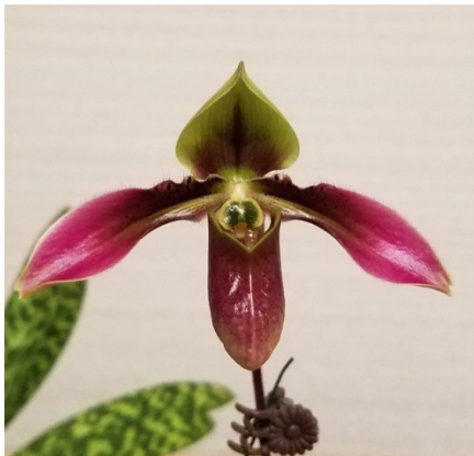
Blue – Paphiopedilum hainanense – Danny Lentz & Dianne Morgan

Kew and the RHS consider Paphiopedilum hainanense , described by Jack Fowlie in 1987, to be a variety of Paph. appletonianum , described by Rolfe in 1896. The former was originally found in Thailand, Laos and Cambodia until populations were encountered on Hainan Island, China and described at the time as a new species. Both forms have individuals with lighter and more intense coloration, but the flowers are always of a “broadly winged” appearance on rather tall, narrow, but sturdy stems. The main difference is that the tessellation of the leaves is bolder in var. hainanense than in the type.