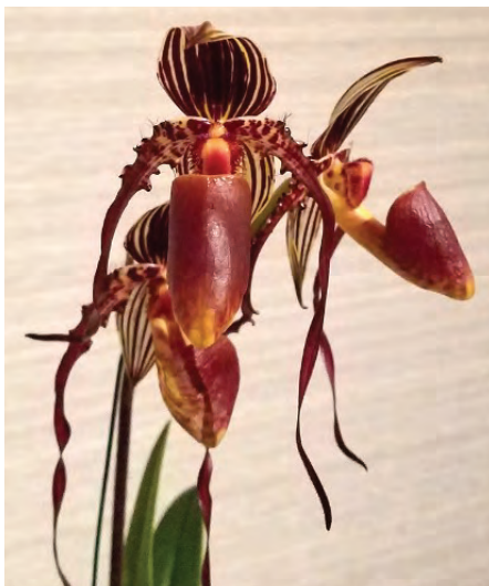
Paphiopedilum Hsinying Wolf (Formosa Lady x glanduliferum ) – Dan Williamson

This unusual, dark and striking multifloral hybrid is newly registered in 2017 and combines three species: Paph. glanduliferum , sanderianum and rothschildianum . Three flowers