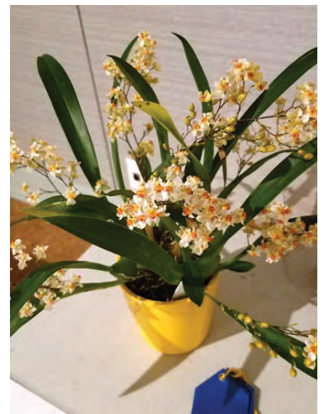
Oncidium Twinkle (Yellow Form) – Dan Williamson

To produce plants with thousands of flowers, such as the nearly dozen that have received