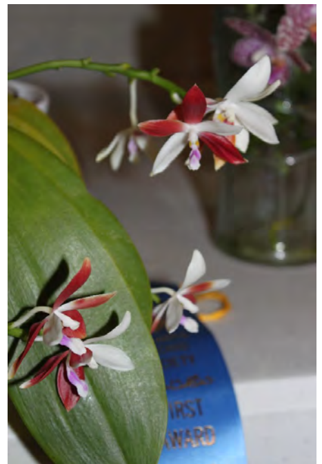
Phalaenopsis tetraspis – Trac Nguyen

The aforementioned effect is charmingly quirky and our blue ribbon plant shows it off beautifully. Though difficult to see without closer inspection, the lower portion of the mid-lobe of the lip has the characteristic "bristle brush" form of the species.