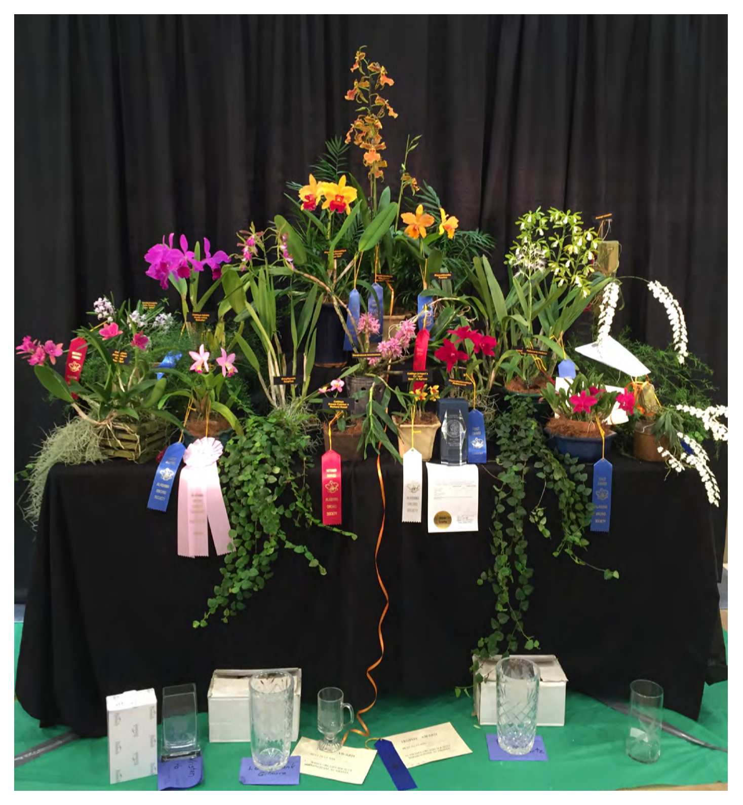
Marble Branch Farms' exhibit at the Birmingham Orchid Show