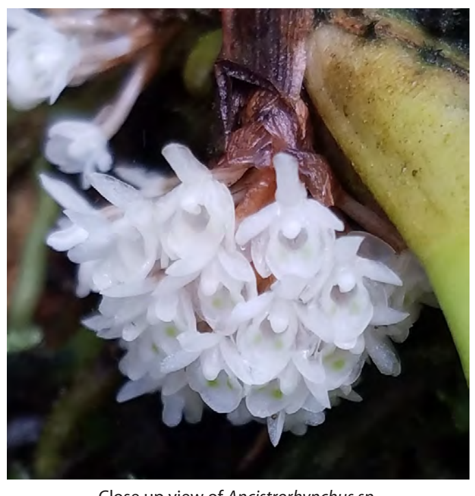
Close up view of Ancistrorhynchus sp.