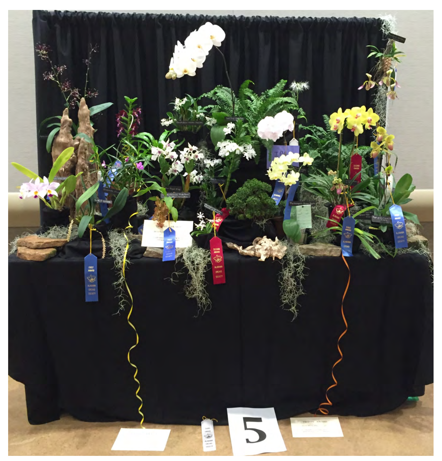
The Atlanta Orchid Society's exhibit at the Birmingham Orchid Show