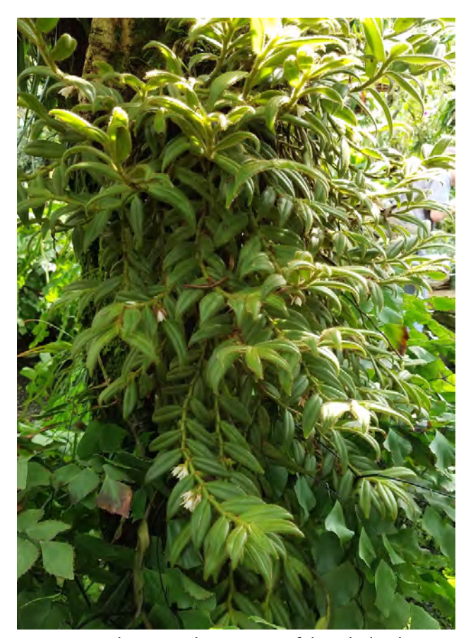
Eria sp., showing a larger view of the whole plant