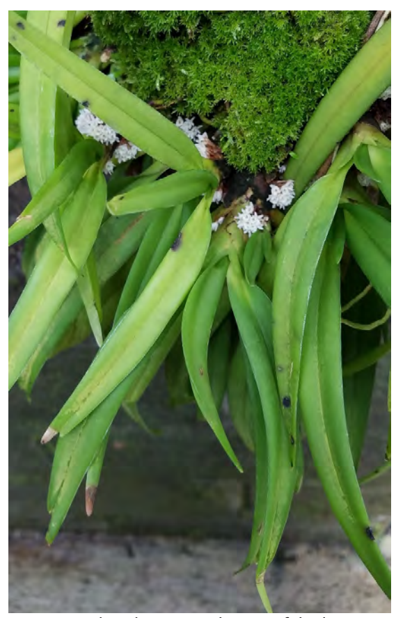
Ancistrorhynchus sp., with view of the leaves