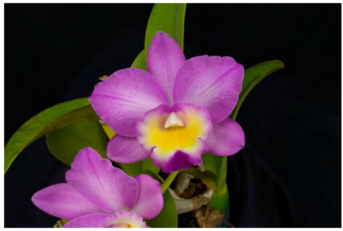
Rhyncatlaelia Rainbow White 'Yellow Bird', HCC/AOS, 77 pts. Exhibited by Fred Missbach