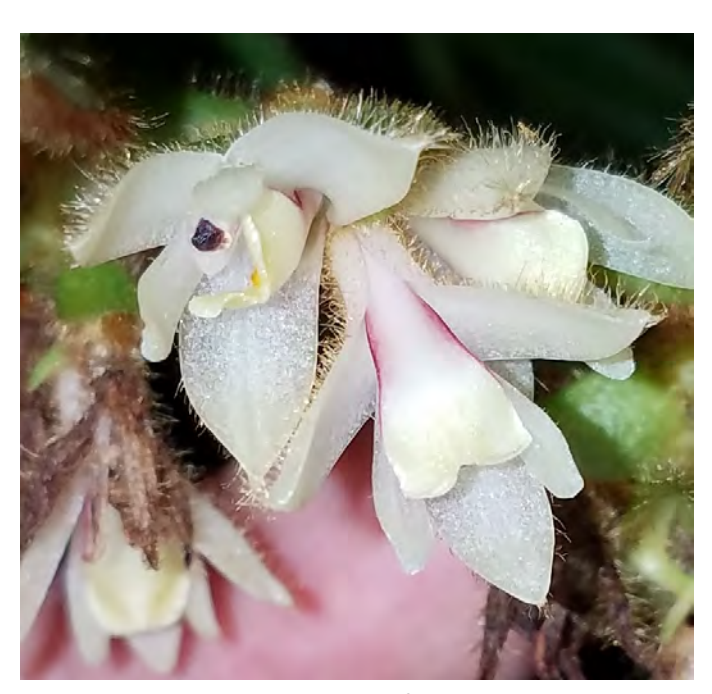
Close up view of Eria sp .