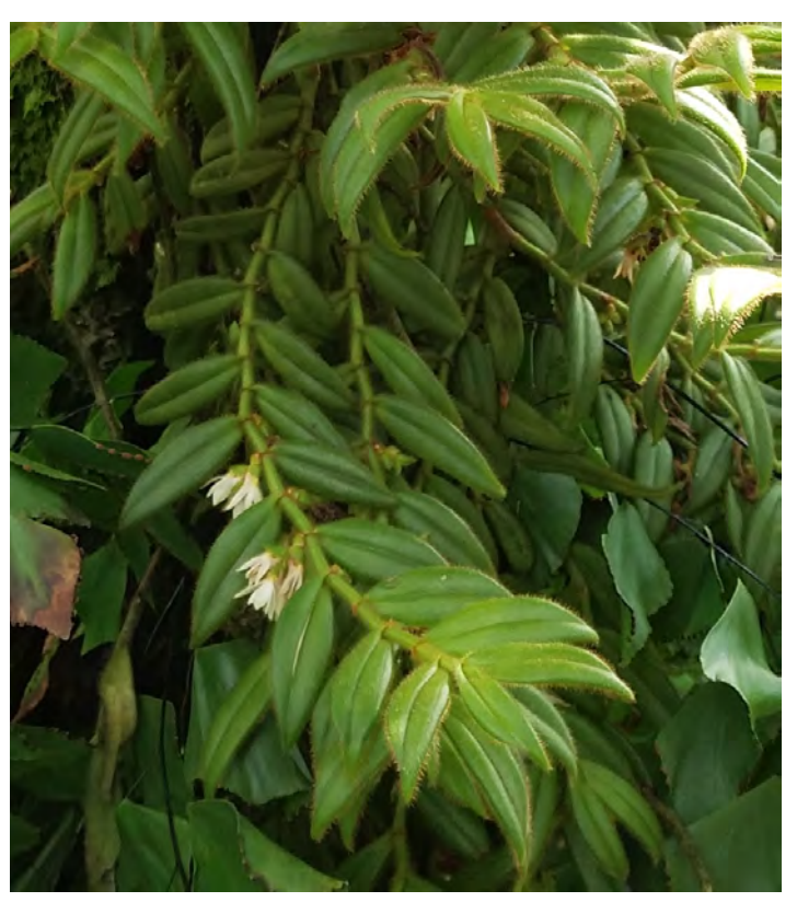
Eria sp., showing the leaves