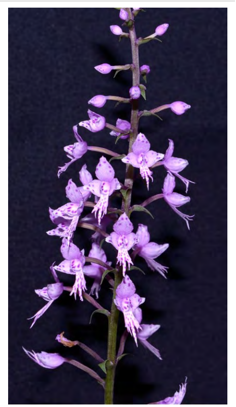
Stenoglottis longifolia – Roy Harrow

should be replenished with soilless mix yearly. When repotting, place the tuber just below the surface. The tuber becomes a cluster of tubers over time. If a tuber breaks away from the mother plant when repotting, pot it up. It will often produce a new plant."