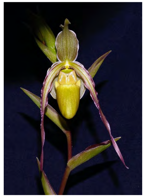
Phragmipedium longifolium var. gracile 'Bronze Elf, AM/AOS – Carson Barnes

This unusual form of a Central and South American species is smaller in all of its parts when