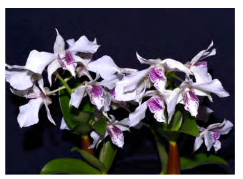
Dendrobium Royal Wings - Geni Smith

Dendrobium Royal Wings is a hybrid in the Latouria section of the genus, combining three species that all grow on the island of New Guinea. It is notable for having strong upright spikes holding several wide spreading flowers that are very long lasting and can occur more than once per year on mature plants. The color is mainly white, with purple markings in the lip. Generally the plants top out in the 12 to 15 inch range, with upright club like pseudobulbs that flush a reddish