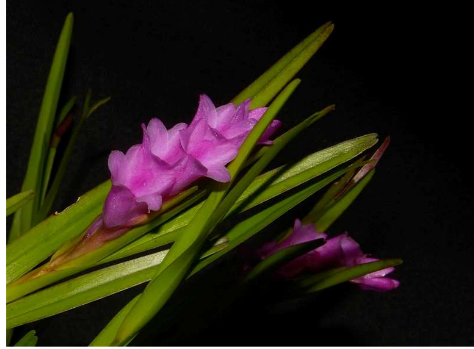
Above: Isochilus major – Geni Smith Below: Aliceara Tahoma Glacier 'Ithan,' AM/AOS - Sondra Nierenberg

The narrow stems, which can grow to about 18 inches in length, have two ranks of very tightly spaced leaves and when not in flower, might be mistaken for some type of stiff growing fern. Plants will form bushy specimens over time and awarded examples have had hundreds of flowers open at once. Flowering seems to occur in flushes off and on throughout the year, especially if nights are cool. Iso. major prefers bright light, but should be more shaded and well ventilated during our summer heat. It should be given a quickly draining medium, but one that also will hold some moisture and prefers to not completely dry There are no between watering. registered hybrids known from this, or any of the other dozen or so species in cultivation, so while grouped with the Cattleya Alliance, Isochilus may not be closely related genetically. This is a shame since it is easy to imagine what interesting