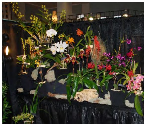
South Metro Orchid Society Exhibit