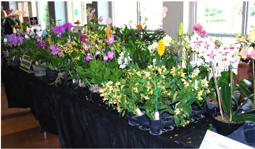
Odoms Orchids Sales Area