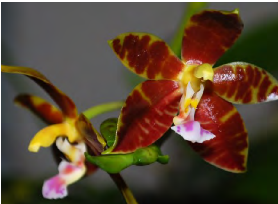
Phalaenopsis Corona 'Wind' – Jarad Wilson

reason, most plants purchased are either genetic copies of a specific clone, or in flower at the time of the sale so that they grower knows what to expect.