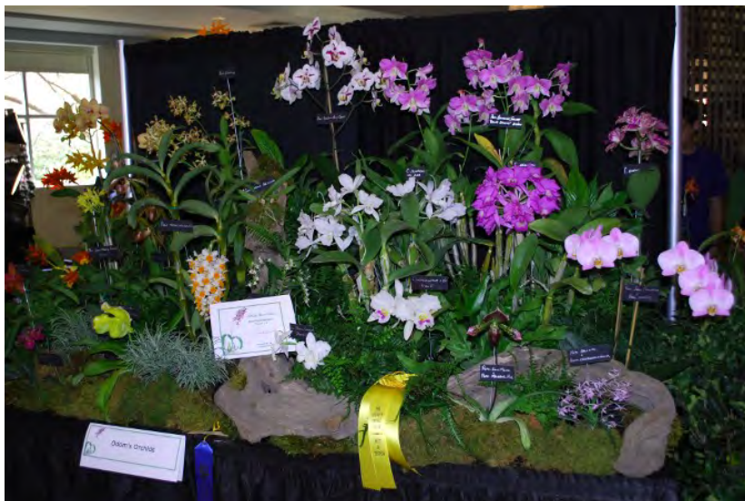
Odoms Orchids Exhibit