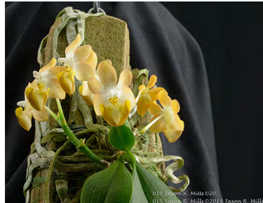
Phalaenopsis lobbii 'Palace' , CHM/AOS, 83 pts. Exhibited by Louisiana Orchid Connection