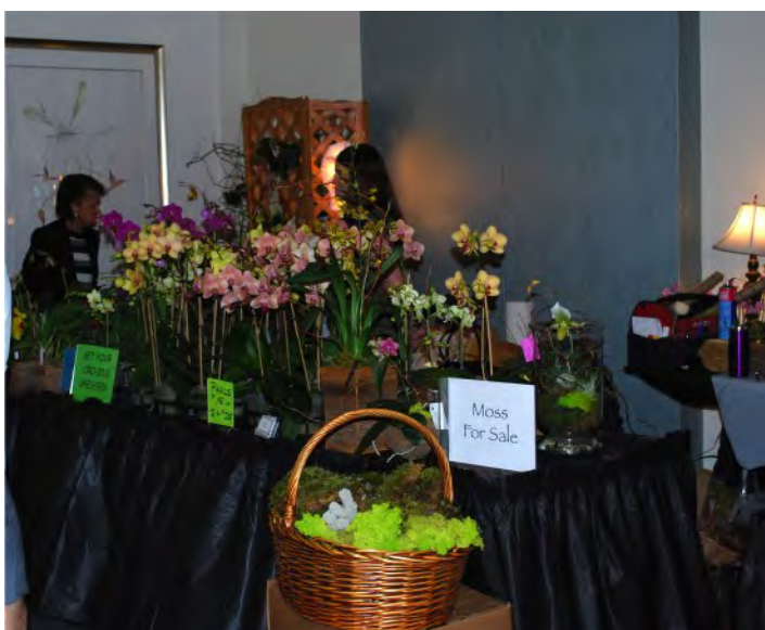
Peach State Orchids Sales Area