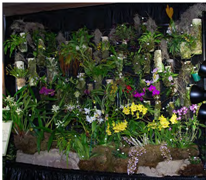
Kool Logs - Nature Glassworks Exhibit