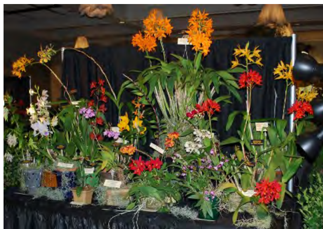
Marble Branch Farms Exhibit