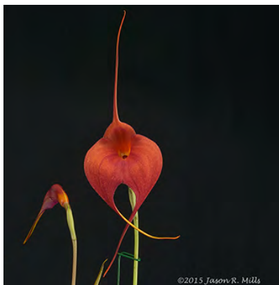
Masdevallia Sue Forrester 'J&L' AM/AOS, 84 pts. Exhibited by J&L Orchids