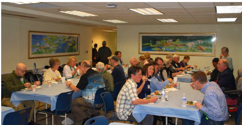
Judges and Volunteers Luncheon