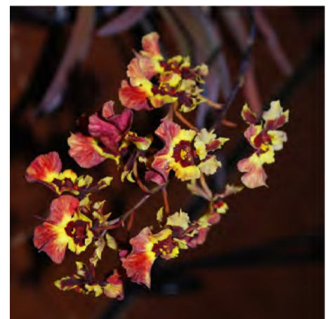
Tolumnia Jairak Rainbow 'Florida Sunset' – Lynne Gollob

The grex name of this colorful hybrid aptly describes the typical results of breeding in this Oncidium sub-group, which typically produce offspring of considerable variation, making efforts to produce color specific hybrids and exercise in futility. Each seedling is unique in color and pattern with every combination of white, red, yellow and purple imaginable. For this