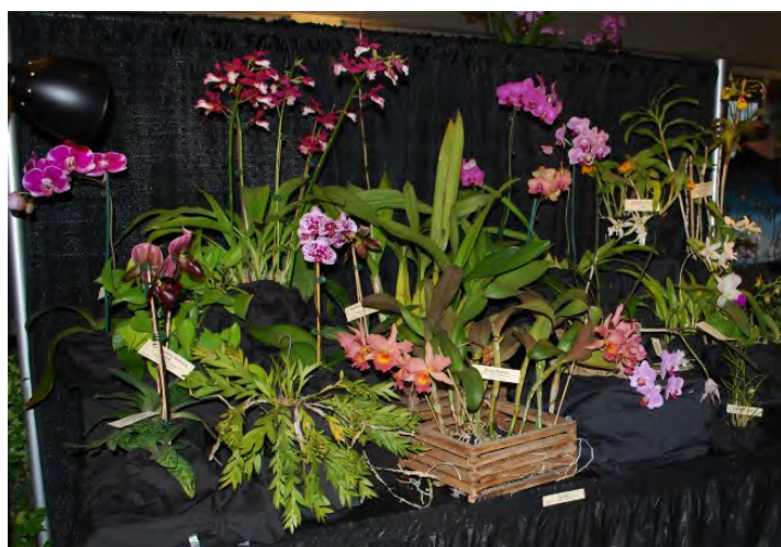
Alabama Orchid Society Exhibit