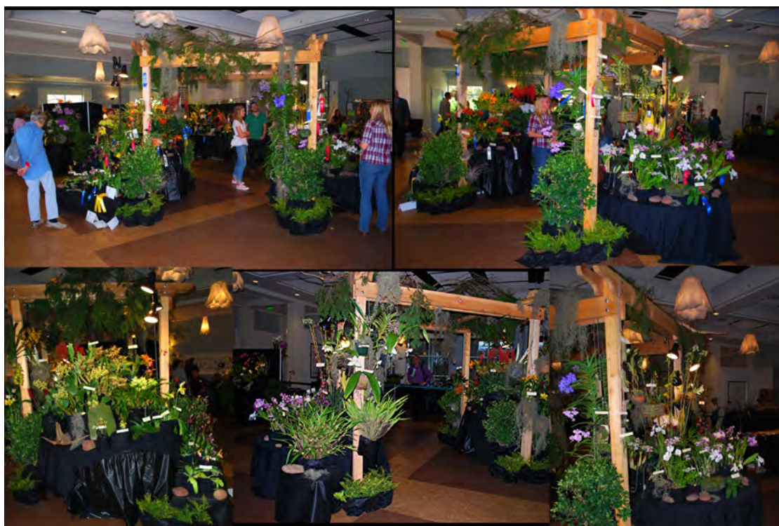
AtIOS Display Collage