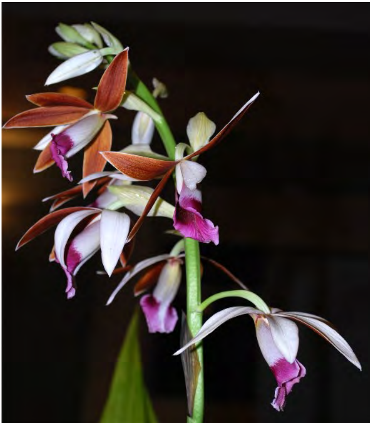
Phaius tankervilleae – Lynne Gollob

seasonally dry deciduous forests, often in very exposed locations. It appreciates high light levels, though in summer there is considerable cloudiness which accompanies the annual monsoon rains. It prefers intermediate temperatures, with some cooling in winter as opposed so some of the large Vanda which prefer to grow warm to hot year round, and is therefore easier to accommodate in greenhouse conditions at this latitude. Water should be heavy during the summer months, though the roots need to dry rapidly afterward, and high humidity and air movement should be provided, which is why "windowsill" cultivation may be more challenging. Less water is called for in winter, though humidity should remain high.