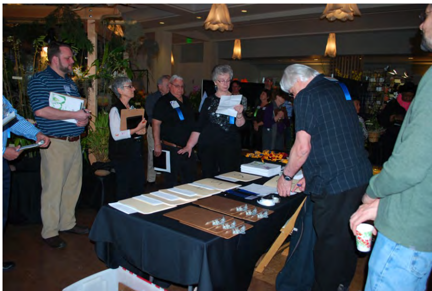
AOS Judges preparing for ribbon and trophy judging at the start of the show