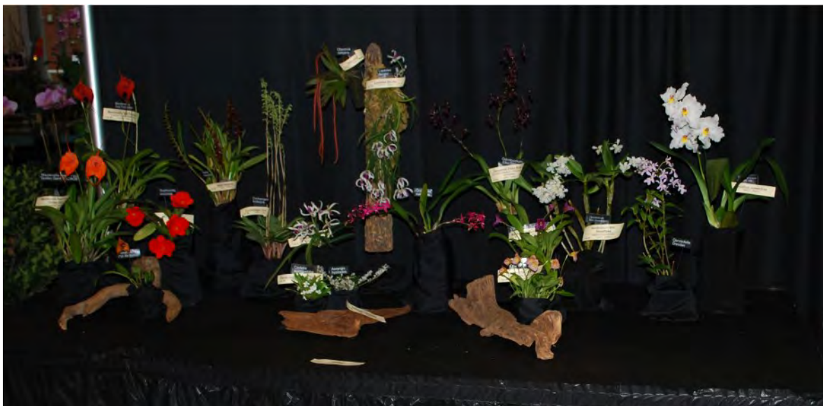
J&L Orchids Exhibit