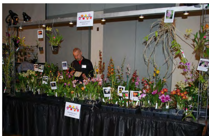
Marble Branch Farms Sales Area