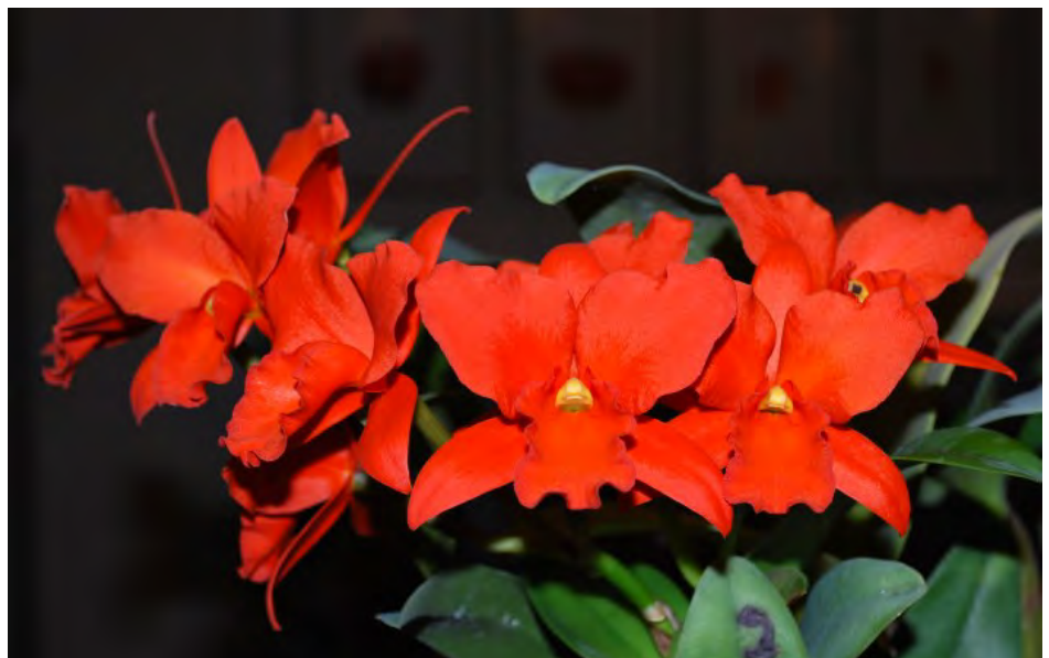
Rhyncattleanthe Dan O'Neil – Lynne Gollob

full form. Orchids with this type of breeding are usually strict once per year bloomers, but they possess good lasting ability and