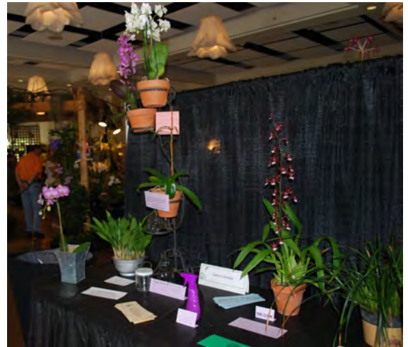
Owens Orchids Exhibit