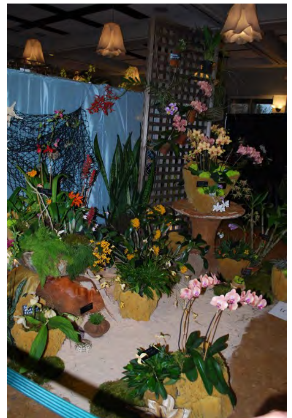
Peach State Orchids Exhibit