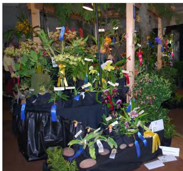
Ribbons and Trophies Galore for the Atlanta Orchid Society Exhibit