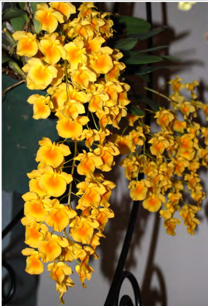
Dendrobium lindleyi – Lynne Gollob

will flower on all growth produced the following season to produce a big show.