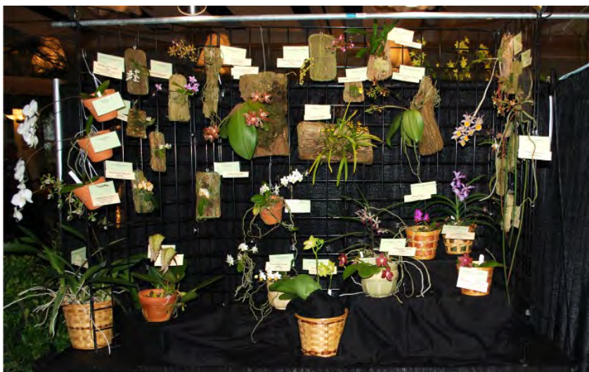
Louisiana Orchid Connection Exhibit