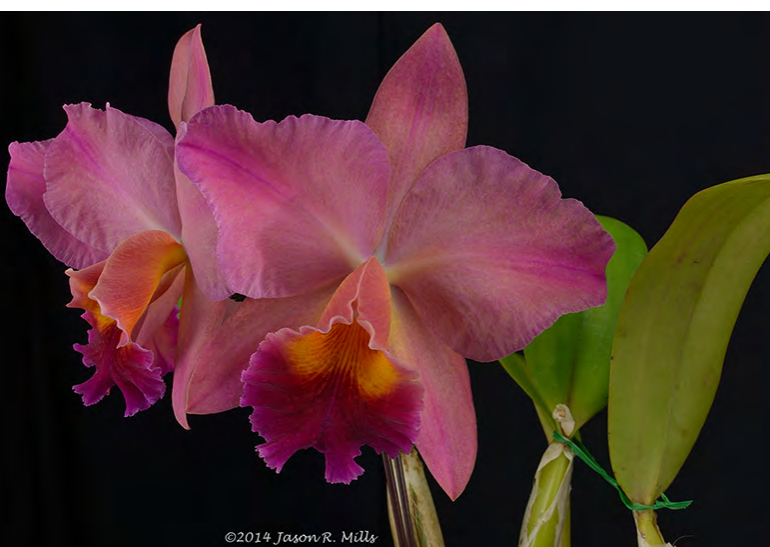
Rhyncholaeliocattleya Memoria Frank Fordyce 'Stones River', HCC/AOS, 79 pts. Exhibited by Stones River Orchids

Phalaenopsis I-Hsin Picture 'SRO-KHM 1483', AM/AOS, 83 pts. Exhibited by Stones River Orchids