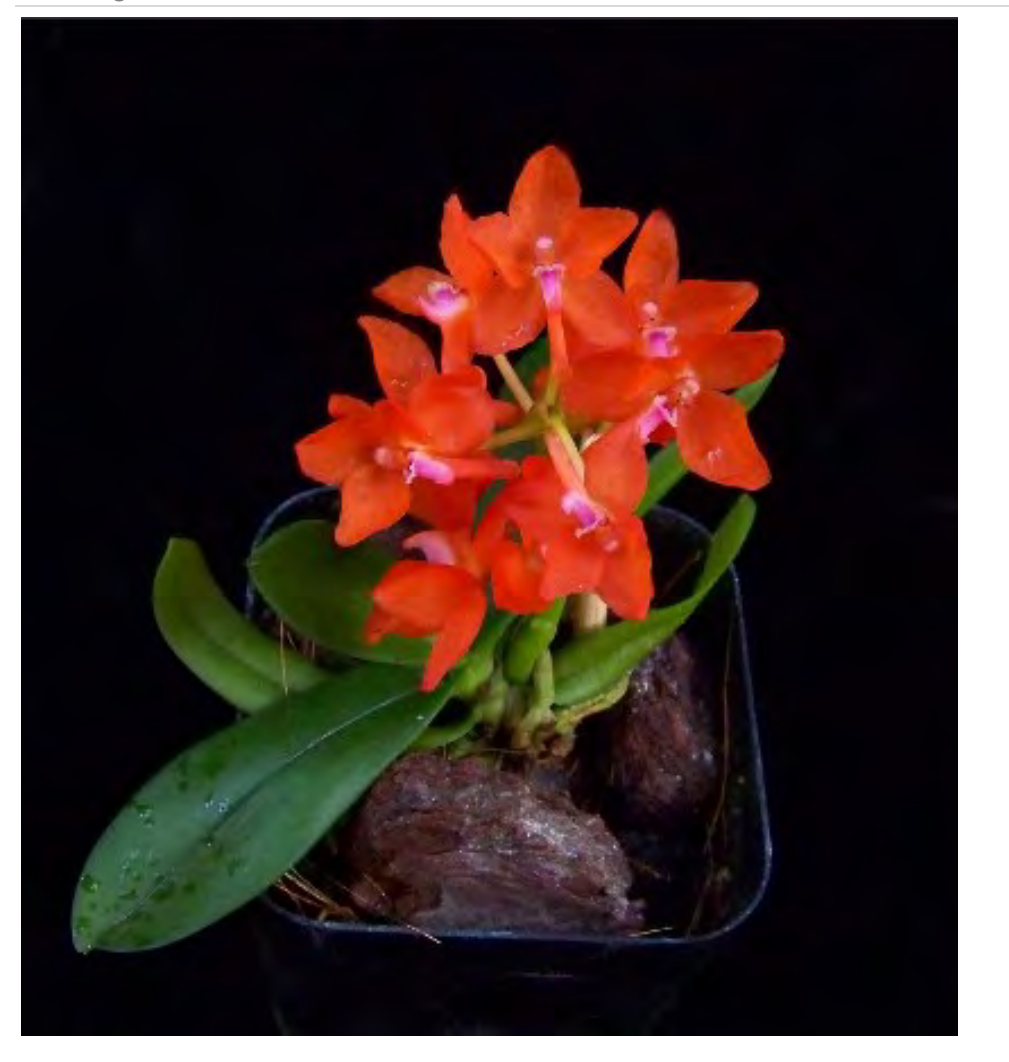
Tubecentron Hsingying Girl – Gary Collier & Mark Reinke

an amazing 77 first generation registered hybrids were made with it before 1900! Now, over 17,000 registered crosses can trace back to this shady growing species from India. Unlike the mottled-leaf types, Paph. spicerianum comes from a region with cool winter temperatures that regularly fall into the 40's, and thus it is well suited to culture in a climate like England, where so much of its early hybridization took place. Though rainfall is quite low in winter in its natural range, the species tends to grow in seepage areas where the roots remain moist, and thus it prefers to have somewhat less water then, but should never dry