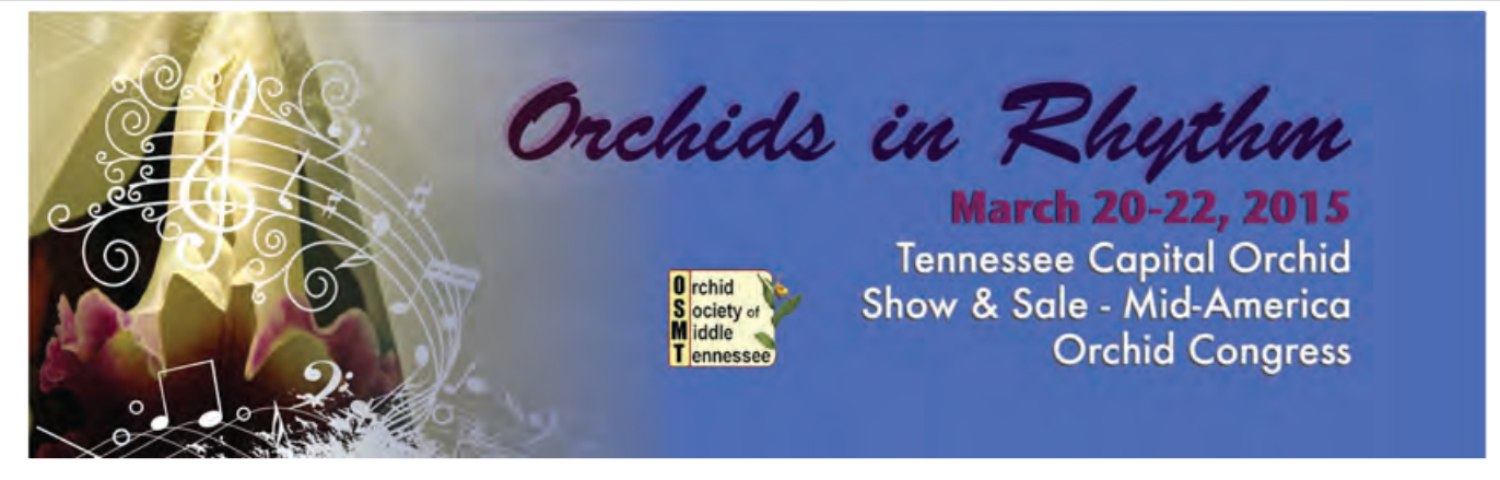
Warm greetings to my fellow orchidists!

As President of the Orchid Society of Middle Tennessee, I would like to welcome you to the Franklin and metropolitan Nashville area. We are very excited and proud to be hosting the Spring 2015 meeting of the Mid-America Orchid Congress and the Tennessee Capital Orchid Show and Sale.