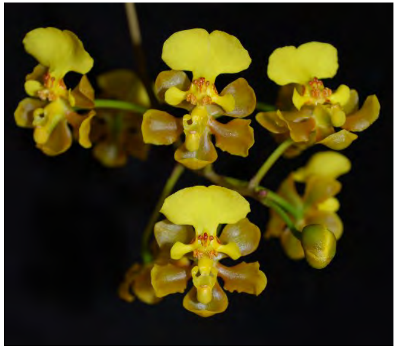
Trichocentrum margalefii

air movement, regular water while growing and only infrequent water when resting, the main cultural are requirements for most Barkeria. They are generally adapted to intermediate to warm temperatures.