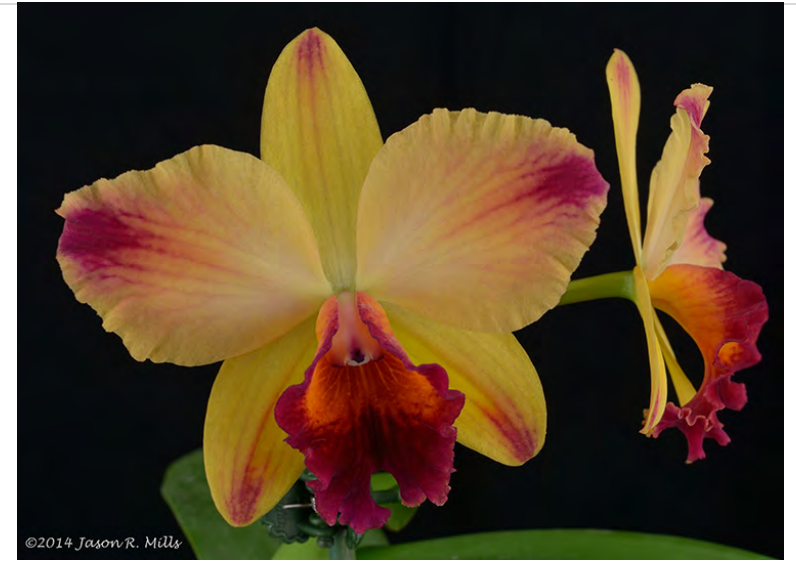
Rhyncattleanthe Martha's Sunburst 'Stones River', HCC/AOS, 76 pts. Exhibited by Stones River Orchids