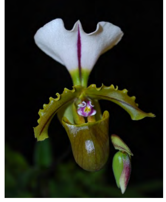
Paphiopedilum spicerianum – Lynne Gollob

Paphiopedilum spicerianum is one of the foundation species of modern "Bulldog" breeding and