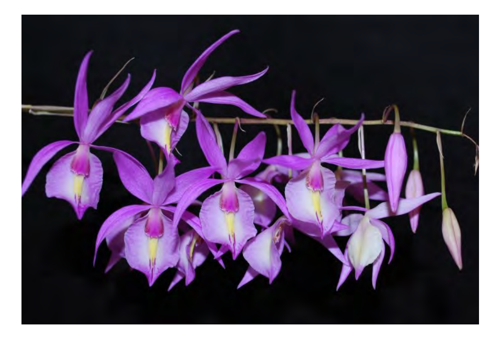
Barkeria Mary Marsh

When you do find plants available, they are worth snatching up as they will grow well alongside many other types of orchids. Bright light, excellent