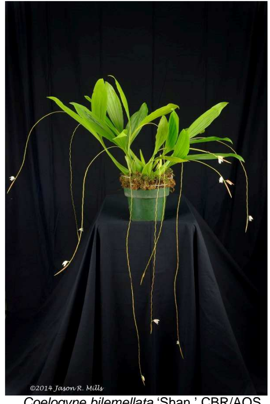
Coelogyne bilemellata 'Shan,' CBR/AOS Ehxibited by Carolina Orchids Flower detail right