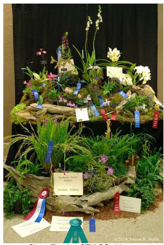
Show Trophy, ST/AOS, 83 pts. Exhibited by Northeast Alabama Orchid Society