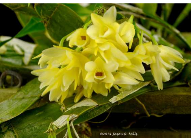
Dendrobium platycaulon 'Sweetbay', AM/82 pts., Exhibited by Pete & Gail Furniss