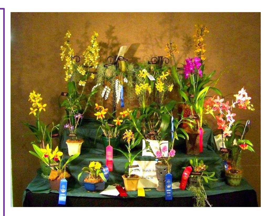
Marble Branch Farms exhibit at the Alabama Orchid Society Show and sale, September 19-21, 2014

For directions to the Atlanta Botanical Garden, please visit their web site at www.atlantabotanicalgarden.org