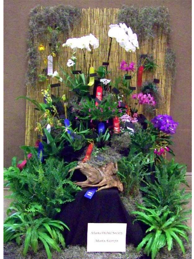
TROPHIES AND RIBBONS Exhibit.....Blue Maureen Pulignano......2 Blues, 2 Reds, 3 Whites and Trophy for best Phrag. Geni Smith......2 Reds, 1 White Nancy Newton......1 Red Carson Barnes.......2 Blues, 2 Reds, 1 White 1 Rosette, Trophy for best Paph.