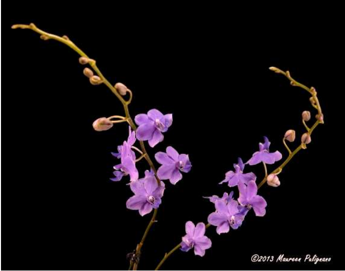
Phalaenopsis Fire Cracker 'Sunny Blue', HCC/75 pts., Roy Harrow