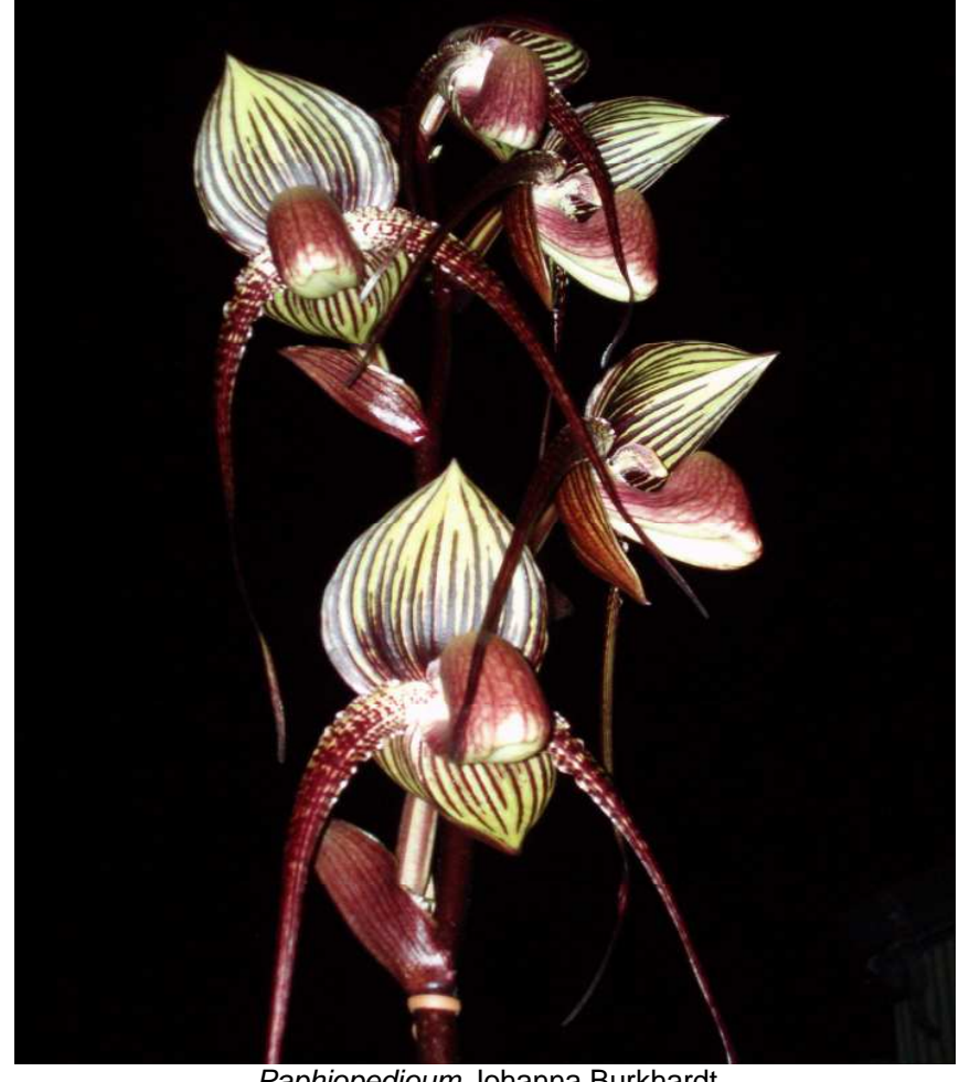
Paphiopedioum Johanna Burkhardt 'Springwater's Masterpiece,' AM/AOS

The future of paphs, or orchids in general he believes, lies in