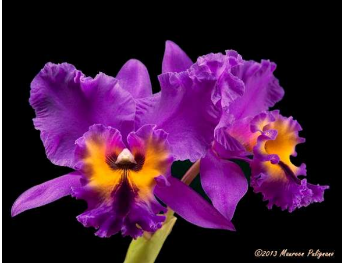
Rhyncolaeliocattleya Jeremy Island 'Deep Throat', AM/81 pts., Fred Missbach