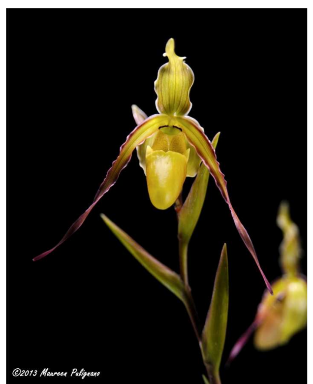
Phragmipedium longifolium var. gracile 'Bronze Elf'' AM/AOS 83 pts Carson Barnes

All award photographs are © Maureen Pulignano