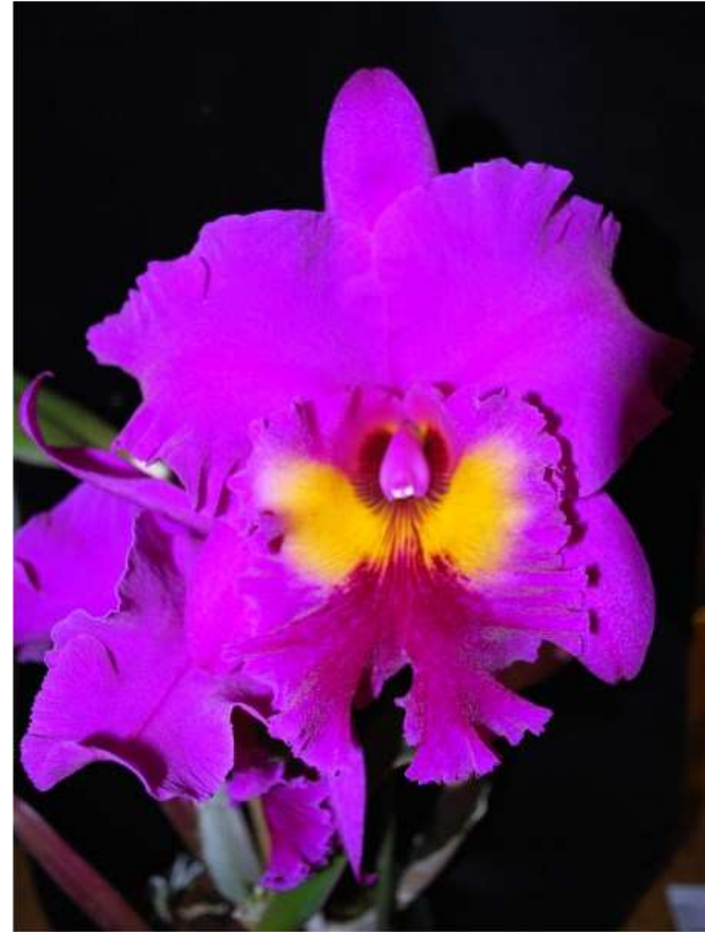
Rhyncolaeliocattleya King of Taiwan 'Hsin' - Carson Barnes

Merit if it were shown at the right time. In 2002, the 'Orchis' clone received 85 points and in 2009, the 'Ta Shin' clone garnered an impressive 88 points. In general, these large-flowered, fall blooming magnificent purples need to be grown, when mature, in a very open media that is capable of drying rapidly after watering. They tend to rest after flowering and should be kept bright and fairly dry, with only occasional water during the winter months. This will help