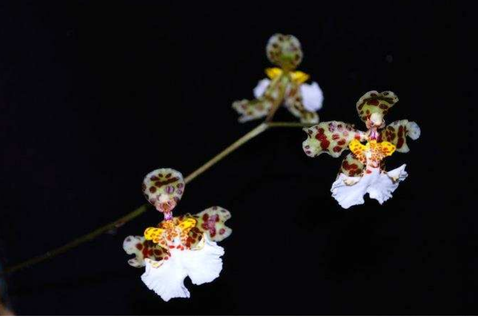
Trichocentrum jonesianum

Out of flower, this species and Trt. cebolleta are virtually indistinguishable, with both of them exhibiting the same distinctive terete leaves that can be either pendent or ascending. Complicating the issue is the fact that their ranges overlap in portions of Paraguay, Argentina and Brazil. But while Trt. ionesianum is limited to this area. the other species can be found northward through the rest of South America, and also in Central America, Mexico and the West Indies. In flower, the differences could not be greater, with Trt. cebolleta exhibiting many fairly smallish, primarily yellow flowers that are very similar in appearance to numerous other species, while Trt. jonesianum produces relatively few, but larger, showy flowers that can be up to 3 inches in spread. These long lasting blooms exhibit bold chestnut spots over a whitish background, offset by large white mid-lobe on the lip. Peak bloom season is late summer into early Many people find this autumn. species challenging to grow well. Though it comes from rather dry areas, it usually grows on trees near water where there is a microclimate with high humidity and good air movement. Plants are totally intolerant of moisture remaining on the roots for any length of time so are best grown mounted as long as the humidity