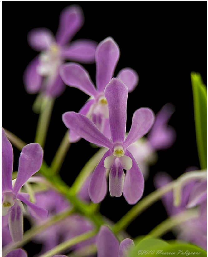
Unnamed cross (Ascda Yip Sum Wah 'Crimson Glow' AM/AOS x Neofinetia falcate) 'Gene' HCC/AOS