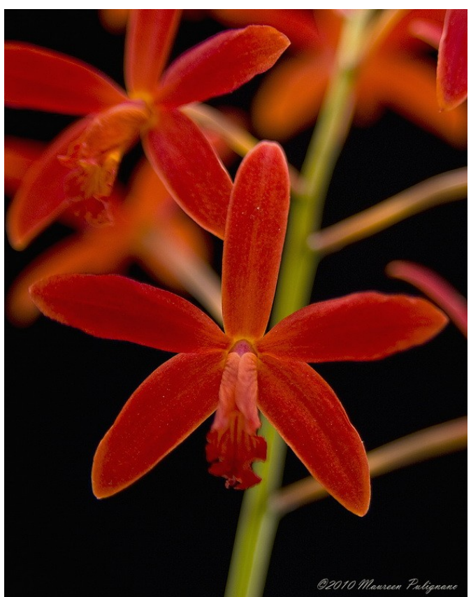
Cattleya milleri 'Phyllis' AM/AOS Exhibited by OrchidBabies, LLC.

Atlanta Orchid Society Judging Center Award