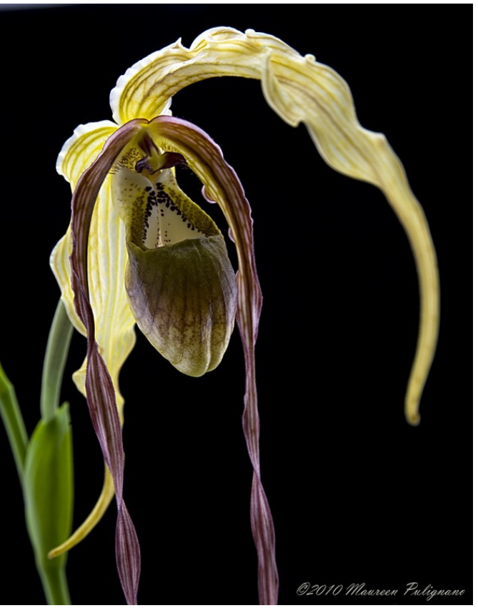
Phragmipedium Fiddlesticks 'Flicka' AM/AOS Exhibited by OrchidBabies, LLC.