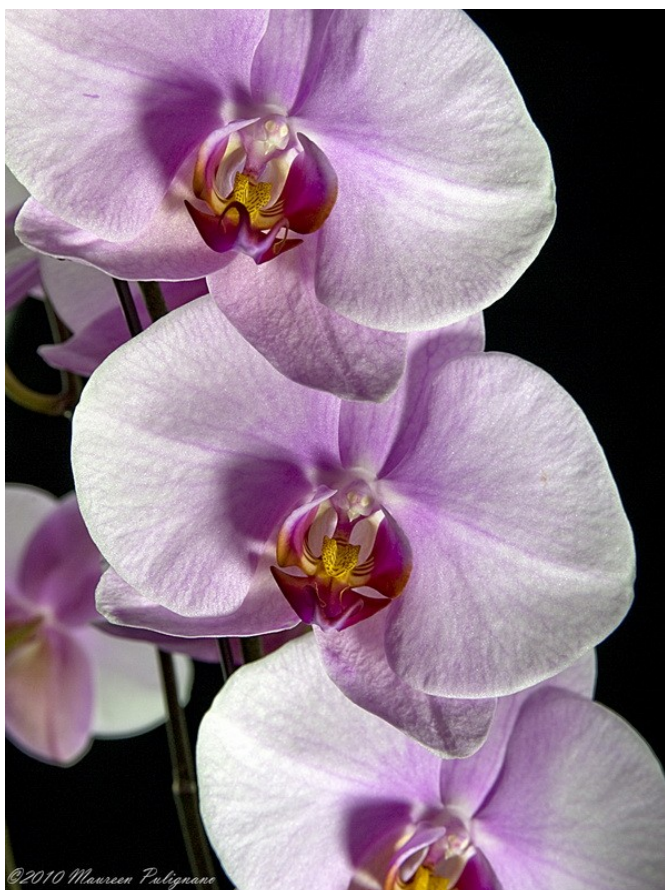
Dtps Yu Pin Lady Venus 'Edith Faye' AM/AOS Exhibited by Stones River Orchids