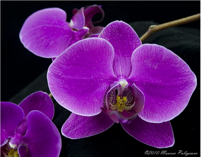
Unnamed cross (Dtps Brother Success x Dtps Jiuhbro Red Rose) AM/AOS Exhibited by Stones River Orchids