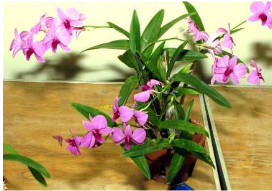
Blue - Dendrobium bigibbum var. compactum – Barbara Barnett