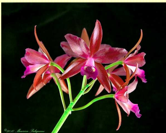
Cattlianthe Chongkolnee 'Burgundy Ace' AM/AOS