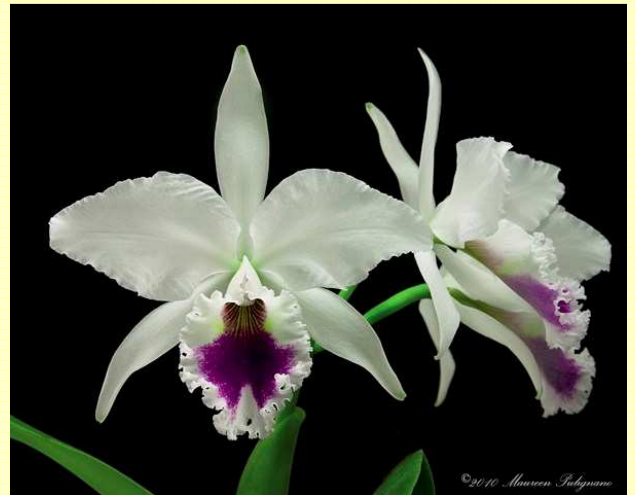
Cattleya labiata 'Canaima' AM/AOS