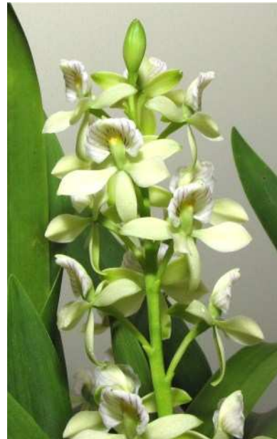
Blue - Prosthechea radiata – Cheryl Bruce

This species comes from a widespread natural range that includes many parts of Mexico and Central America where it is found growing in tropical forests at elevations ranging between 500 and 6500 feet above sea level. The wide range of habitats makes it adaptable from cool to warm conditions in cultivation. The species name is in reference to the radiating purple lines on the white lip, which is help uppermost above greenish or creamy sepals and petals on the fragrant flowers. Prosthechea was previously included in Encyclia , but is distinguished by exhibiting softer, more elongated and flattened pseudobulbs, and thinner, more pliable leaves than the 'true' Encyclia . Some taxonomist further separate species which are nonresupinate such as this one into the genus Anacheilium (literally 'lip upwards') though this is not currently accepted by either the RHS or Kew's Monocot List. There are close to 60 species that were originally described as Anacheilium by Hoffmannsegg in 1842, and it is possible the name will become accepted as