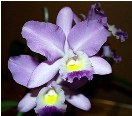
Blue – Cattlianthe Hawaiian Search – Roy Harrow

This attractive cluster flowered orchid was entered under its parents names of Ctt. Valentine x C. Blue Boy, and is a good example of 'blue' breeding. True blue tones are not found in the Cattleya Alliance, however, many species have mutations that have a decidedly bluish violet or mauve tone to them compared the typical forms. It was discovered early on that if you self-pollinate any of these mutations, or cross them together in various combinations, the