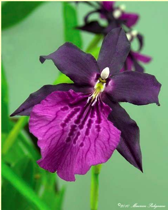
Miltonia (unregistered cross) 'Alisa' HCC/AOS ( Milt. Bevedere 'Best' x Star of Nuuanu 'Britt' AM/AOS)