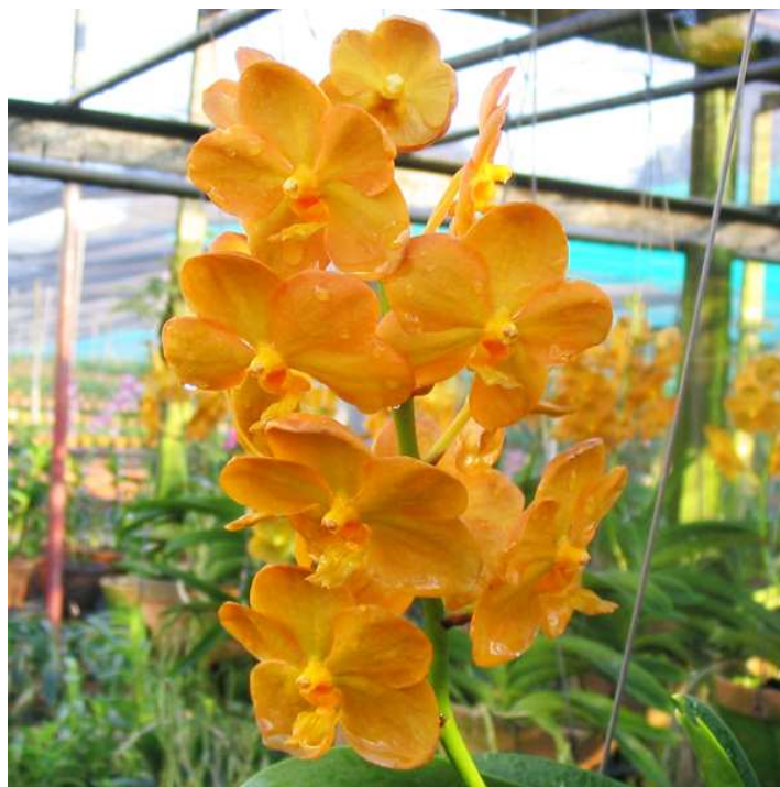
Ascocenda Fuchs Gold

One of Mike's favorite activities is the design of private orchid gardens. He was also instrumental in developing R.F. Orchids' "Orchid Camp", a series of educational classes about orchid growing in South Florida.