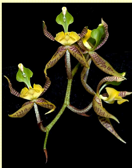
Kageliella houtteana 'Sweet Bay' CHM/AOS