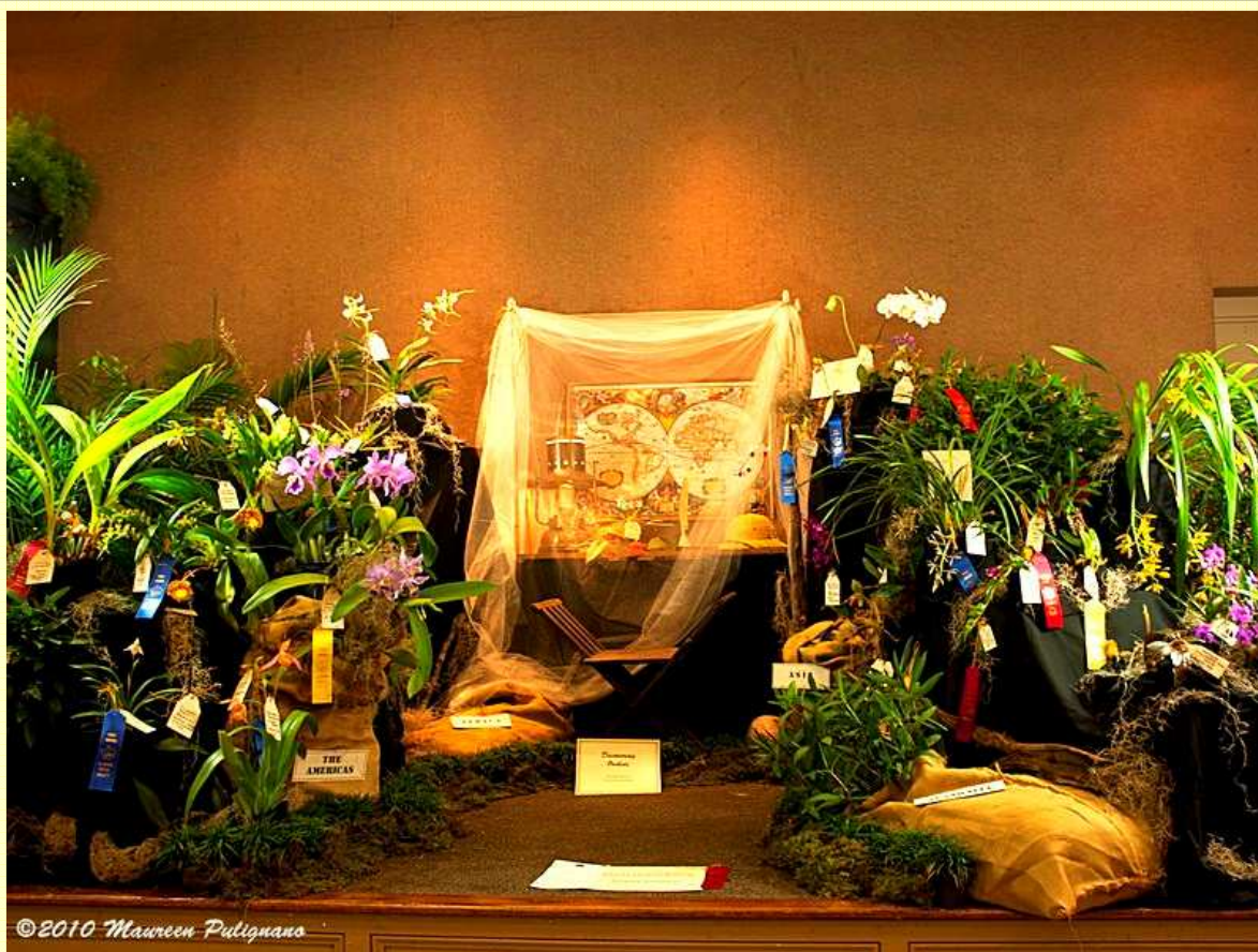
'Discovering Orchids – On the Trail of the Orchid Hunters' EEC/AOS