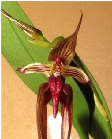
Blue – Bulbophyllum ( fascinator x ornatissimum ) x echinolabium – the Ramborgers

It seems unusual that neither this orchid or its hybrid parent are registered crosses, especially given how large and fascinating the flower is! From the photo it appears that it may be blooming for the first time. Give the parents it certainly has the capability of becoming a