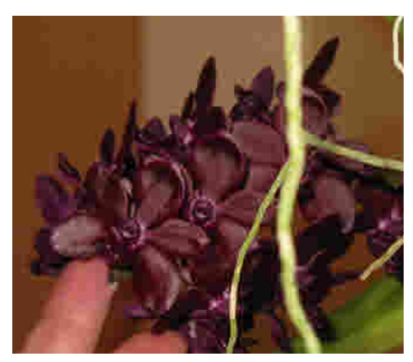
Class VIII – Vanda Alliance