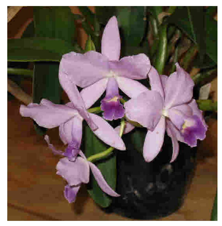
Cattlianthe Portia 'Coerulea'