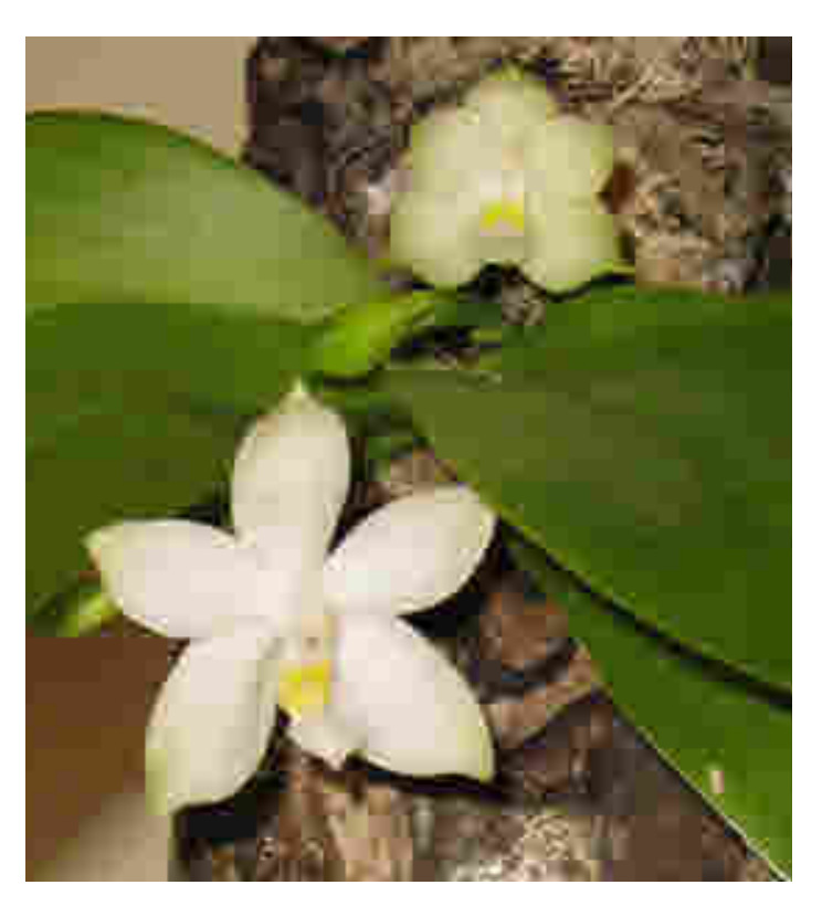
Phalaenopsis violacea var. alba

Red – Phalaenopsis Spica 'Crestwood' AM/AOS – Cheryl Bruce