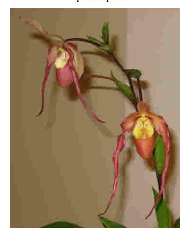
Class VI – Cypripedium Alliance

Blue – Phragmipedium Belle Hougue Point – Cora Ramborger