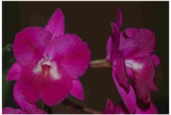
Guaricattonia Ernest Cromwell