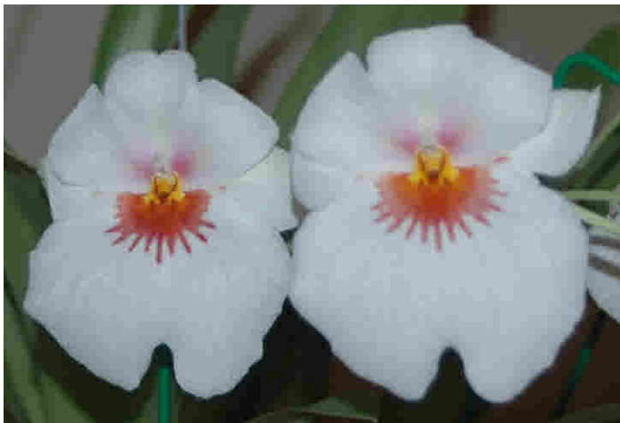
Miltonia Mom's Choice 'Her Flower'