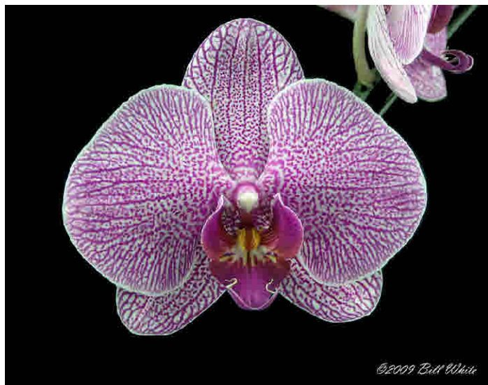
Phalaenopsis - 'Laura' AM/AOS (Southern Jewel x Walden's Delight) X (Southern Belle x Delightful Girl) Stones River Orchids

The Atlanta Judging Center meets and review plants on the second Saturday of every month in the basement at the Atlanta Botanical Gardens. Exhibitors and visitors are allowed to sit in the training sessions and to observe the judging. This is a great way to learn more about orchids and the entire judging process.