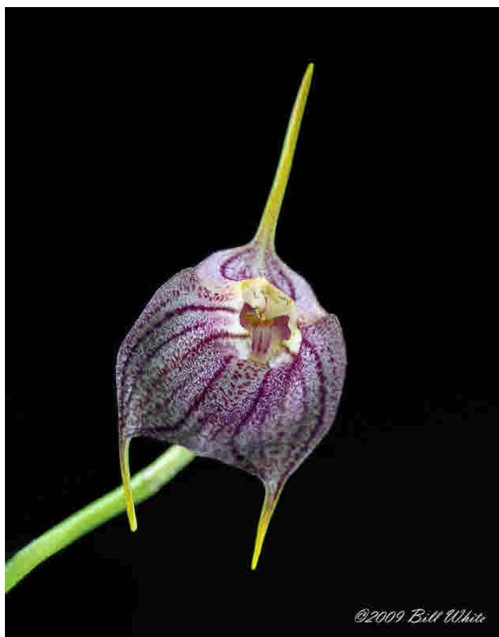
Masdevallia Tortoise 'Winding Road' AM/AOS Masd uniflora x Masd angulata The Orchid Gallery

The Atlanta Judging Center meets and review plants on the second Saturday of every month in the basement at the Atlanta Botanical Gardens. Exhibitors and visitors are allowed to sit in the training sessions and to observe the judging. This is a great way to learn more about orchids and the entire judging process.