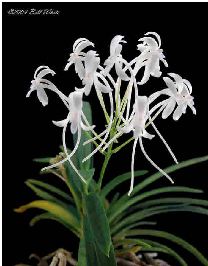
Neofinetia falcata 'Vigor' AM/AOS Fred Missbach

All awards are provisional until published by the AOS