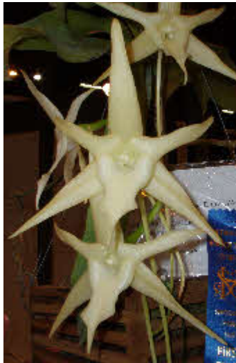
Angraecum sesquipedale Exhibitor: Maureen Pulignano