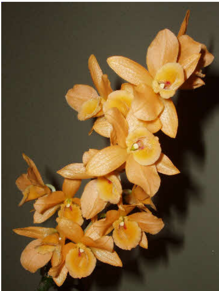
Dendrobium Gold Star 'Orange Royal'