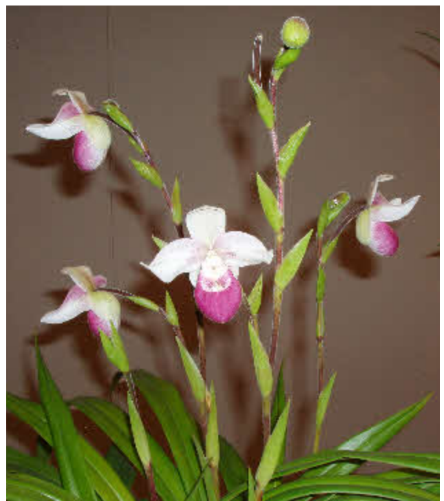
Phrag Cardinale 'Birchwood' AM/AOS Exhibitor: David Glass