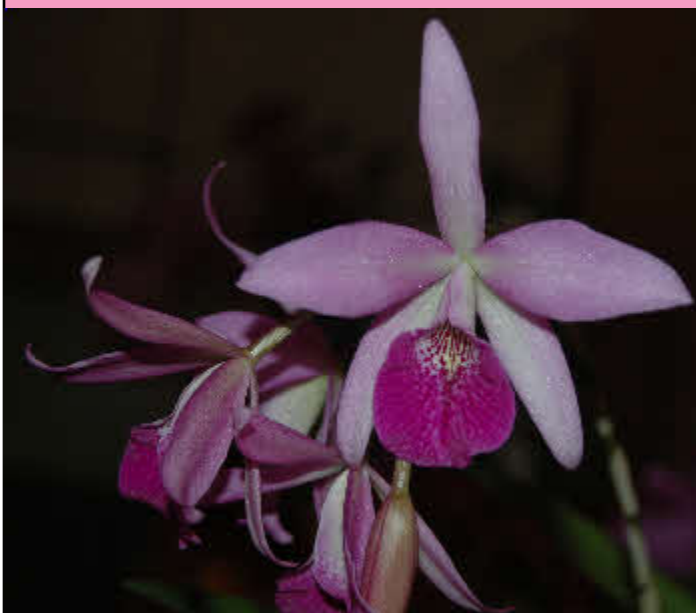
Brassanthe Maikai ‘Louise’ AM/AOS x Laelia anceps var. veitchiana ‘Ft. Caroline’ HCC/AOS

Last month I misidentified these 2 Class 1 winners. The correct identification is below.