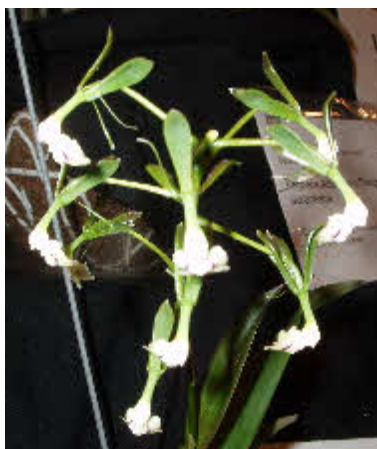
Epidendrum veroscriptum Exhibitor: Roy Harrow