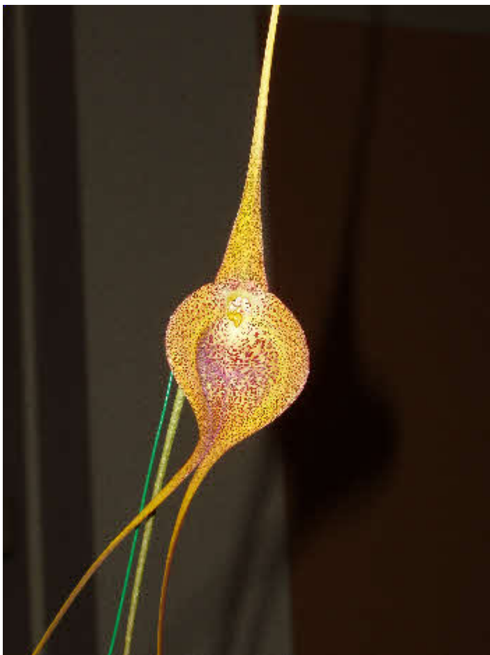
Masdevallia (Regalia) princeps