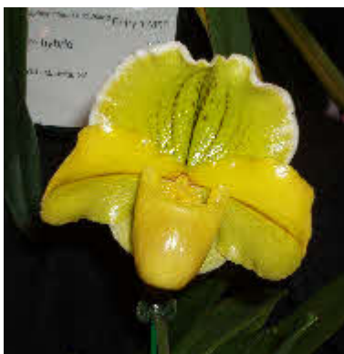
Paph Emerald Brooch Exhibitor: Maureen Pulignano