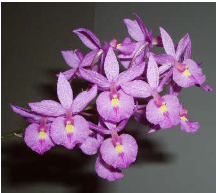
Bardendrum Nanboh Pixy 'Cherry Moon' HCC/AOS