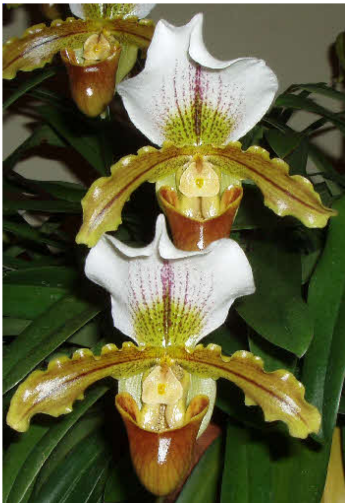
Paphiopedilum Loleanum 'Elaine Day' HCC/AOS