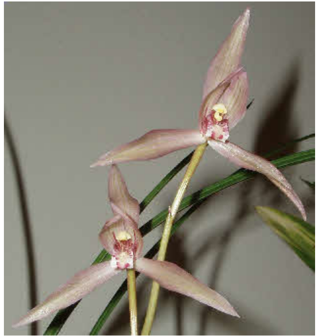
Cymbidium goeringii var. tortisepalum

Cymbidium goeringii is a widespread species native to parts of Asia where the climate is borderline between sub-tropical and temperate, including the Japan Islands and as far north as Korea. The tortisepalum variety was originally described as a separate species, occurring at higher elevations on the island of Taiwan. It is distinct in that the inflorescence commonly bears two to four flowers whereas the typical form bears one and only occasionally two or more. The sepals have a slight twist which accounts for the varietal name. This small, grassy leaved, terrestrial species is adored in Japan, where many distinct forms have been propagated, some available only at enormous price. Atlanta is on the northern fringe of the region where it is possible to grow it out of doors in a very well drained location with good dappled shade, with extra protection on the coldest nights of winter.