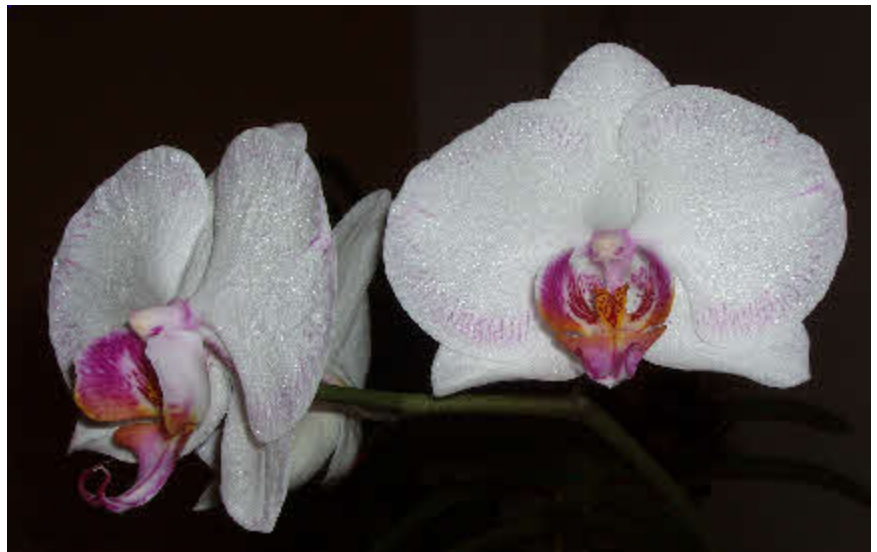
Doritaenopsis Newberry Parfait ‘Pictoe’ AM/AOS