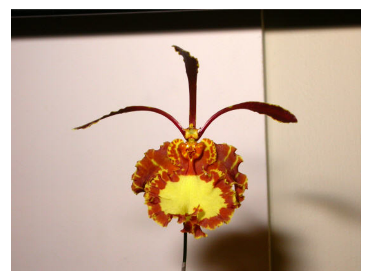
Psychopsis Mariposa 'Green Valley'

Psychopsis consists of 5 very similar looking species geographically distributed from Trinidad, across northern South America and down the west coast as far south as Peru. They come from humid forests at low elevations and require that elusive 'well watered, well drained' culture than can make them challenging subjects to grow well. Good air circulation is also important to keep new growth and the area around the base of the plant from staying wet, which can lead to rot. But not enough water and humidity