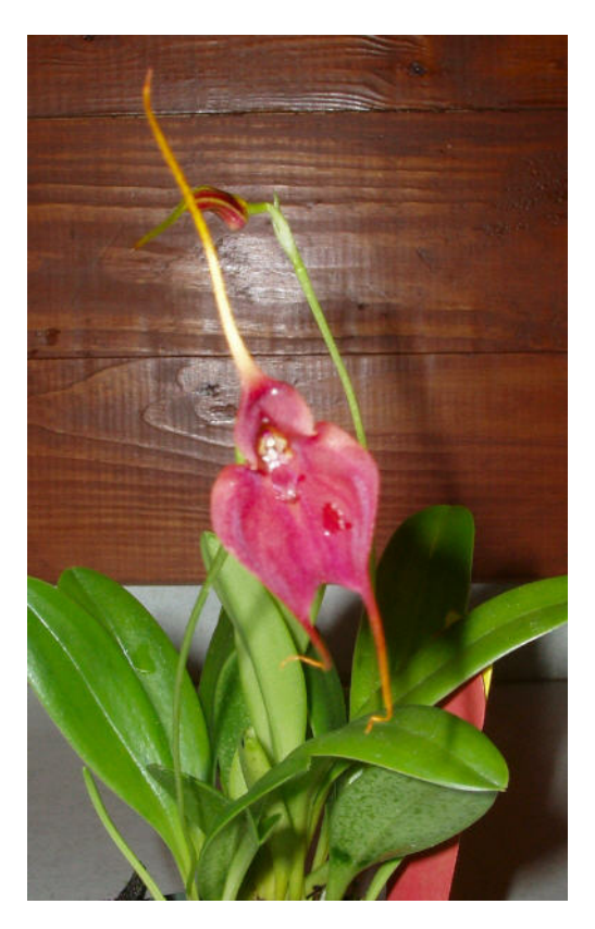
Masd. Copper Angel 'Highland' AM/AOS x Masd. amplexa

Both of these orchids are the same hybrid, came from the same seed pod and were grown in the same greenhouse. So, why are they different colors?