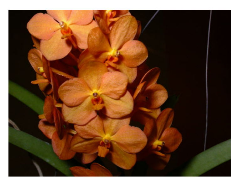
Ascocenda Suk Samran Beauty