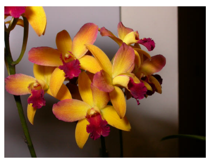
Bishopara Flying Colors 'Mendenhall' HCC/AOS