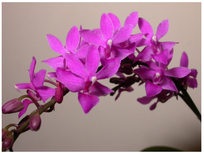
Doritenopsis Purple Gem