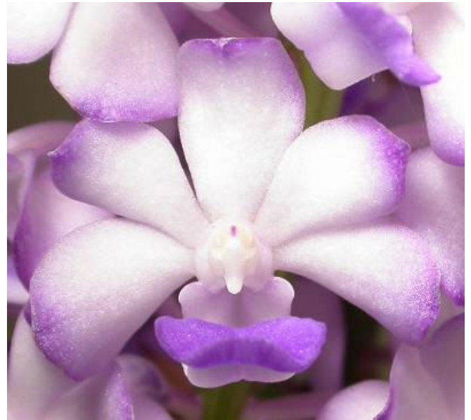
Rhyncostylis coelestis (close up)