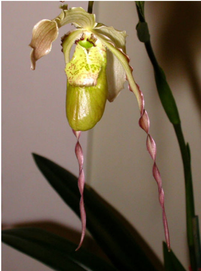
Phragmipedium Les Dirouilles ‘Anita Gould’ HCC/AOS

White – Phragmipedium Eric Young - Ramborger