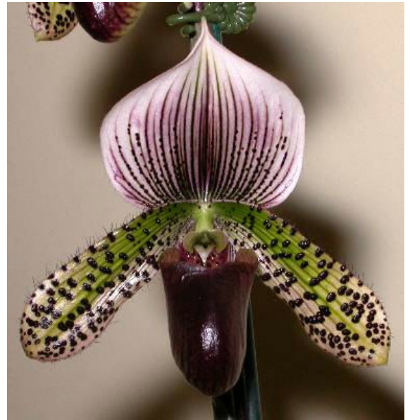
Paphiopedilum (Makuli x ciliolare ) x Goultenianum