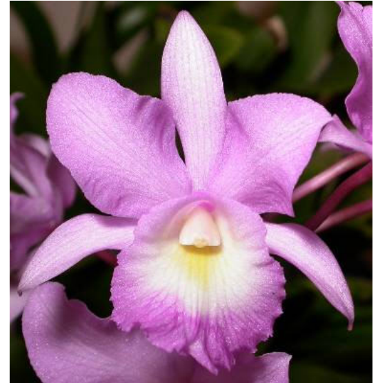
Broughtonia sanguinea var. Alba x C. Angelwalker

The obvious intent of this cross using two pure white parents was to create a nice pure white miniature Cattleytonia. Unfortunately, Broughtonia sanguinea var. alba has been found to be a disappointing vehicle for producing white mini-catts! This cross should be attempted again using the yellow form of that species instead, which has worked in other pairings to effectively block purple color genes. However, as this ribbon winning plant shows, Bro. sanguinea var. alba can produce very beautiful orchid pink flowers in its offspring. Because pink is not a common color in 'mini-catts' there is definitely value in continuing to use this color form of the species for further hybridization.