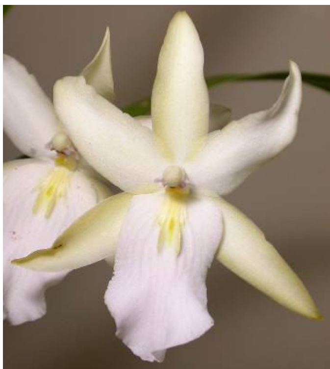
Miltonia regnellii 'Blanca'