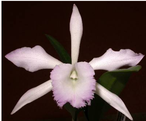
Bc. Saint Alban