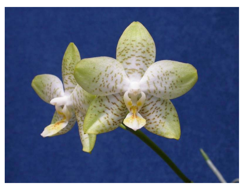
Phal. Gemstone's Gold Fever

Advertising is now being accepted for our newsletter. The size and number of ads may be limited at the discretion of the editor. Advertising Rates per issue are: \frac{1}{4} page $10, \frac{1}{2} page $20, 1/8 page text only $5.