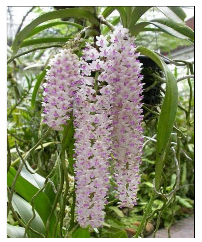
(top left) Rhynchostylis retusa (top right) Gongora ecornuta (middle right) Masdevallia tuerckheimii (bottom right) Mormodes sp. (bottom left) Sigmatostalix picturatissima