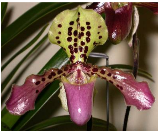
Paphiopedilum Wossner Tigerhenry