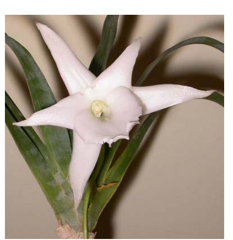
Angraecum Lemförde White Beauty

Blue – Stanhopea jenishiana – Mellard/Marino : The Stanhopeas are a fascinating group of New World orchids distributed from Mexico to Brazil, normally in wet montane forests. Their flowers are larger to very large, wonderfully unusual and complex, and arise from an inflorescence that normally grows straight downward from the base of a mature pseudobulb. For this reason, a wire basket lined with moss is the best choice as it provides the least amount of obstruction to developing flower