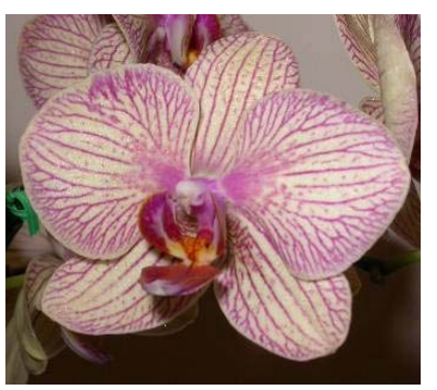
Phalaenopsis Baldan's Kaleidoscope