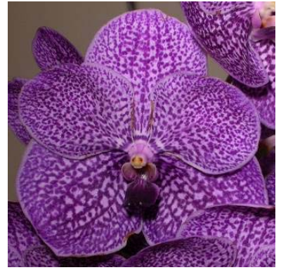
Vanda Leslie's Delight