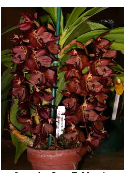
Cycnoches Jean. E. Monnier