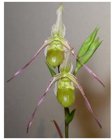
Phrag. Green Hornet