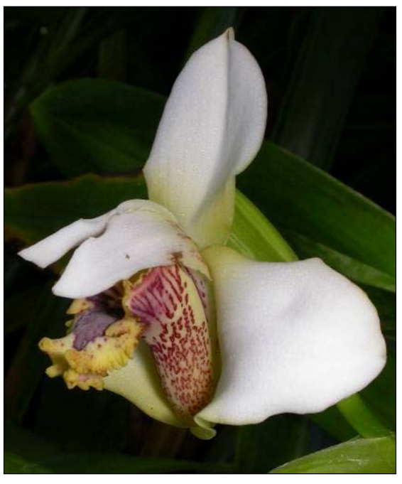
Maxillaria fletcheriana plant grown by the Atlanta Botanical Garden