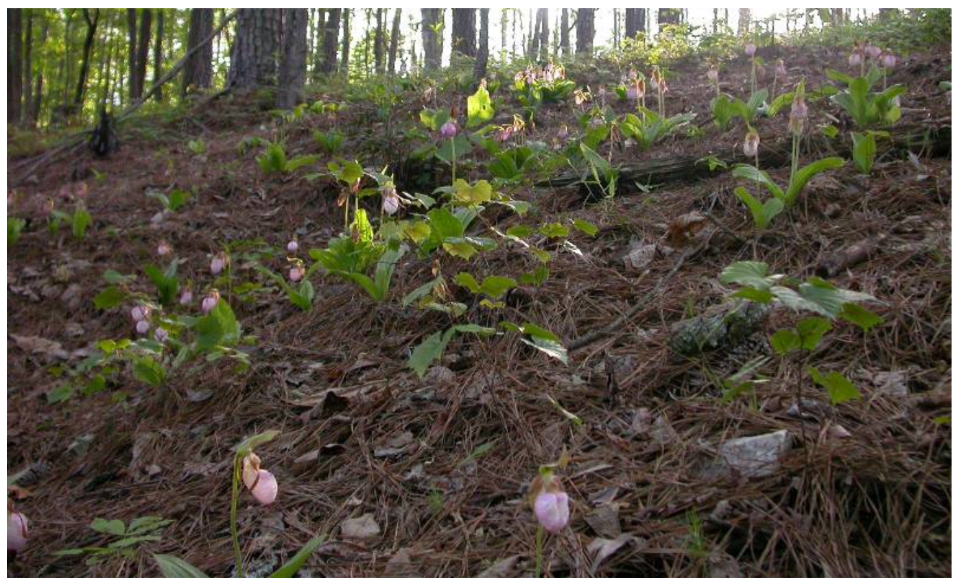
Cypripedium acaule in situ near Atlanta.

All material in the Atlanta Orchid Society Bulletin is copyrighted. The articles and photographs are the property of the authors or the Atlanta Orchid Society. Nothing contained herein may be reproduced without permission of the owners.