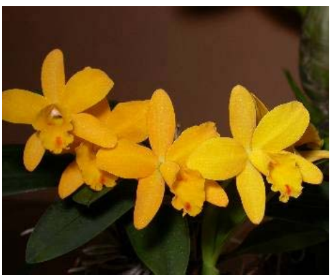
Sc. Beaufort 'Elmwood'

Beaufort has had a greater impact on the world of miniature and compact cattleyas than any other single orchid hybrid. And yet it took a while for hybridists to understand its value. The cross is Sophronitis coccinea x Cattleya luteola and was registered way back in 1963 by Casa Luna orchids of Beaufort, SC (pronounced Byew'-fert ). But the first hybrid made from it to be registered wasn't until 1983, fully two decades later! Once tetraploid mutations were available, carrying better form, color and substance, its true value as an orchid parent became clear. There are now more than 500 registered hybrids that trace back to Sc. Beaufort, and a disproportionately large number of them are outstanding. In fact, 25% of all first generation hybrids have received at least one flower quality award! There are beautiful minis such as Slc. Dream Catcher and Slc. Jungle Beau, and full, well shaped compact hybrids such as Pot. Little Toshie and Slc. Final Touch, all blooming twice or more per year. Once yellow, red, orange and beautiful blends thereof were uncommon colors in Cattleyas. Now, these jewel tones are everywhere to be seen. Yet the select tetrapolid forms of Sc. Beaufort are so valuable as parents that they continue to be closely guarded, and you will rarely, if ever, find them for sale! The clone 'Elmwood' is a diploid form which received its Award of Merit from the AOS in 1982.