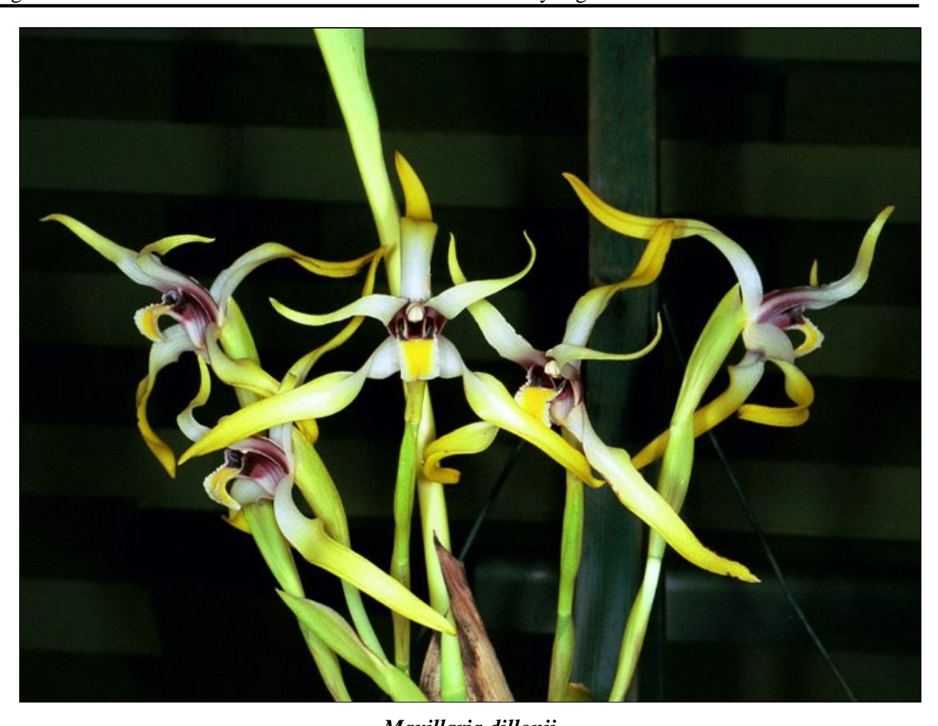
Maxillaria dillonii