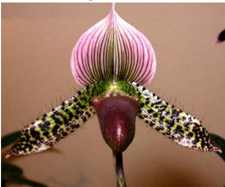
Paph. Raisin Jack 'Jim Elmore'