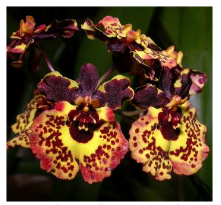
Tolumnia Sundown Reef 'Spotted Ewok'