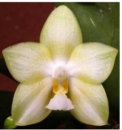
Phal. Yungho Gelb Canary 'Joseph Wu'