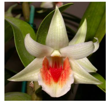
Dendrobium Green Lantern