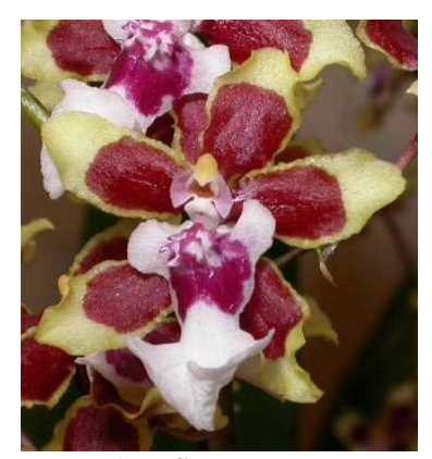
Onc. Sharry Baby