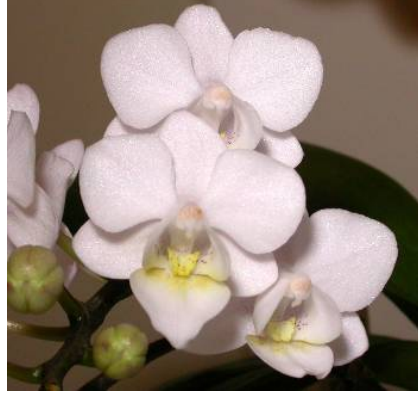
Phal. (Liu's Rainbow x Timothy Christopher)