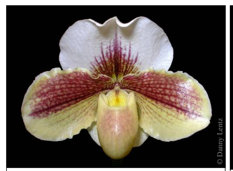
Paphiopedilum Victoria's Song 'First Love' HCC/AOS 78 pts. (Via Victoria x White Legacy) Natural Spread: 11.1-cm H x 8.5-cm V

One flower on one 18-cm inflorescence; dorsal sepal white, light yellow basally radiating longitudinal burgundy bands; synsepal light chartreuse radiating darker chartreuse veins; petals cream colored, heavily tesselated burgundy upper half, faint burgundy lines lower half; pouch light yellow faintly dusted light rose; staminode darker yellow with burgundy hairs basally; substance firm; texture matte.