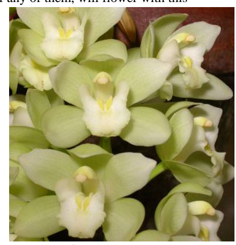
Cym. Honey Bunny