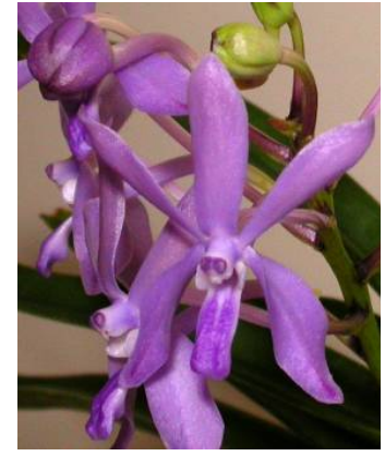
Darwinara Charm 'Blue Pacific'