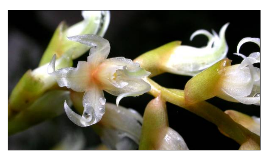
(top left) Bulbophyllum laxiflorum (top right) Schomburgkia wallisii (middle left) Mormodes ignea (middle right) Osmoglossum pulchellum (bottom left) Dendrochilum cootesii