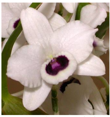
Den. Yukidaruma 'King'

Red – Paphiopedilum niveum - Kessler White – Paphiopedilum Dellaina 'Birt' – Kessler