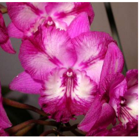
Ctna. Jamaica Gem 'Marble Branch'

Red - Cymbidium tracyanum - Ramborger White - Cym. Show Girl 'Sharrer' - Mellard/Marino