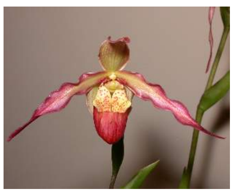
Phrag. Young Lindley