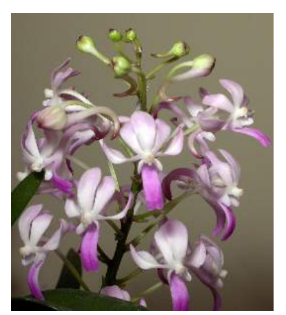
Neostylis Lou Sneary 'Pinky'

Blue – Neostylis Lou Sneary 'Pinky' AM/AOS – Collier/Reinke: This is a terrific vandaceous intergeneric hybrid that has wide appeal because of its small size and vigorous habit. It is a cross between the miniature Neofinetia falcata and the compact