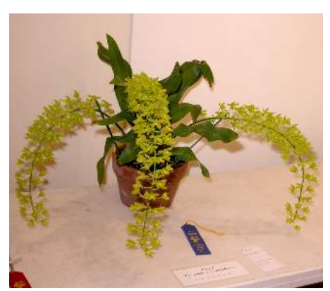
Grammatophyllum scriptum var. citrinum 'Hihimanu'

Don't let the name fool you, the Orchid Digest is a non-profit membership-based organization dedicated to orchids. Designed to appeal to the mid-range to advanced grower nothing beats the Orchid Digest . For just $32/year you get 4 issues of full-color, in-depth articles about orchids. The magazine is large format and the fourth issue of the year is always an extra-special issue devoted to a single genus. For membership application forms contact Fred Missbach (404-237-1694)