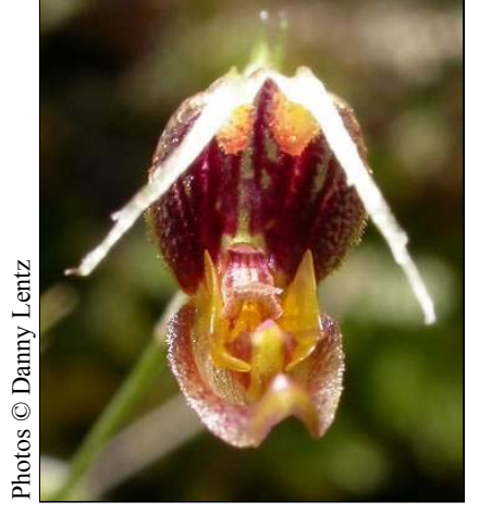
(top left) Epidendrum ruizianum (top right) Bulbophyllum careyanum (middle left) Scaphosepalum peruvianum (middle right) Aerangis articulata (bottom left) Scaphosepalum rapax (bottom right) Scaphosepalum andrettae