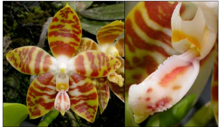
Phal. amboinensis is from Indonesia (Molucca Archipelago and Sulawesi).

While looking through the greenhouses this month it was interesting to run across a bench with a half-dozen Phalaenopsis species in flower and realize that they were all fragrant, even a plant of Phal. equestris . With the large numbers of non-fragrant phal hybrids on the market it's easy to forget that there are many species and hybrids in the genus with pleasant fragrances. Here are some that were in bloom during April. [One cultural note: With the big white or pink hybrids many of us will put them in cooler temperatures (50's F) during the fall to help stimulate blooming. Some of these species don't like to drop below 60 degrees. Ever. Some of them may require 65 degrees. As with all orchid species it's a good idea to check out the needs of the plant before you try growing it.]