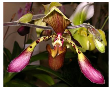
Paph. lowii 'A.O.C.'