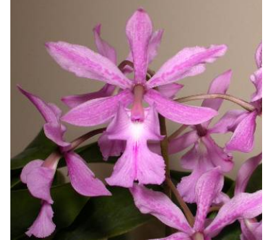
C. Angelwalker x Epi. stamfordianum