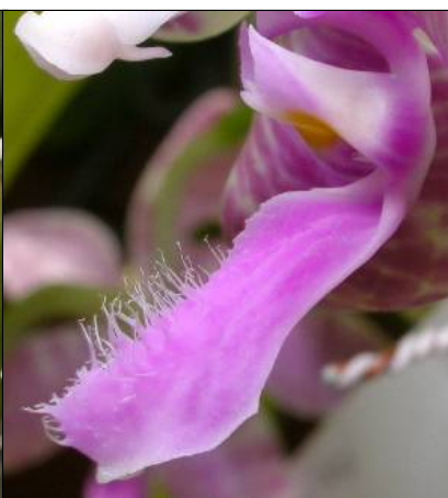
Phal. lueddemanniana 'Woodlawn'