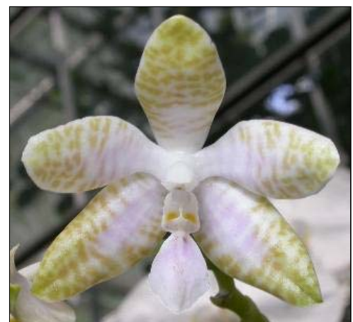
Phal. lueddemanniana var. ochracea 'Greenfinch'

Phal. lueddemanniana is endemic to the Philippines. It has long lasting and very fragrant flowers.