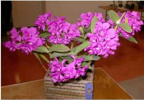
Cattleya skinneri 'Casa Luna'