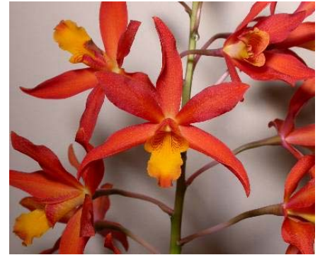
Lc. Rojo x Myrmecophila tibicinis

(Blue) Lc. Rojo x Myrmecophila tibicinis : A mere 26 registered hybrids exist between Myrmecophila (formerly Schomburgkia ) tibicinis and other members of the cattleya alliance. Our ribbon plant is a beautiful example of some or the better qualities this species can bring out in a hybrid: tall upright spikes, well spaced and evenly arrange flowers, attractive wavy segments and rich colors. Yet the breeder (H&R Nurseries of Hawaii) has chosen not to register it. While plant size may be against many of these hybrids, they are usually far more manageable than the species itself, which can produce inflorescences in excess of 10 feet in length! There is at least one compact hybrid that is worth seeking out: Myr. tibicinis x Bl. Richard Mueller = Brassolaeliophila Tiger Lily (formerly Maclemoreara Tiger Lily). More such hybrids should be attempted to help ease the sameness of so many miniature and compact cattleya hybrids.