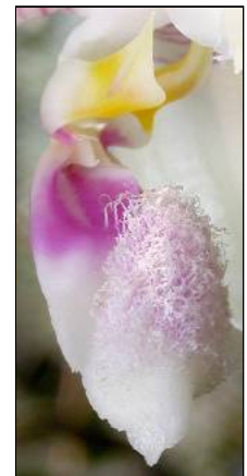
Phal. fimbriata occurs in Indonesia (Java, Sarawak, and Sumatra). It is very fragrant.