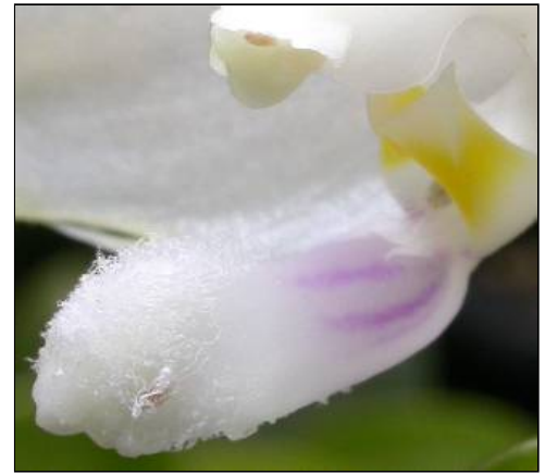
Phal. tetraspis 'Orchid Man'