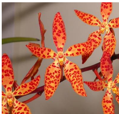
Ernestara Fire Storm