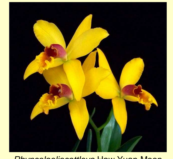
Rhyncolaeliocattleya Haw Yuan Moon ( Rlc . Waikiki Gold x C. briegeri )