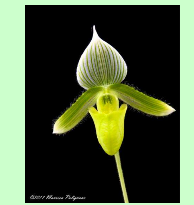
Paphiopedilum Petula 'Papa Le,' AM/AOS Exhibited by Geni Smith