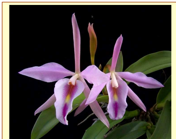
Epi. nocturnum x C. percivaliana This is the first blooming of the only seedling that resulted from this cross!