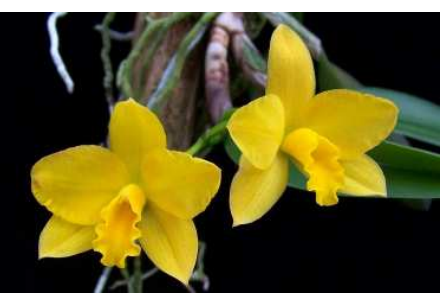
C. Yellow Warbler (Love Fresh x cernua)

online store: www.greenbarnorchid.com We ship throughout the US and all over the world 5185 Conklin Drive Delray Beach, FL 33484 (561) 499 - 2810