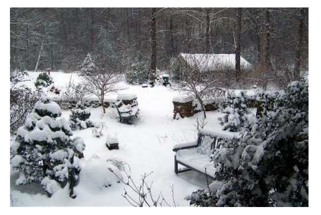
The snowy scene at Marble Branch Farms on January 10, 2011 was typical of conditions all across North Georgia and the Carolinas.

The meeting was canceled due to weather.