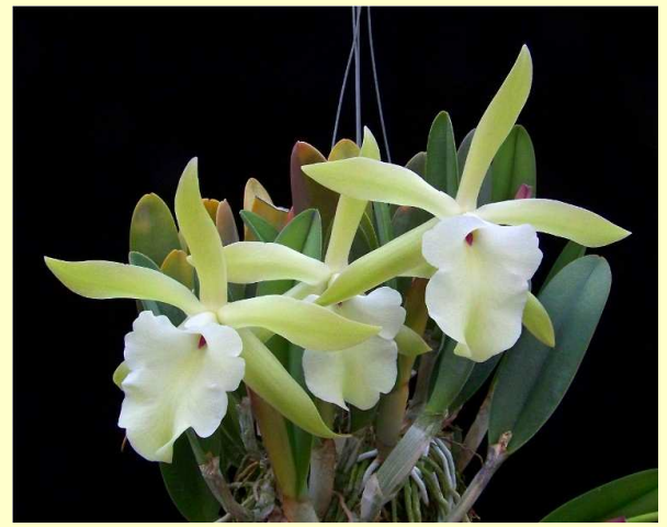
Rhyncolaelia glauca This one needs very high light to do well!