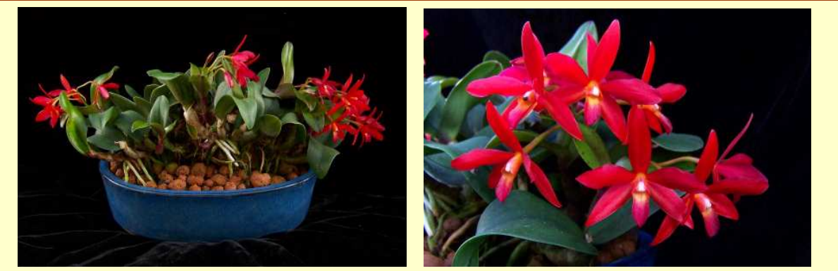
C . Doctor Frederick Schechter ( milleri x cernua ) A curious 'micro-mini' we grow in a Bonsai pot! Blooms frequently.