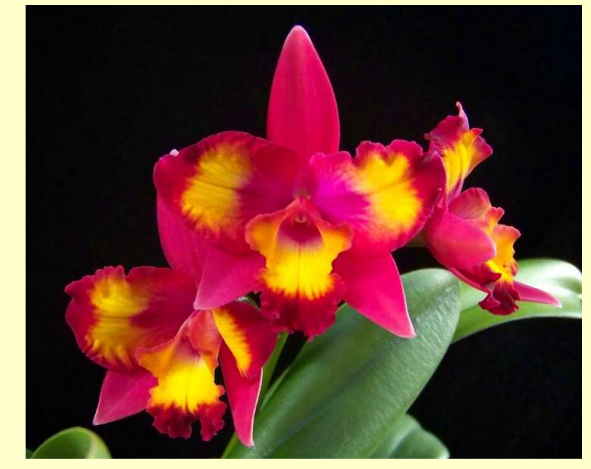
Cattleya Hawaiian Splash 'Lea' A cute little miniature plant flower that blooms often with vivid colors.