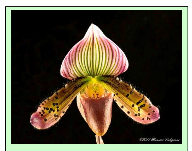
Paphiopedilum Super Illusions 'Stones River,' HCC/AOS Exhibited by Stones River Orchids