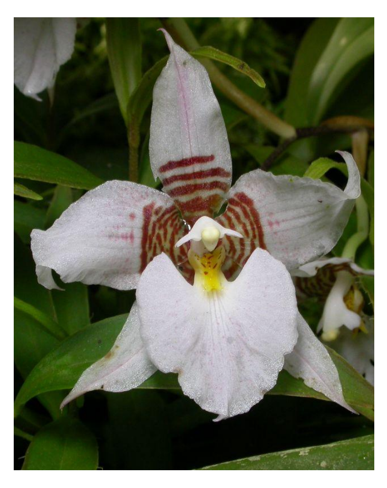
One of the lovely orchids to be found at ABG