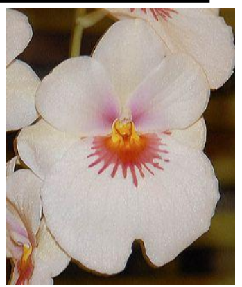
Miltonia Mom's Choice 'Her Flower'

This wonderful, fragrant miniature vandaceous species ranks as one of the northernmost growing epiphytic orchids known, as it occurs around the Japan islands and extends even into coastal Korea. It is revered in Japan, where it has been cultivated for centuries, and where dozens of named forms are recognized with flowers or foliage that differ from the type. The scarcest and most unusual examples can be as expensive as rare gems. The