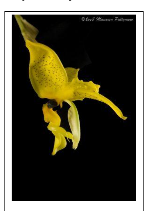
Stanhopea wardii 'Edwin Boyett', AM/AOS