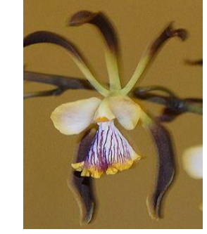
Encyclia Renate Schmidt