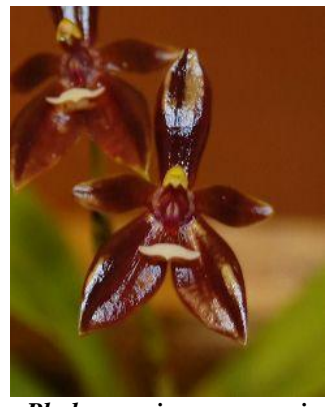
Phalaenopsis cornu-cervi fma. chattaladae