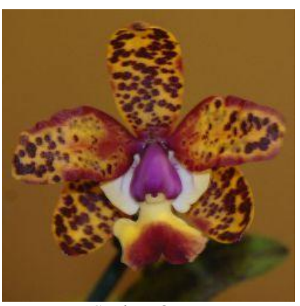
Cattleya Ocelot 'Happy Halloween'

If you are like me, you wish there were more cute spotted compact cattleyas like this one available commercially. They are a bit tricky to breed since spots are not generally produced unless inherited from both parents. In the case of C . Ocelot, the spotted miniature species, C. aclandiae , appears as a grandparent on both sides of the family tree. The actual cross for this orchid is C . Brabantiae x C . Precious Stones. The latter hybrid is usually solid red, because it has only one spotted parent, but it is still capable of passing along spotted flowers if, as in this case, the other parent is also of spotted lineage. Fred Clarke of Sunset Valley Orchids in California is currently working on a breeding program to produce more compact spotted