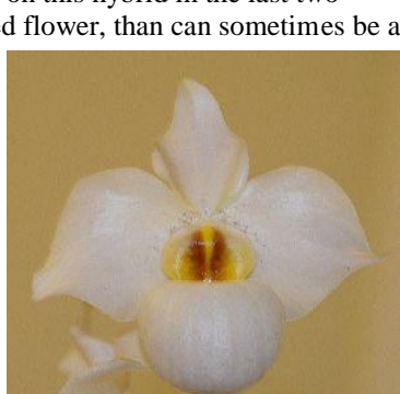
Paphiopedilum Armeni White