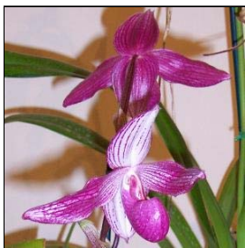
Paph. Del Rosi