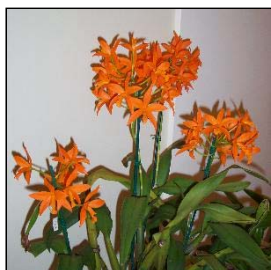
Lc. Trick or Treat 'Marble Branch'