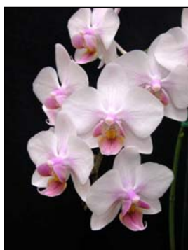
Phal. (aphrodite x Be Tris) 'Sweetheart', AM 80 pts Nat. Spr. 5.0 cm, V. 4.5 cm Exhibitor: Stones River Orchids