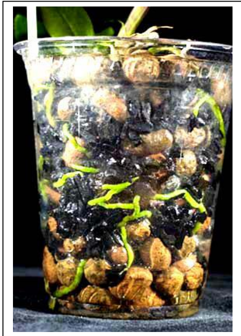
Figure 2, S/H Pot and Medium