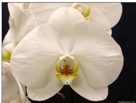
(Phal. Helengene x Dtps. White Wonder) 'White Valentine', AM 83 pts Nat. Spr. 12.8 cm, V. 11.3 cm Exhibitor: Stones River Orchids