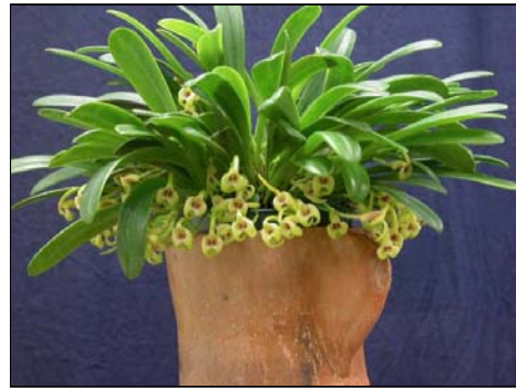
Masd. livingstoneana 'Sweetbay', CCE 91 pts 90 flowers and 11 buds Exhibitor: Peter & Gail Furniss