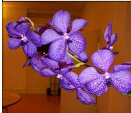
V. Manuvadee 'Blue'

Vanda Manuvadee 'Blue' : This is a cross involving V. coerulea backcrossed to a complex blue Vanda hybrid and illustrates the difficulty encountered in V. coerulea breeding. When flowers of this species open, the petals twist such that the backside of the petals faces forward (in many of the fine V. coerulea clones available today the petals still twist however they twist by 360 degrees rather than 180 giving the appearance of untwisted presentation). When crossed to species and hybrids that do not exhibit twisted petals, the result is often intermediate twisting so that the petals are borne at an angle to the plane of the rest of the flower. This is easily seen in the photo of this clone.