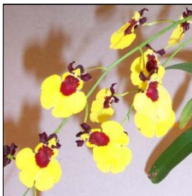
Onc. Memoria Kiyoshi Atkasuka 'Volcano Queen'

This genus now circumscribes all of the species with flattened pseudobulbs (contrasting the egg or globe-shaped pseudobulbs of Encyclia ), 2-3 narrow fairly thin leaves and short unbranched terminal racemes of flowers with "shell-shaped" labellums which do not encircle the column ( Prosthechea (Encyclia) cochleata ). Prosthechea chacaoensis occurs from Venezuela and Colombia north to Mexico commonly growing in oak forests.