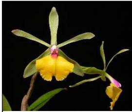
Epc. Rene Marques 'Flame Thrower'