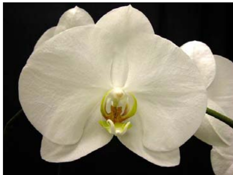
(Phal. Land O' Cotton x Dtps. Three Rivers) 'Tejas', HCC 76 pts Nat. Spr. 12.0 cm, V. 12.0 cm Exhibitor: Ken Avant