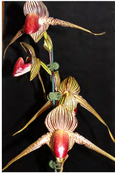
Paphiopedilum rothschildianum – Danny Lentz

That being said, a well grown specimen of Paph. rothschildianum requires a higher level of attention to detail and dedication than do the many hybrids created from it, and far more than the popular complex and Maudiae type crosses. There are volumes of advice from growers that have been successful with this species, including some that seems to contradict the climate data from its restricted natural range on the lower slopes (2000-4000ft) of Mt. Kinabalu in Borneo, a World Heritage Site that tops out at 13,345 feet above sea level. Down where the plants grow, nights average about 60F and days in the low 80's year round and rainfall is regular and evenly