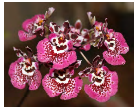
Tolumnia Jairak Rainbow ‘Princess’ – Danny Lentz

All the species involved are native to the Caribbean, where they occur as twig epiphytes in humid, bright locations. Their need for frequent water with perfect drainage, good air movement and high humidity make them challenging subjects for culture inside the home, but