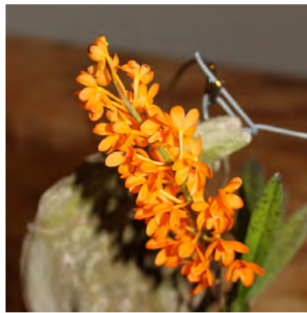
Vanda miniata ‘Koi Gold’ – Lynne Gollob

The genus Ascocentrum , which had been in use since 1913, was merged into Vanda just shy of a century later in 2012. As with our Phalaenopsis winner, the reason