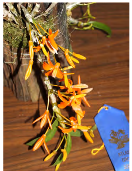
Dendrobium unicum – Vinh Nguyen

The more recent batches of Den. unicum to make it into the market seem a bit more robust than those of the past and I've seen plants grow up to 12 inches or more tall which is well above