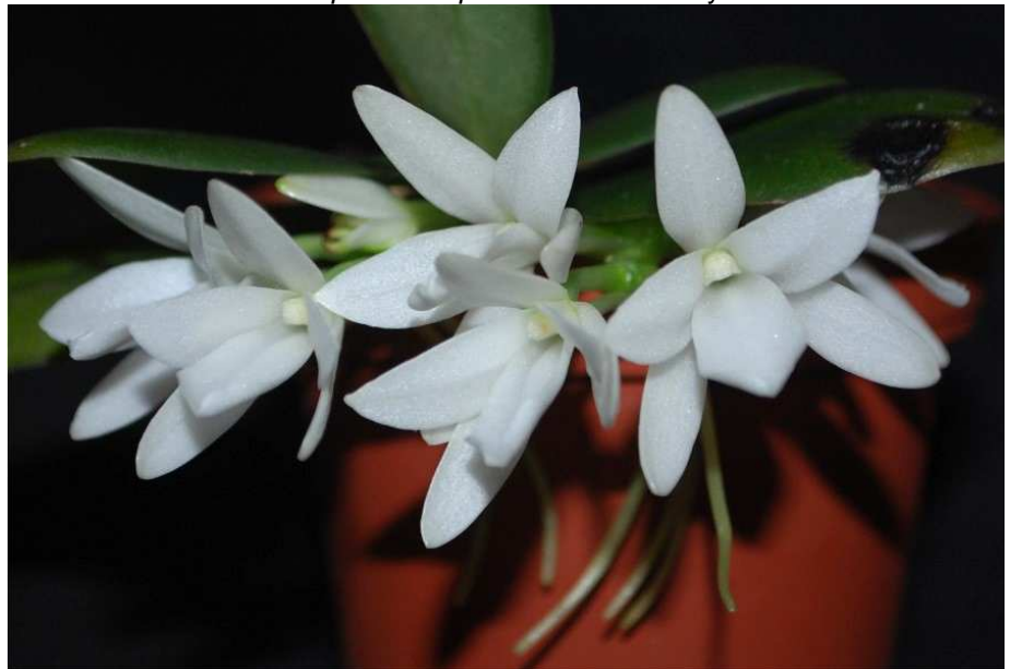
Aerangis fastuosa – Danny Lentz

This is a really nicely flowered example of a dwarf species native to the eastern slope of Madagascar at about 3000 feet above sea level. It prefers shaded or filtered light conditions, with intermediate temperatures, and regular watering accompanied by excellent drainage. It is difficult to keep mounted plants moist enough for most growers, so pots or baskets filled with a fast draining medium are preferred.