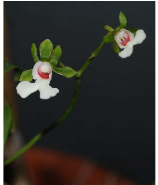
Oenoia rosea Carson Barnes

An unusual and infrequently seen species from Madagascar and Réunion island.