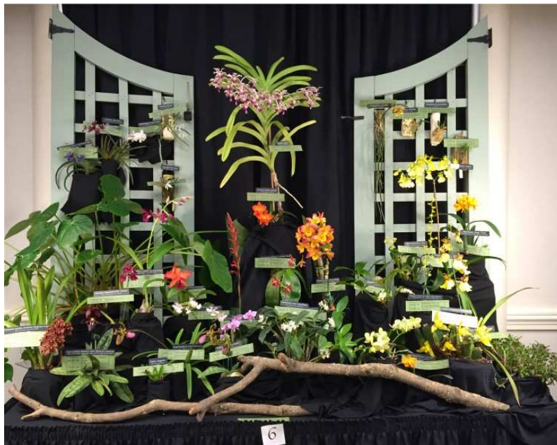
ATLOS exhibit for the Heart of Dixie Orchid Show in Huntsville, AL last month

For directions to the Atlanta Botanical Garden, please visit their web site at www.atlantabotanicalgarden.org