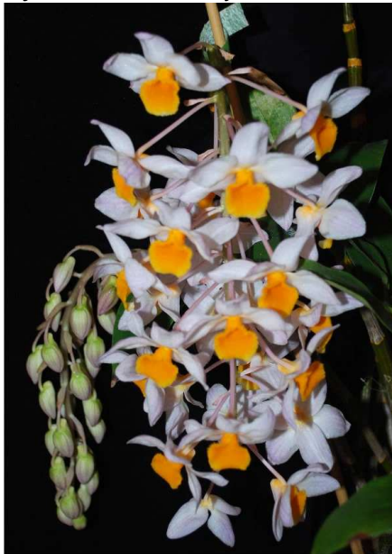
Dendrobium thyrsoiflorum