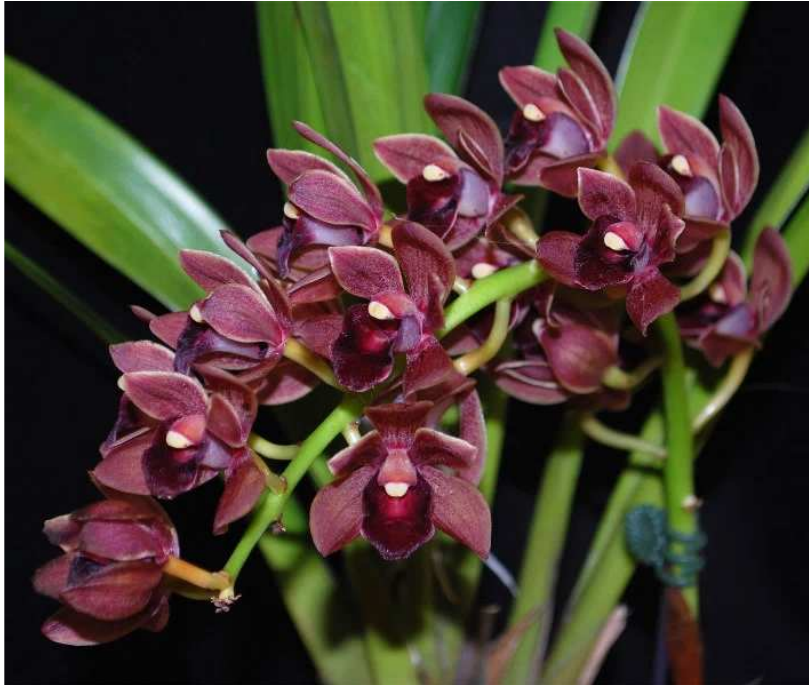
Cymbidium Dorothy Stockstill 'Forgotten Fruit,' AM/AOS – Geni Smith

Give this orchid a deep pot with a well-draining mix fortified with compost and feed heavily while in active growth. Keep the media at least slightly moist at all times and provide the plant with bright to very bright light. A fall chill, leaving the plant outside until danger of frost, will help insure prolific blooming. Several west coast growers sell blooming size divisions of this captivating orchid by mail order.