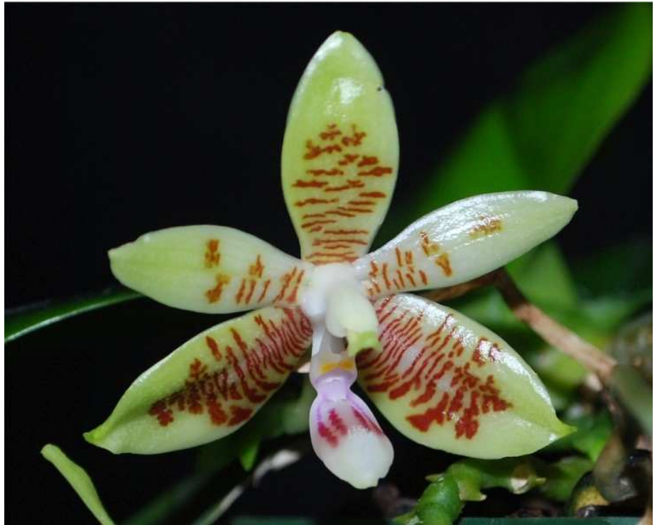
Phalaenopsis inscriptosinensis – Danny Lentz

It is an intermediate grower, being most common around 3000 feet above sea level, in shaded locales where rainfall is abundant in all months. It is interesting for its unique qualities, but rather few flowered and none of the attempted hybrids have achieved anything that might be considered a breakthrough in breeding within the genus.