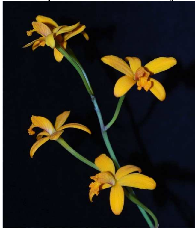
Cattleya luetzelburgii – Carson Barnes

to write a correct tag for this commonly grown and reliable orchid!