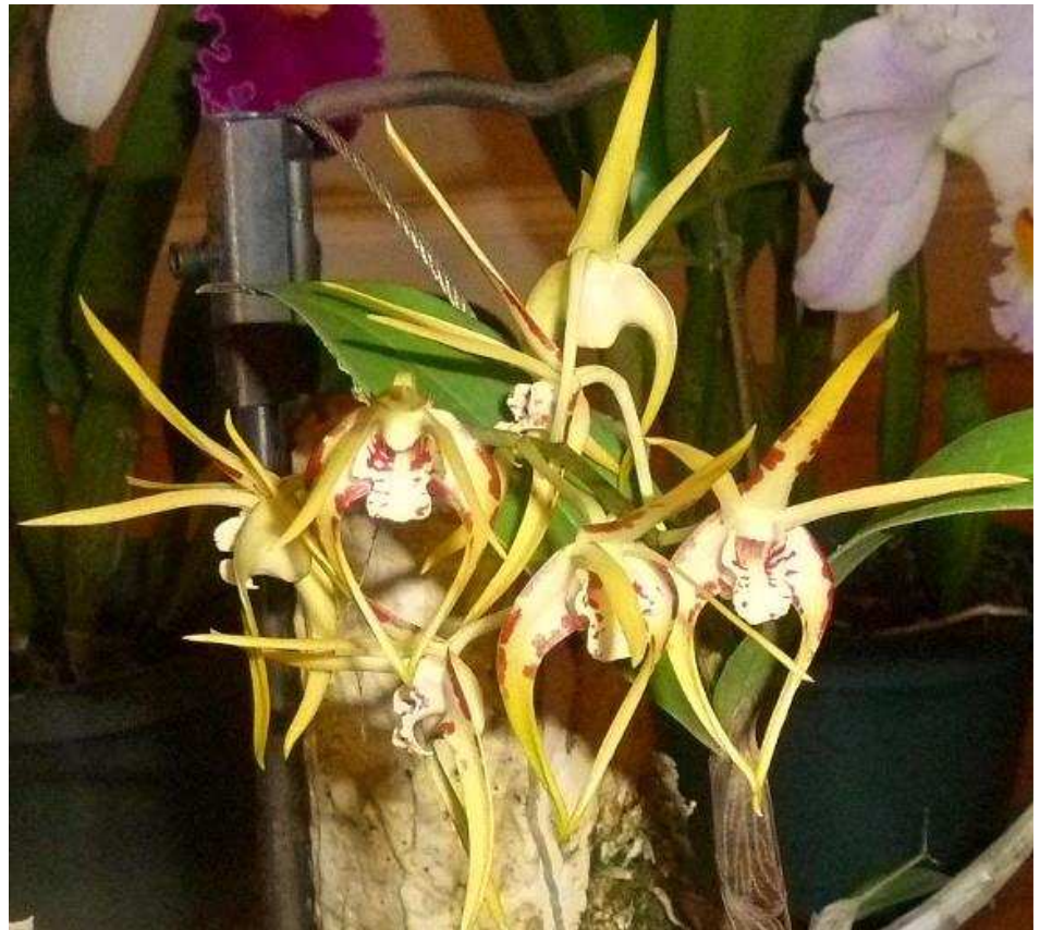
Dendrobium Aussie Parade x Hilda Poxon