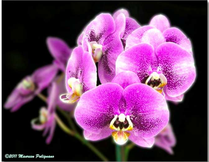
Phalaenopsis Yu Pin Lady 'Stones River' HCC/AOS

Tom has traveled coast to coast and internationally speaking on