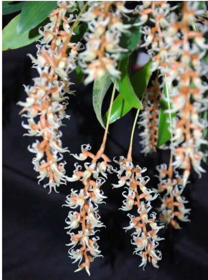
Dendrochilum cootesii