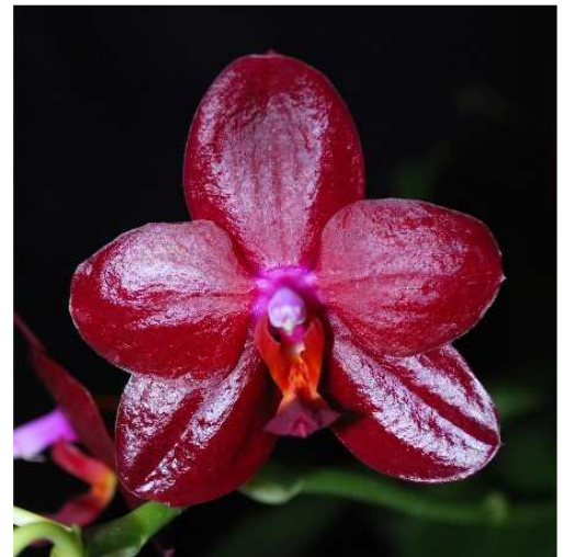
Phal. Sogo Grape – Larry & Linda Mayse

While Aer. luteoalba will grow in a pot with a very open medium, it normally is at its best when grown mounted and attended to on a frequent basis. It enjoys shade or filtered light, high humidity, good air movement and regular watering, which can mean at least daily in hot dry weather. Blooming peaks in both spring and fall and seems to be a result of the conditions under which it is grown. Well cared for plants may produce 3 or 4 spikes of blooms from each growth, and bear as many as