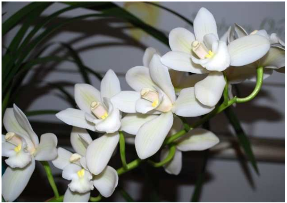
Cymbidium Pastoral – Lynne Gollob

Both hybrids descend from species that are all cool growers, coming from climates that generally are no warmer than the upper 70's at the height of summer and drop to near or just below freezing in winter. Yet these two have shown to be highly adaptable to our summer heat, as are many other good choices out there that are equally tolerant.