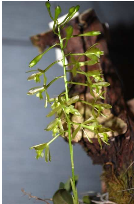
Epidendrum magnoliae Roy Harrow