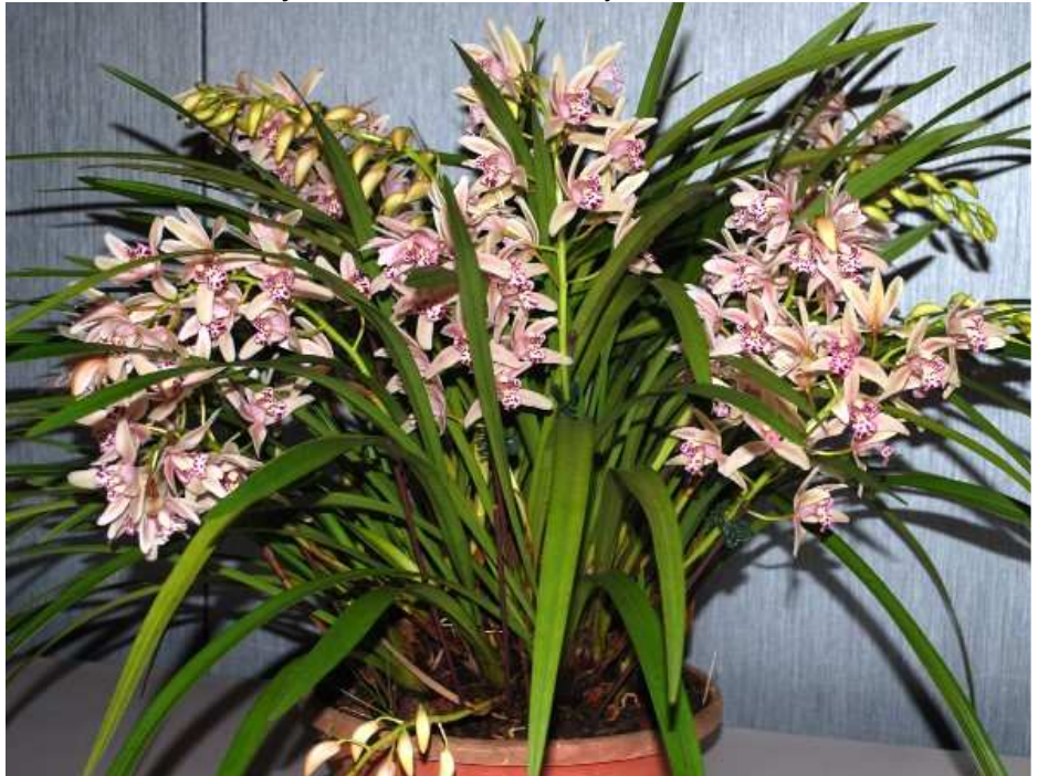
Cymbidium Flirtation – Gary Collier & Mark Reinke

When growing Cymbidiums it is important to remember that they are primarily terrestrial orchids with large, aggressive root systems and require somewhat different cultivation practices from typical epiphytic types. They like deep pots with a richer media. We like to take orchid bark and mix it with Perlite, chopped tree fern and a generous amount of well-rotted compost, but many different mixes would work as long as they