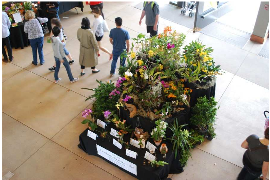
Atlanta Orchid Society Visitors Center Display 2015

If you can get us your entries a day or two ahead of time it will help greatly with the process of checking all of the names. Of course we will still enter any other plants that you bring on Thursday, pre-entry is not required.