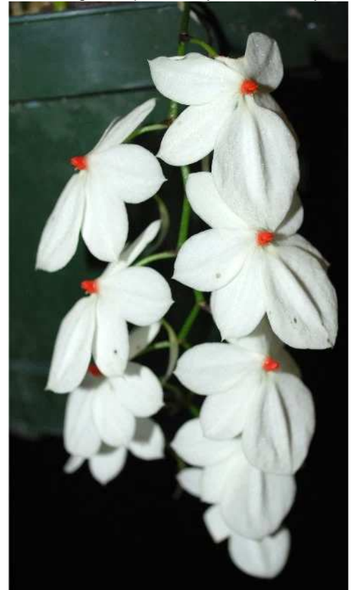
Aerangis Luteoalba – Lynne Gollob

15 or 20 or more neatly arranged and long lasting flowers on each. This orchid does not seem to be particularly long lived and can seemingly bloom itself to death. However, it is fairly easy to obtain new plants when the time comes, and the strains currently available have much fuller flowers than typical wild plants.