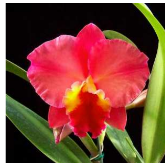
R/c. Newberry Sweetheart