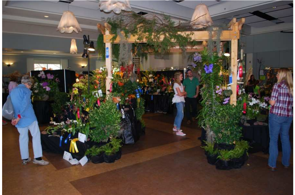
Atlanta Orchid Society Main Display in the 2015 show

winners and place the ribbons. This can be a good way to learn more about what judges look for in the plants. You don't need to be very experienced to help with this.