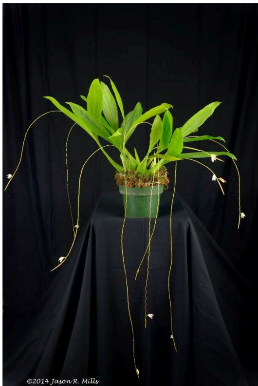
Coelogyne bilemellata 'Shan,' CBR/AOS Exhibited by Carolina Orchids Flower detail right