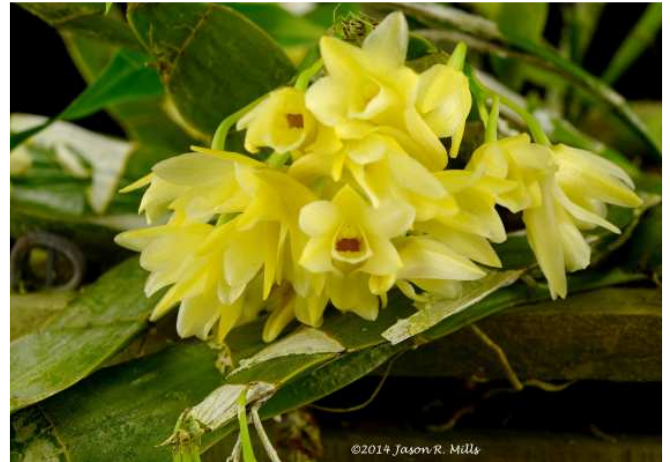
Dendrobium platycaulon 'Sweetbay', AM/82 pts., Exhibited by Pete & Gail Furniss