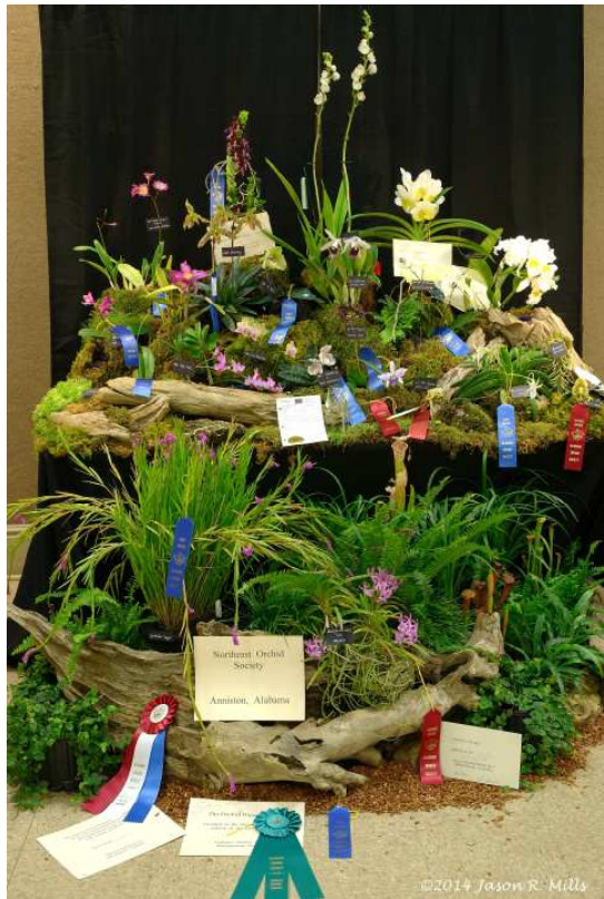
Show Trophy, ST/AOS, 83 pts. Exhibited by Northeast Alabama Orchid Society