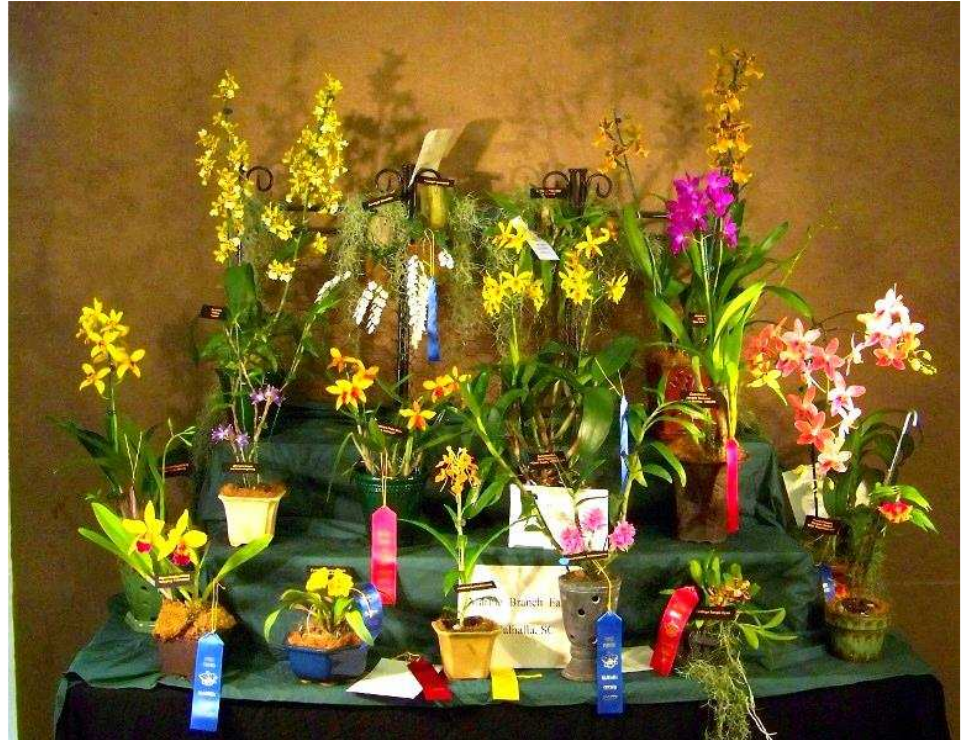
Marble Branch Farms exhibit at the Alabama Orchid Society Show and sale, September 19-21, 2014

For directions to the Atlanta Botanical Garden, please visit their web site at www.atlantabotanicalgarden.org