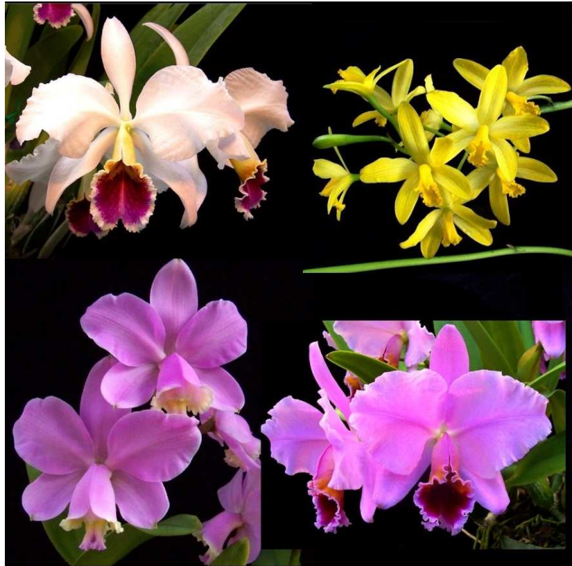
Holiday flowering Cattleya species clockwise from upper left: C. percivaliana v. semi-alba 'Jewel,' C. flavasulina, C. lodiggesii, C. percivaliana 'Summit,' FCC/AOS

Our annual gift exchange is always a big hit! (Participation is not required – but, you will likely regret it if you sit out!) Join in the fun by bringing a wrapped gift worth $15. Everyone who brings a gift will receive a raffle ticket. After dinner and the meeting, tickets will be drawn randomly. When your number is called, select a present. Most gifts are orchid related. In the past folks have