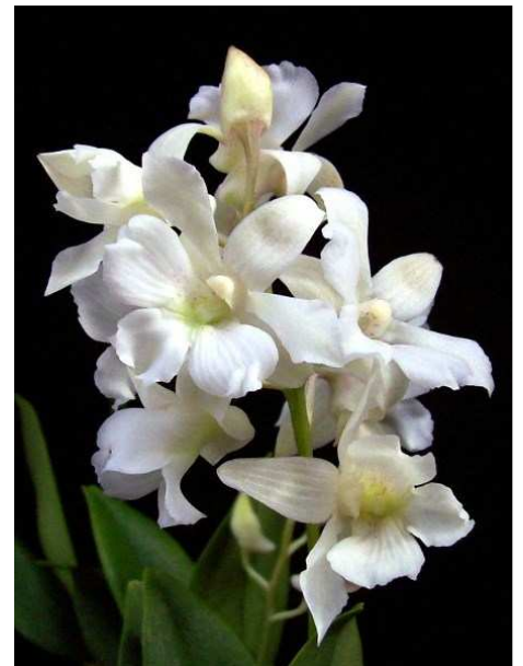
Den. Mini Snowflake is a rewarding member of the Latouria section that adapts well to windowsill culture.

Latouria section of the genus. These are evergreen orchids that come from New Guinea and surrounding islands with clumps of furrowed, club-shaped growths bearing several pliable, but tough leaves near the tip. This particular cross is a primary hybrid between the miniature growing Den. aberrans and the medium sized Den. johnsoniae , and is generally a very compact grower, producing upright spikes of primarily white flowers from side nodes near the apex of mature growths that are generally more than one year old. The flowers are long lasting and can occur in more than one flush per year. All of the Latouria types will flower well in medium light levels and grow well in the 60-80F temperature range, making them excellent choices for windowsill culture. They prefer small, well drained pots and like to receive regular watering throughout the year, never staying dry for long. New inter-sectional breeding between the Latouria types and Phalaenopsis and Semi-Antelope types is bringing more color into this group without significantly altering their ease of culture and floriferousness so watch for more