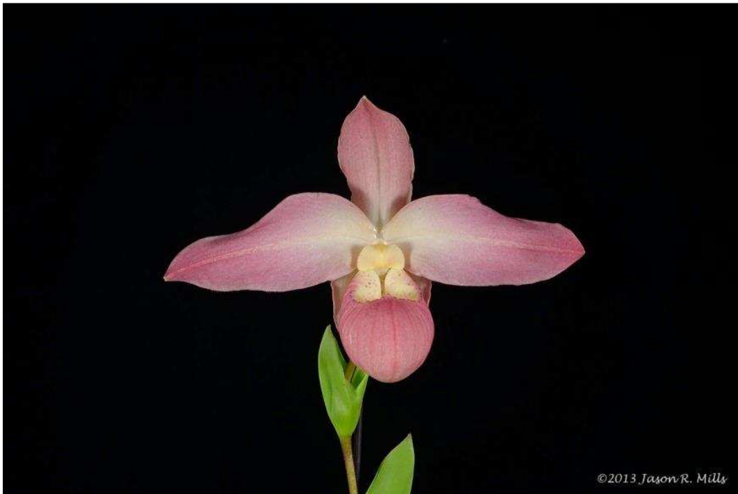
Paphiopedilum wilheminae 'Mocha-Caramel Twist,' AM/AOS, 81 pts Exhibited by Rick Lockwood