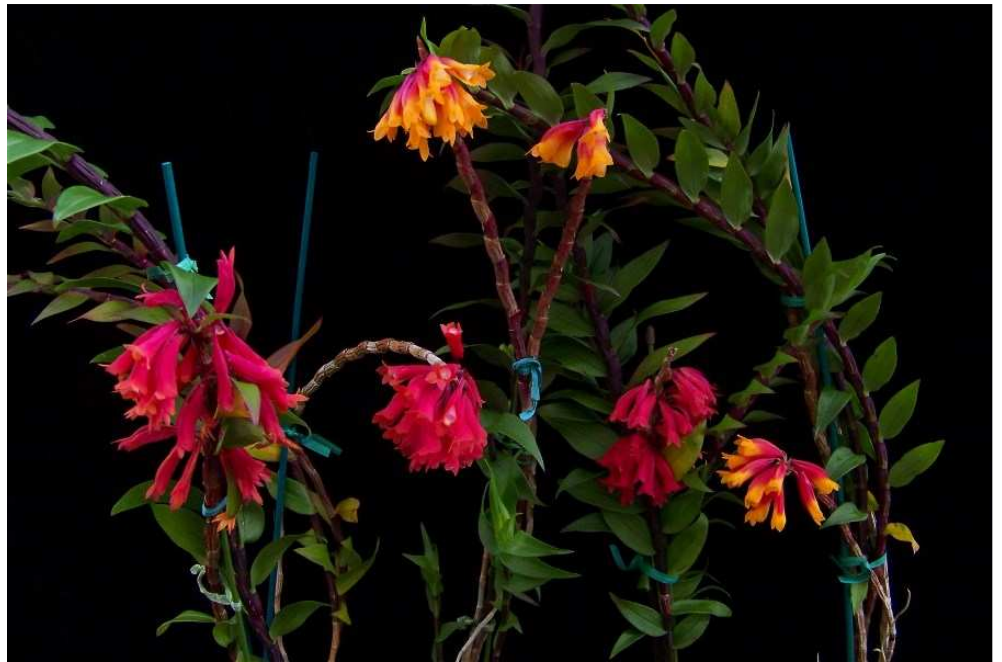
A group of Den. lawesii var. bicolor seedlings in bloom. Note the color variation from plant to plant.

Den. Mini Snowflake is a great example of the breeding program being carried out by Roy Tokunaga of H&R Nurseries in Oahu between the species in the