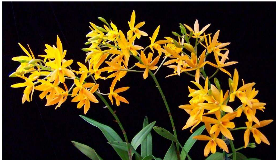
A mature example of Ett. Butterfly Kisses 'Mendenhall,' AM/AOS

Red – Epidendrum porpax – Laurel Burrows