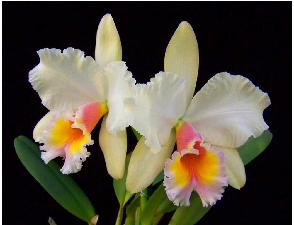
Rhyncolaeliocattleya George King 'Southern Cross,' AM/AOS