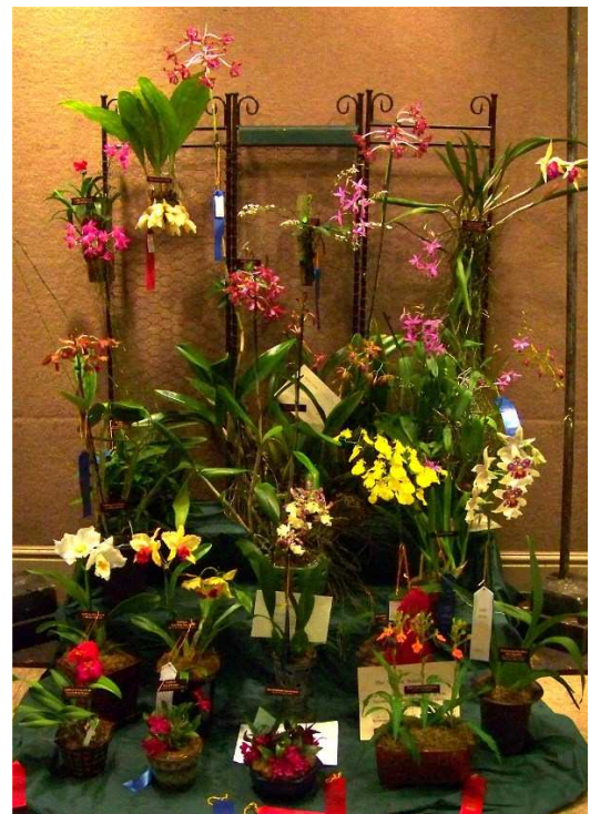
Exhibit by Marble Branch Farms at the Alabama Orchid Society Show