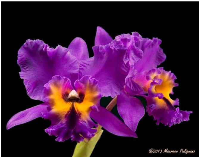
Rhyncolaeliocattleya Jeremy Island 'Deep Throat', AM/81 pts., Fred Missbach