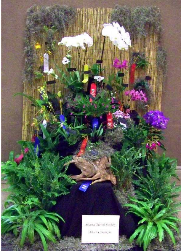
TROPHIES AND RIBBONS Exhibit.....Blue