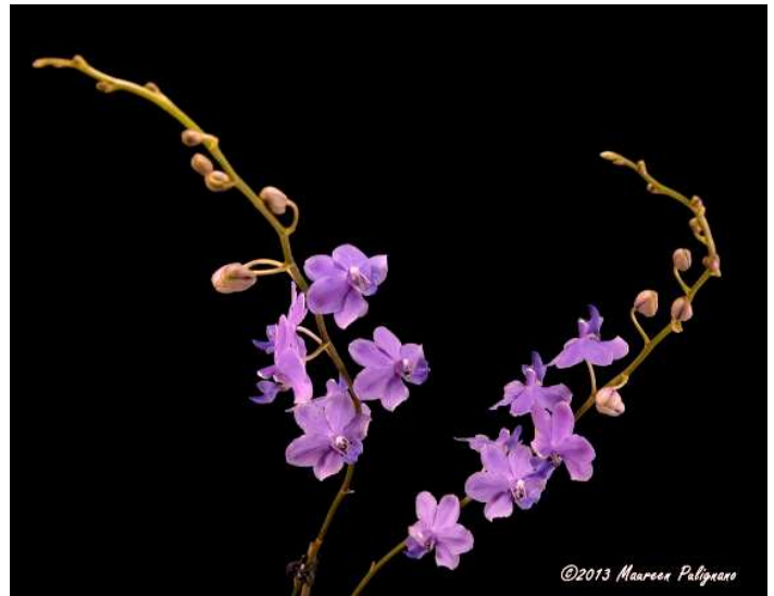
Phalaenopsis Fire Cracker 'Sunny Blue', HCC/75 pts., Roy Harrow