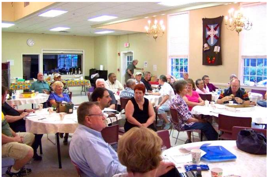
Members enjoying an evening of food, fellowship and fierce bidding at the annual auction held during the September monthly meeting.