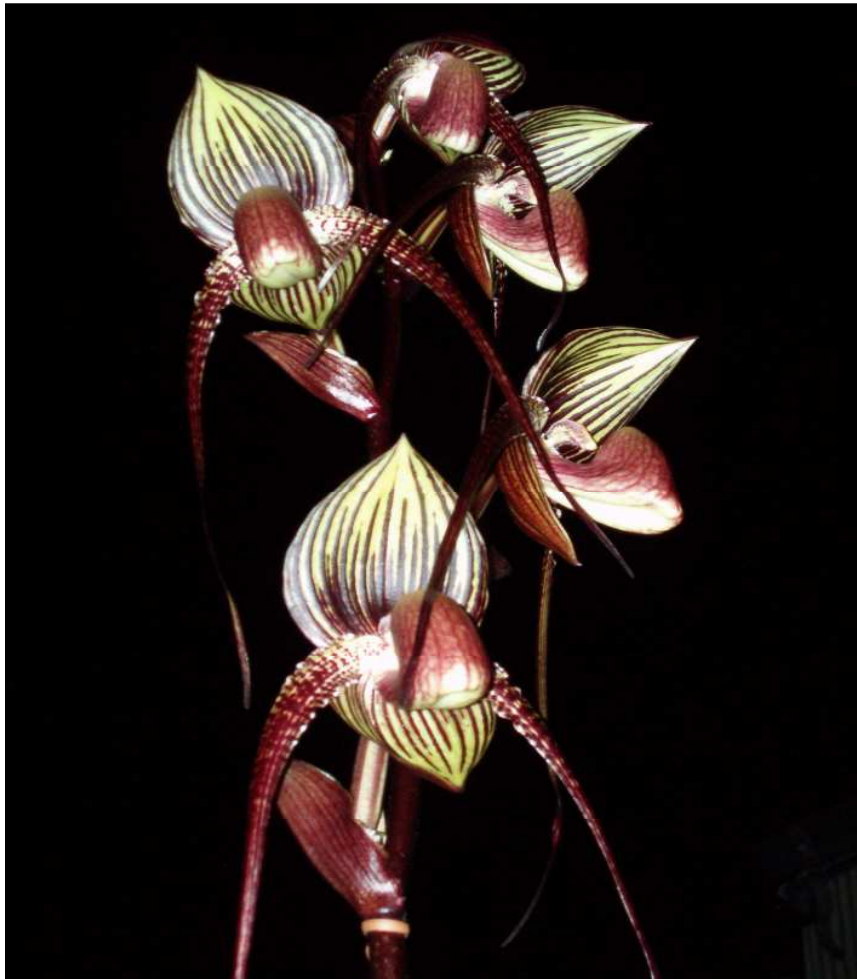
Paphiopedilum Johanna Burkhardt 'Springwater's Masterpiece,' AM/AOS

The future of paphs, or orchids in general he believes, lies in