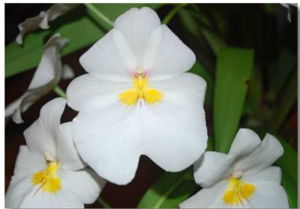
Red – Miltoniopsis Rene Komoda – Marueen Pulignano

While the pollen parent of this hybrid includes a touch of Rodriguezia and Gomesa in its background, the sum total of the cross would be 96% Tolumnia and only 4% of the other two genera, so though it would be an Ilonara by name if registered, it should be treated as any typical Tolumnia hybrid. Bright, indirect light, warm to hot temperatures, regular watering with perfect drainage and good air movement would be the typical recommended growing conditions.