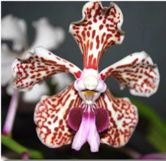
Blue – Vanda suavis var. tricolor ‘Bali Bottlerocket,’ AM/AOS – Carson Barnes

Apparently, this orchid was described as V. suavis in 1848 by Lindley, a year before Hooker described V. tricolor , so some sources elevate it to a separate species. Kew, however, still accepts it as a variety of V. tricolor , with the suavis form favoring the eastern portion of the range that includes Java and Bali in Indonesia. It favors bright locations between 2,000 and 5,000 feet above sea level and is often found in the trees bordering tea plantations. Growing conditions similar to this habitat is easier to create in this climate than those for species from lower, hotter elevations. This particular plant received an Award of Merit at the May, 2013 session of the Atlanta Judging Center for its excellent, strong maroon markings on a clean white background, better than average form, and good presentation on the inflorescence. Grow this plant in a very open medium, preferably in a basket where the roots can hang freely, and give generous water and fertilizer during the growing season, with a dry rest in winter for about two months when the plants receive only occasional misting and very light watering. Trimming the roots of this orchid can set it back considerably, so they must be allowed to grow as unimpeded. A popular choice in vandaceous breeding, V. tricolor is in the background of more than 4,500 registered hybrid to date.