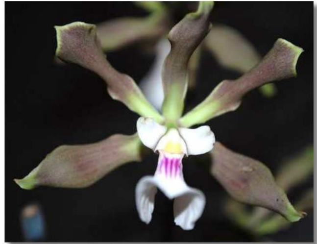
Blue – Encyclia Rioclarense – Barbara Dampog

Encyclia Rioclarense is a primary hybrid between E. cordigera and E. randii , and can vary considerably in appearance based on the specific color form of E. cordigera used. Most frequently, the plants of this grex encountered were made using E. cordigera var. rosea , which displays a large, flat, solid purple lip, and that trait tends to dominate in the hybrid. Many from that pairing will exhibit excellent form. In the case of the exhibited plant, it is likely the typical form of E. cordigera was used, with has a white lip accented by several purple lines in the center. Unfortunately, in this case, the sides of the lip are markedly reflexed which detracts somewhat from the overall presentation.