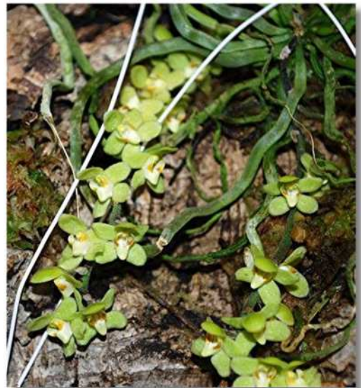
Blue – Chiloschista segawae – Roy Harrow

This is one of about twenty species in the genus of leafless orchids which come from in S.E. Asia, Indonesia and Australia, with Chsch. segawae growing in the area of south central Tawian. Though considered leafless, it may actually upon occasion grow a small leaf or two. For the most part, photosynthesis takes place in the tangle of roots that are green with chlorophyll and emanate from a central crown. There is not a great deal of information available on this plant, though it is perhaps the most widely available leafless orchid species. It apparently prefers a cooler, drier rest in winter to help initiate flowering. It also seems to do best mounted on cork like the plant which was exhibited. Good humidity, light shade, and regular watering during the growing season are recommended.