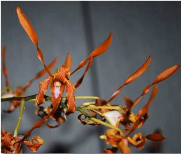
Blue – Dendrobium tangerinum – Carson Barnes

Den. tangerinum is a member of the Spatulata section of Dendrobium , described in 1980 and not frequently seen in collections. It comes from mostly hot lowland areas of New Guinea where it is often found growing in nearly full sun. Plants are medium sized for the section, typically topping out at about 24 inches in height. Flowering favors, spring and summer, but can occur at any time of the year, and the orange to reddish flowers with stiffly erect, twisted petals can last up to six months. Generally speaking, this is a high light, high heat species that performs best when grown in a situation that will require minimal disturbance of the plant in the future. When repotted, plants often are stimulated to produce numerous keikis along the length of the canes and can take several years to resume normal growth and flowering. Nearly four dozen registered hybrids claim this species as one parent, but few have resulted in AOS awards or further breeding efforts, so this may be an orchid best enjoyed simply for its unique attributes as a species.