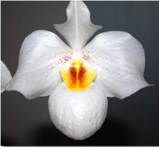
Blue – Paphiopedilum Armeni White – Maureen Pulignano

This orchid is a primary hybrid of Paph. armeniacum x delenatii and those of you present at the meeting David Mellard explained that the normally clear yellow Paph. armeniacum has the result of blocking nearly all the color in the segments of this hybrid, so little or none of its bright hue comes through, nor does the pink lip of Paph. delenatii . Typically, only the column shows color, appearing yellow with brownish markings, and there may be a few minute dots of purple at the base of each petal such as in this example. A favorite of AOS judges, there are many awards for this charming cross, and while most are described as “paper white or porcelain white,” at least a few examples are listed as “butter yellow, creamy white, or eggshell.” There can be either one or sometimes two comparatively large flowers on a strong upright stem that emerges from a small fan of attractively mottled foliage. Flowering peaks in later winter and early spring, but can occur at any time of the year except mid-summer. As with most Paphiopedilum with mottled foliage, this orchid will grow in relatively low light, though perform best in bright diffused shade and intermediate to warm temperatures. When plants are making new growth they should receive frequent water, then somewhat less in winter after growths mature, but never to the point of drying out completely.