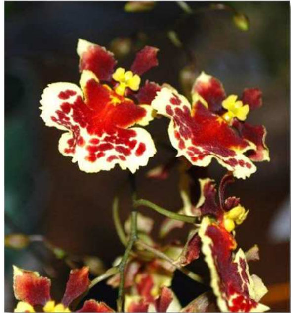
Blue – Tolumnia Sunray x Ilonara Cassie's Prince – Roy Harrow

While the pollen parent of this hybrid includes a touch of Rodriguezia and Gomesa in its background, the sum total of the cross would be 96% Tolumnia and only 4% of the other two genera, so though it would be an Ilonara by name if registered, it should be treated as any typical Tolumnia hybrid. Bright, indirect light, warm to hot temperatures, regular watering with perfect drainage and good air movement would be the typical recommended growing conditions.