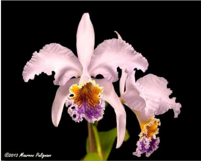
Cattleya mossiae 'Peachy Blue', AM/AOS, 81 pts., Exhibited by Carson Barnes