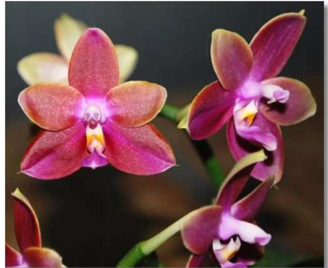
Blue – Phalaenopsis (Corning-Ambo x Penang Girl) – Jarad Wilson

This hybrid essentially combines four species in equal portions, Phal. amboinensis , corningiana , venosa and violacea . All are species with relatively small flowers that arise from fairly short, persistent inflorescences that may bloom for years, but with only a few flowers open at any given time. Their appeal can be found in the heavy substance and depth and blending of the colors, along with the possibility of fragrance, which is uncommon among commercially available Phalaenopsis hybrids. All the species involved are considered hot growers, that prefer low light levels and high humidity in order to flourish.