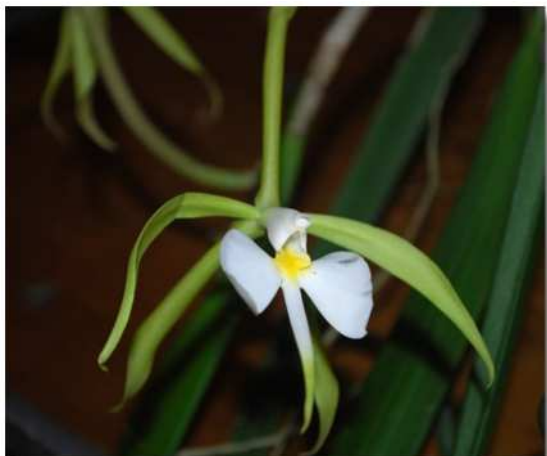
Red – Epidendrum parkinsonianum – Maureen Pulignano

Both E. cordigera and E. randii generally produce only one new growth per lead each growing season, so increase in size rather slowly. They prefer perfect drainage and do best in a basket, in a long lasting medium where they will not be disturbed for years, and like moderately bright light with need plentiful water when growing. They are among the showiest species of the genus and well worth the effort to grow well.