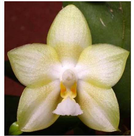
Phal. Yungho Gelb Canary ‘Joseph Wu’