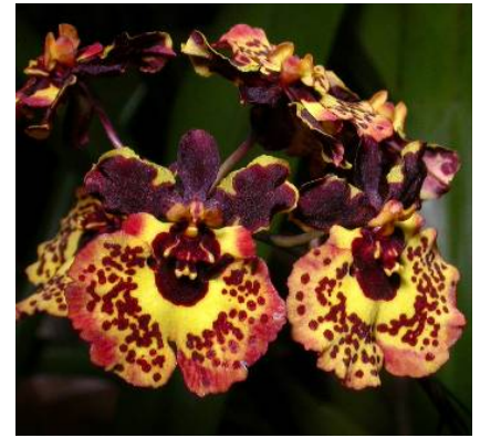
Tolumnia Sundown Reef ‘Spotted Ewok’

Blue – Tolumnia Sundown Reef ‘Spotted Ewok’ AM/AOS – Lentz/Morgan : This beautiful oncidium shows what 8 generations and 50 years of breeding in this group can accomplish, with colors and patterns that do not exist on any wild species of Tolumnia and nice full form. Ten different species of these Caribbean epiphytes have played at least some part in Tolumnia Sundown Reef . All of them grow near sea level, on twigs of shrubs and small trees, with dappled sunlight, constant breeze and high humidity. Since they have only their fleshy leaves for water storage, careful attention to the balance of water, humidity, air movement, temperature and light are important in growing these little beauties well. They like to be drenched, then to dry out fully. In greenhouse conditions, a mount is ideal, but when growing indoors, a small clay pot with a large chunks of bark, charcoal or lava rock are better to help keep a little better humidity around the roots.