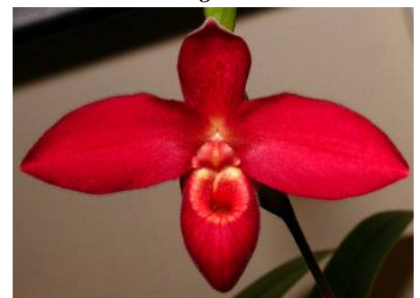
Phrag. Jason Fischer