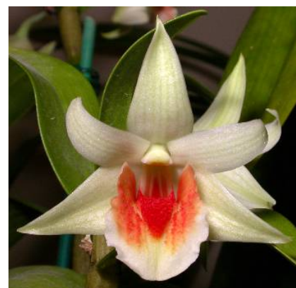
Dendrobium Green Lantern

Blue – Dendrobium Green Lantern – Weil : Den. Green Lantern belongs to the 'Nigrohirsute' group of Dendrobiums , so called because of the numerous short black hairs on the stems and even the leaves. It is composed of two species, Den. cruentum and Den. formosum , both from Southeast Asia. The Nigrohirsutes tend to prefer intermediate temperatures and bright light. They take lots of water and fertilizer in the growing season, but need a drier rest in winter to bloom well. The key to success, however, is to keep just enough moisture at the roots so that they neither dry out nor rot. A good open medium and a shallow pot are normally suggested.