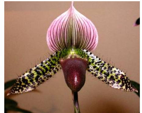
Paph. Raisin Jack ‘Jim Elmore’

Paphs. : Blue – Paph. Raisin Jack ‘Jim Elmore’ HCC/AOS – Lentz/Morgan : Paphiopedilum Raisin Jack takes advantage of just three species to achieve its striking presentation! Throughout the 1990’s individual clones earned a total of 21 flower quality awards from the AOS. Maybe the only reason there aren’t any new awards is due to the basic consistency of the cross in color, form and size. ‘Jim Elmore’ was the last awarded plant from this cross, receiving its HCC in October of 1997. All of the ‘Maudiae type paphs’ make fairly easy windowsill orchids and have the added plus of beautiful mottled foliage when not displaying one of their very long lasting flowers.