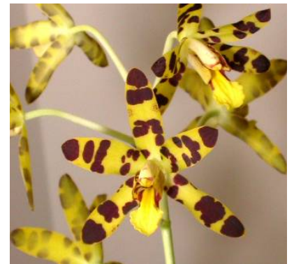
Ansellia gigantea var. nilotica