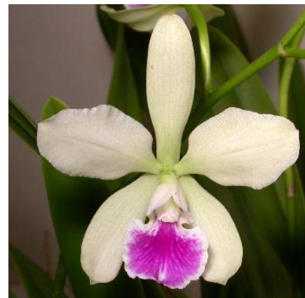
Catyclia El Hatillo ‘Pinta’