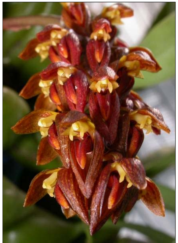
(above – both pictures) Trias sp.?