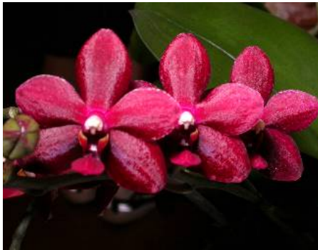
Dips. Brother Bloody Mary

tricolor ! Vanda suavis is found in the eastern part of Java and on Bali, and though there are a number of variant color forms, it typically has fairly large chestnut brown spots over a white background, and a purple lip. It can become a large plant, and will produce spikes of vanilla scented flowers throughout the year. It is more tolerant of lower light and cooler temperatures than many vanda species.