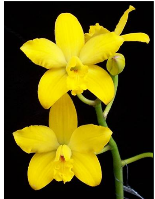
Laelia briegei, one of the Brazilian species.