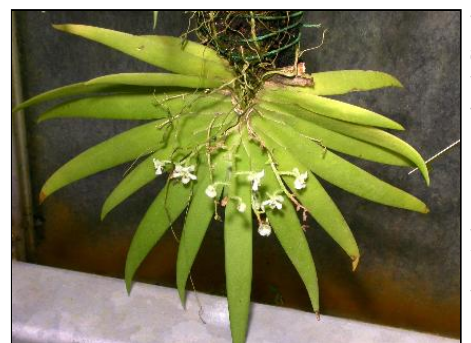
Grown by Atlanta Botanical Garden