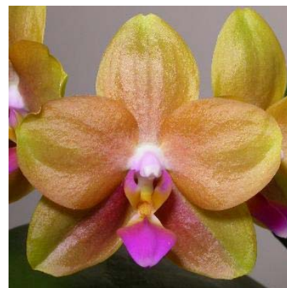
Dtps. Tzu Chiang Prince 'C#16'

(Blue) Dtps. Tzu Chiang Prince 'C#16' : Our blue ribbon winner in the Phalaenopsis Alliance this month illustrates the rapid pace at which hybridization has proceeded within this group, being the product of 12 generations of breeding utilizing 15 species along the way! As with many modern Doritaenopsis, the actual species Doritis pulcherrima is a mere blip in its family tree, appearing only once and 10 generations removed from present hybrid. The "C#16" probably stands for "Clone Number 16," as the Taiwanese breeder that produced this hybrid seems too occupied with producing new hybrids to give them traditional clonal names! It clearly shows the influence of both Phal. violacea and Phal. amboinensis , which appear several times each in the third and fourth generations of its ancestry. With this parentage, each spike should continue to produce successive flowers, a few at a time, for several years.