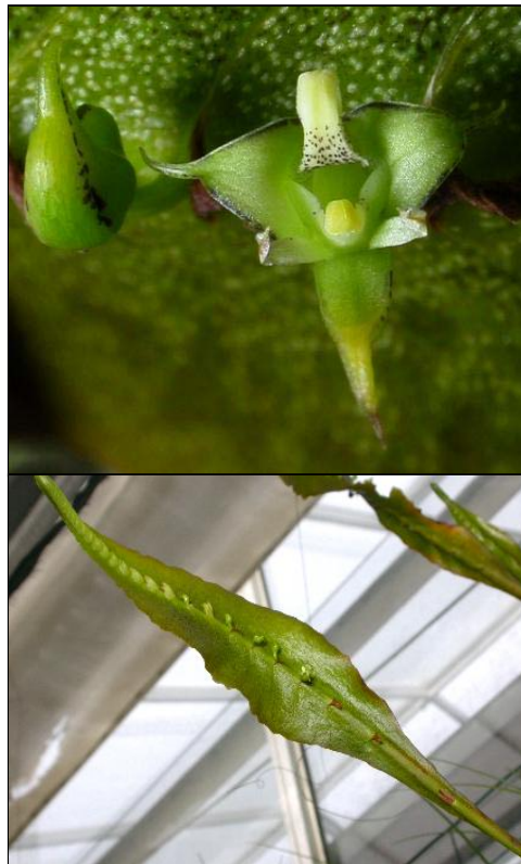
Bulbophyllum sp. (section Megaclinium )