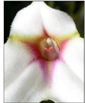
Masdevallia Exquisite Mary