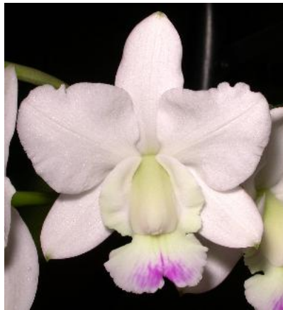
C. walkeriana fma. semi-alba 'Kenny'