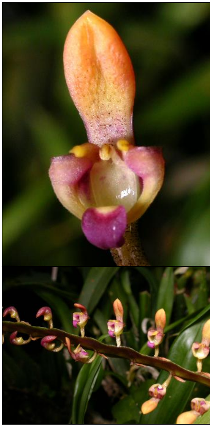
Bulbophyllum falcatum (section Megaclinium )