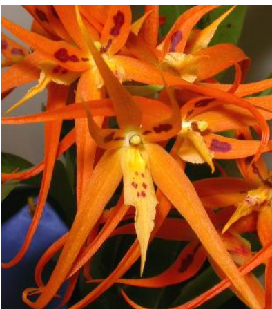
Brassada Orange Delight 'Starbek Orange'

(White) Maclellanara Pagan Lovesong 'Chocolate Thunder', HCC/AOS : Maclellanara combines Oncidium, Odontoglossum and Brassia, and this hybrid was introduced by the Rod McLellan Co. in 1978. Being the first to register this combination of genera, they choose the name for the man-made genus that all future crosses using the same combination would bear. Yet it is curious that the spelling is slightly different from the surname of the company founder! Whatever the reason for that, this was a very successful hybrid. It has captured 50 flower quality awards from the American Orchid Society, including a notable four First Class Certificates, as well as two Certificates of Cultural Merit! Although used extensively as a parent in additional hybrids, none have ever come close to receiving similar accolades from the judges.