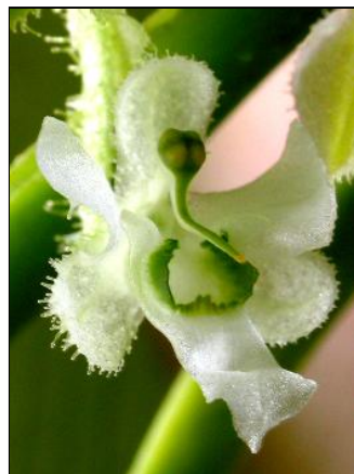
Grown by Atlanta Botanical Garden