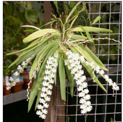
Grown by J&L Orchids