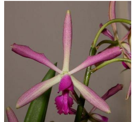
C. violacea x Enc. alata

(Blue) ( Cattleya violacea x Encyclia alata ) : This plant was one of several unusual and intriguing crosses purchased at the Redland International Orchid Festival from Plantio la Orquidea, a Venezuelan orchid nursery. This orchid event is unique for the number of Central and South American growers who attend, giving hobbyist collectors a chance to find plants otherwise not available in the U.S. In addition to some offbeat primary hybrids such as this ribbon winner, Plantio la Orquidea offered rare and unusual color forms of their native species such as C. lueddemanniana , C. mossiae , and C. percivaliana . The range of vendors in attendance insures that many other rare and unusual genera and species are available as well. Redlands will be held this May 19 -21 at an outdoor venue, the Fruit & Spice Park, in Homestead, FL. By the way, if by chance this cross is ever registered, it would be under the man-made genus Catyelia, introduced in 2004 to distinguish hybrids between Cattleya and Encyclia from those made with true Epidendrums, which are still registered as Epicattleya.