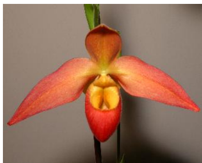
Phrag. Eric Young 'Puffin'

in less than two decades, Phragmipediums went from being somewhat obscure 'connoisseur' plants to a popular and important part of modern collections. The very recent discovery of Phrag. kovachii , yet another brilliant species which also possesses flowers of astounding size, assures that this orchid group will only become more popular in the future!