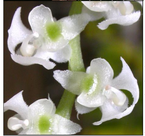
Grown by J&L Orchids