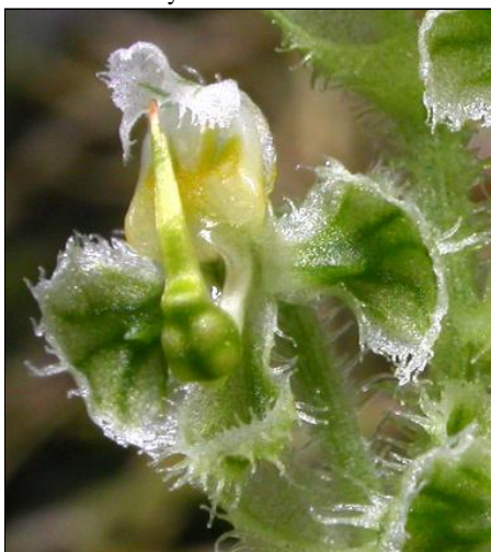
Grown by Atlanta Botanical Garden