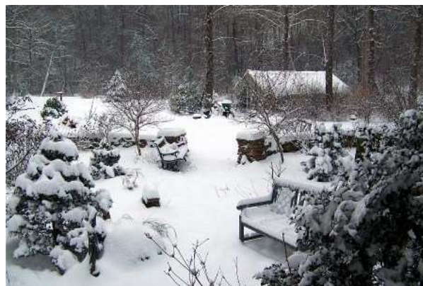
The snowy scene at Marble Branch Farms on January 10, 2011 was typical of conditions all across North Georgia and the Carolinas.

The meeting was canceled due to weather.