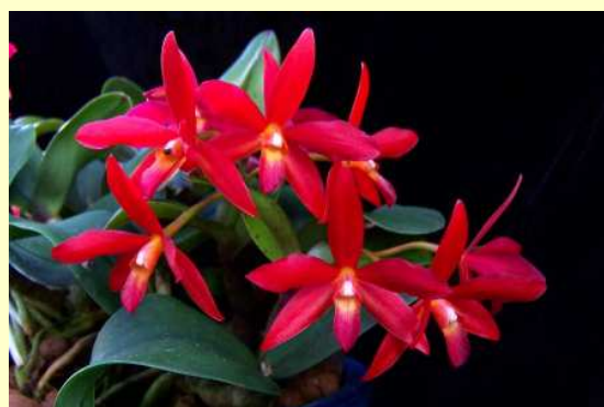
C. Doctor Frederick Schechter (milleri x cernua)

A curious 'micro-mini' we grow in a Bonsai pot! Blooms frequently.