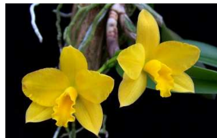
C. Yellow Warbler (Love Fresh x cernua )

We ship throughout the US and all over the world 5185 Conklin Drive Delray Beach, FL 33484 (561) 499 - 2810