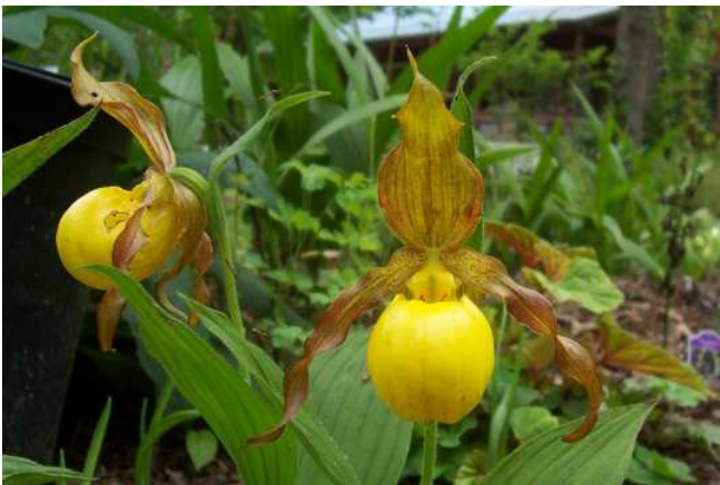
Cypripedium parviflora var. pubescens