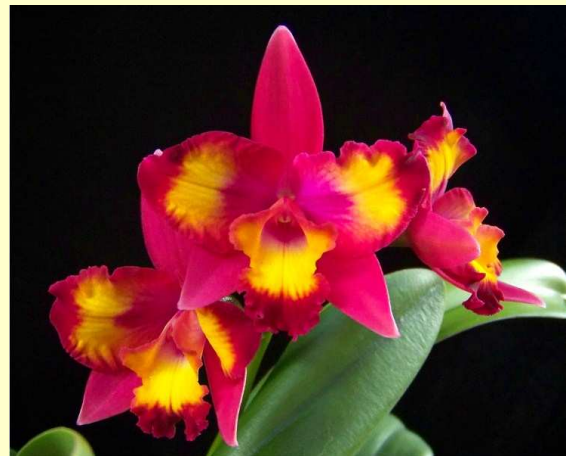
Cattleya Hawaiian Splash 'Lea'

A cute little miniature plant flower that blooms often with vivid colors.