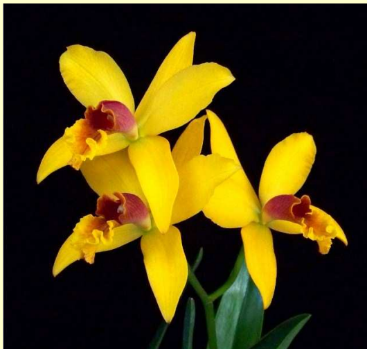
Rhyncolaeliocattleya Haw Yuan Moon ( Rlc. Waikiki Gold x C. briegei )

This one needs very high light to do well!