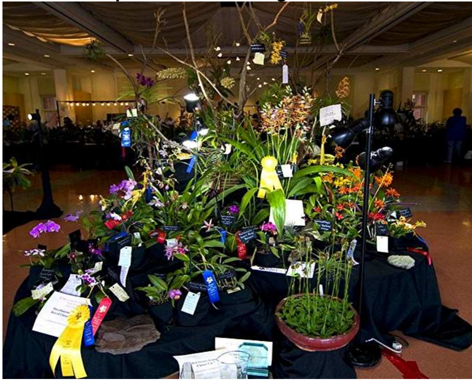
Atlanta Orchid Society Exhibit at our 2010 show.

Our show is rapidly approaching! We are hoping to see every member who possibly can participate in some way, large or small, to help make this event the best ever. This is our best opportunity to promote the interest and excitement of growing orchids to the public at large and meet potential new members we can invite to our meetings. Every contribution you can make of time and talent does that much more to make the overall result a success. It is also fun, exciting and satisfying to be involved in the behind the scenes efforts that help pull off a major event like this! Plus, we will be working inside a newly renovated Day Hall with improved lighting and flooring that will show off the displays and vendors better than ever.