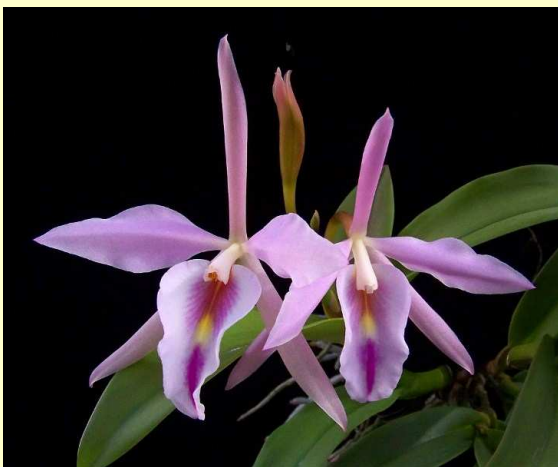
Epi. nocturnum x C. percivaliana

This is the first blooming of the only seedling that resulted from this cross!